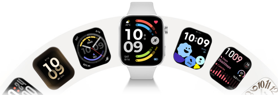
Image: Over 150 sport modes with accurate professional recording.

Quadranti eleganti e personalizzabili adatti a vari umori e stili. Supporta quadranti ritratto personalizzati che si sovrappongono all'ora, creando un capolavoro personale sul tuo polso.*