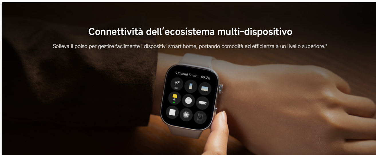
Image: Multi-device ecosystem connectivity, showing smart home controls on the watch.

Solleva il polso per gestire facilmente i dispositivi smart home, portando comodità ed efficienza a un livello superiore.*