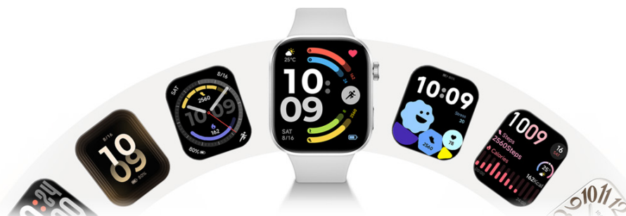
Image: Wide collection of customizable watch faces.

Quadranti eleganti e personalizzabili adatti a vari umori e stili. Supporta quadranti ritratto personalizzati che si sovrappongono all'ora, creando un capolavoro personale sul tuo polso.*