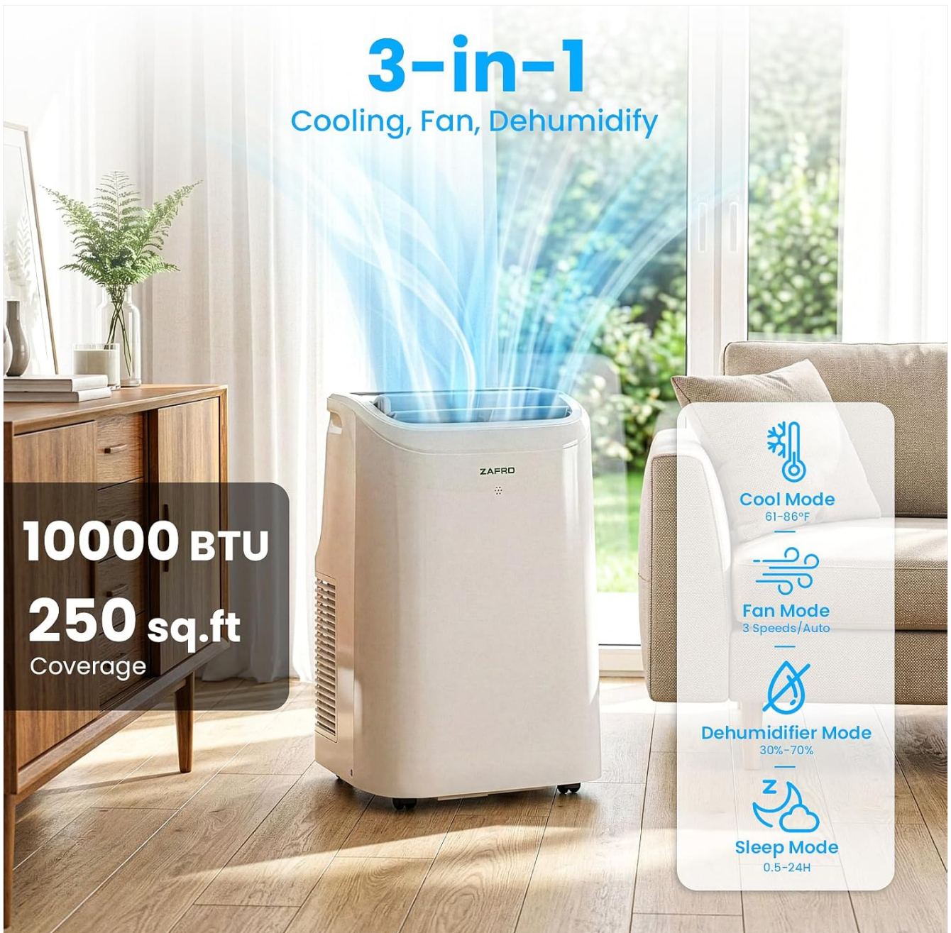
Image: The ZAFRO Portable Air Conditioner in a living room setting, illustrating its primary functions and coverage area.