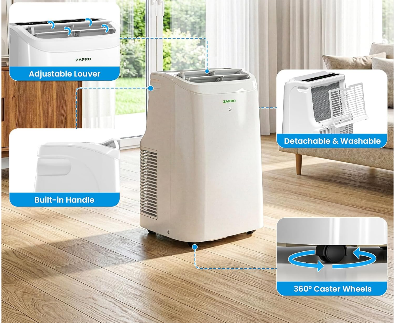
Image: Detailed view of the portable design features including adjustable louver, built-in handle, and caster wheels.