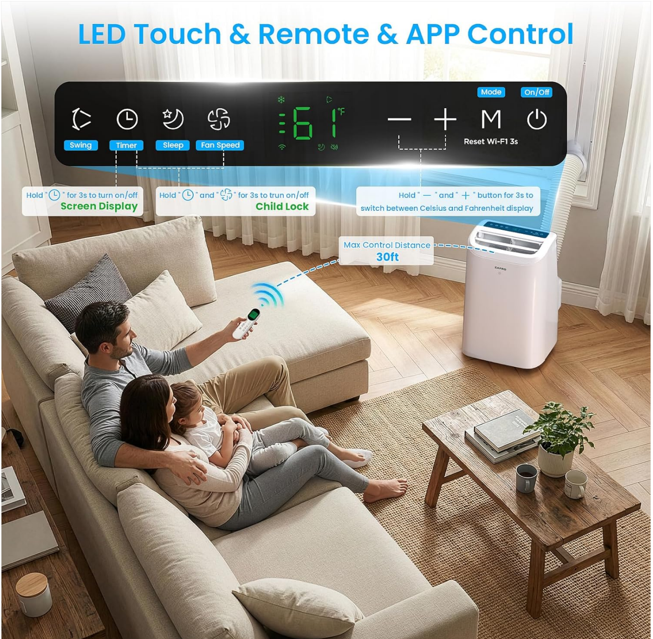
Image: Illustration of the unit's control panel and remote control in use, highlighting various functions.