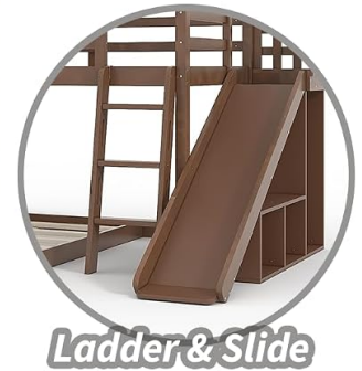
Image 5.1: Playhouse design with roof, window, guardrails, ladder, and slide.