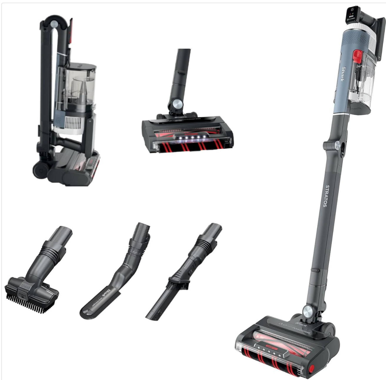
Figure 1: Main components of the Shark Stratos Cordless Vacuum.