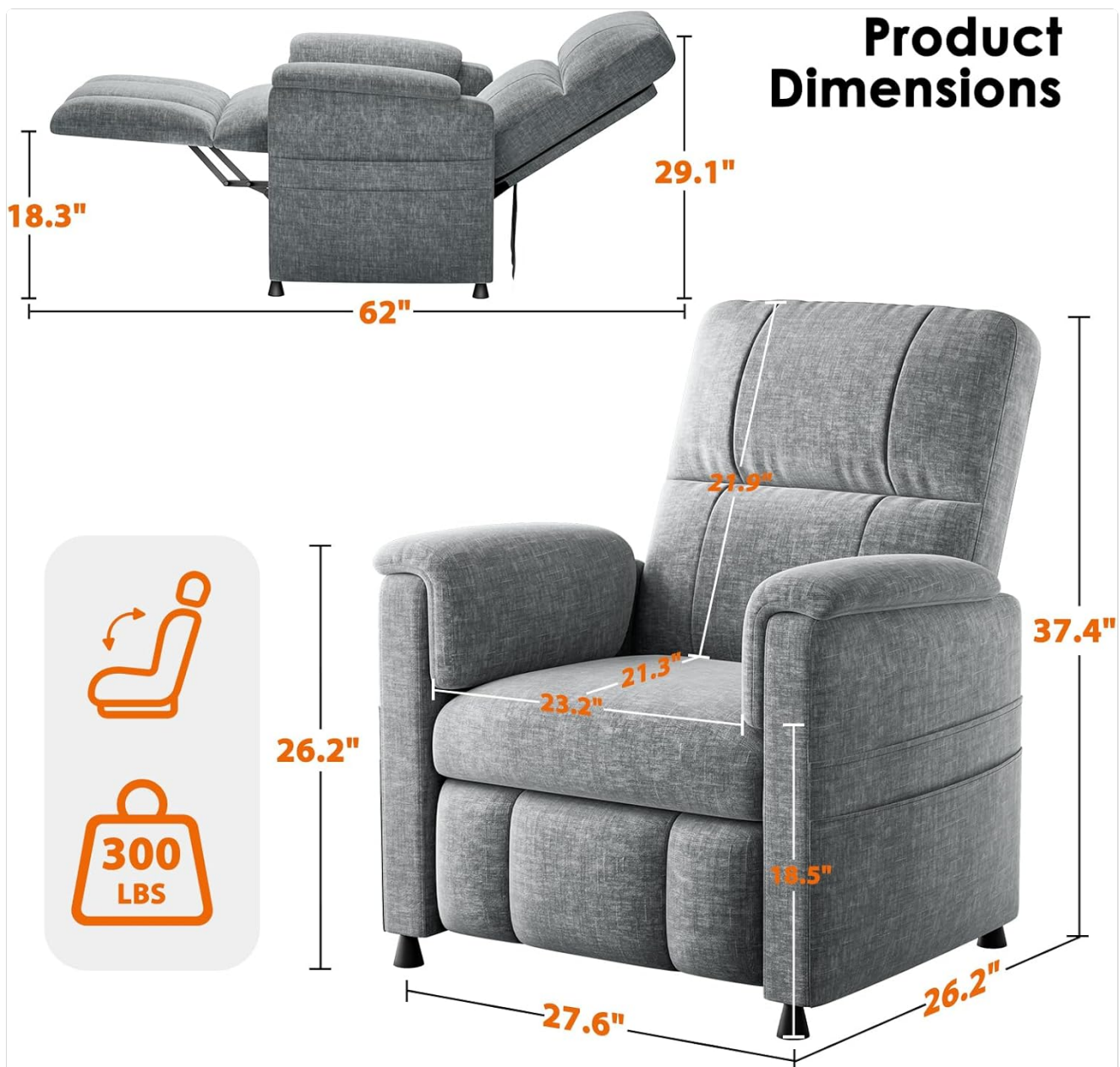
Figure 3.1: Product Dimensions. This diagram illustrates the overall dimensions of the recliner, including seat width, depth, and height, which can be helpful during assembly and placement.