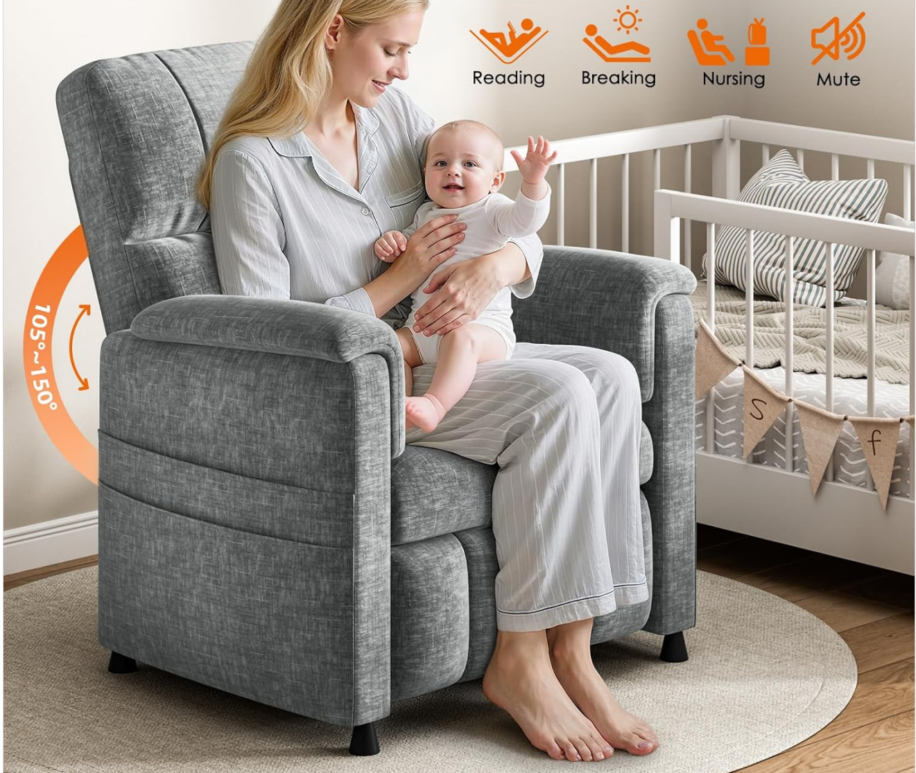
Figure 4.2: Seamless Recline. The chair's ability to adjust to various angles provides comfort for different activities, from upright seating to a gentle recline.