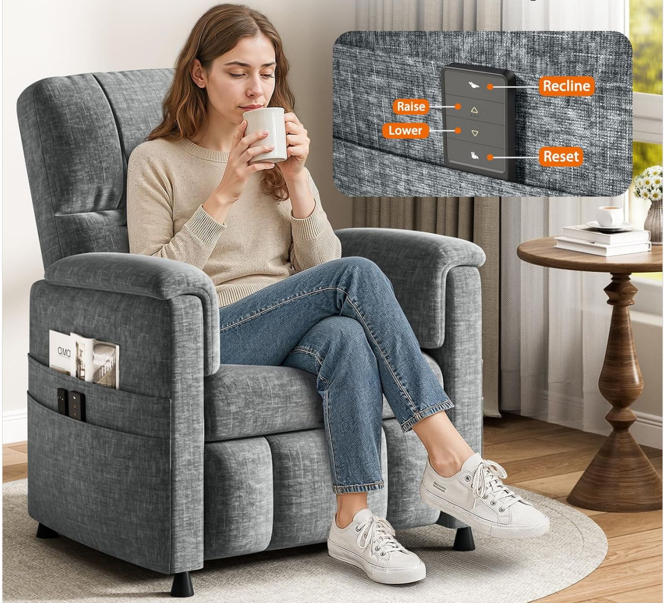
Figure 4.1: Remote Control. This image highlights the intuitive remote control, making it easy to adjust the chair's position for personalized comfort.