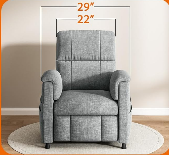
Wider & Deeper Seating