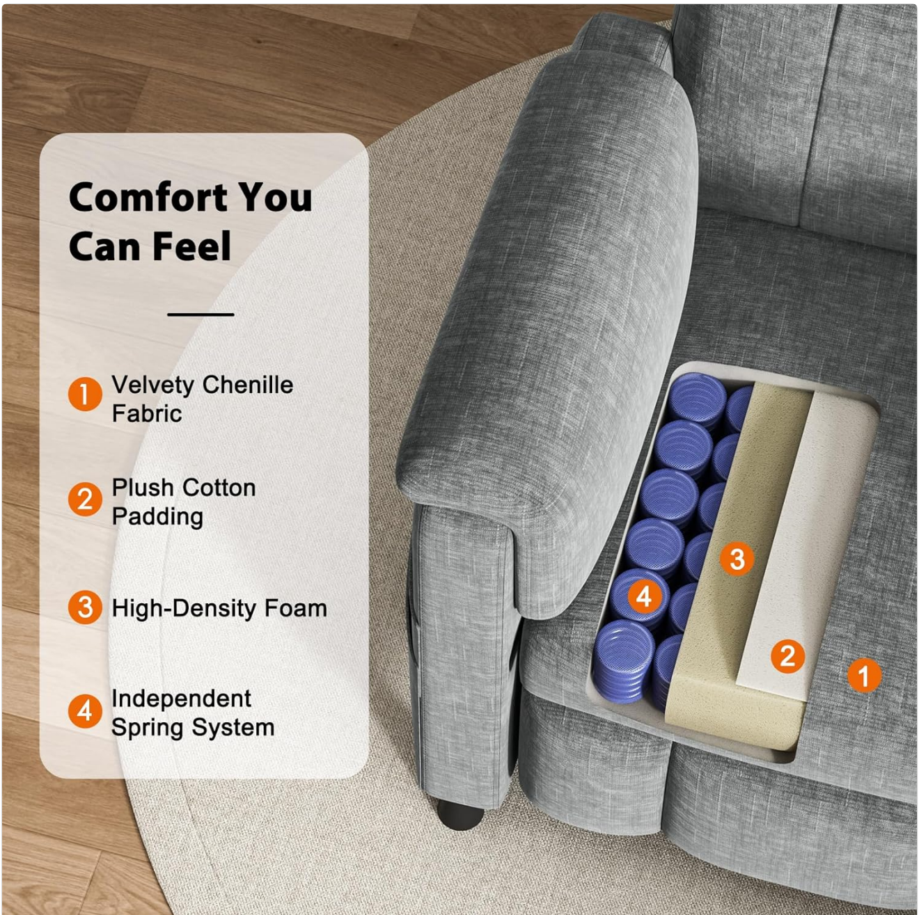
Figure 4.4: Comfort Layers. A detailed view of the internal construction, highlighting the quality materials used for optimal support and comfort.