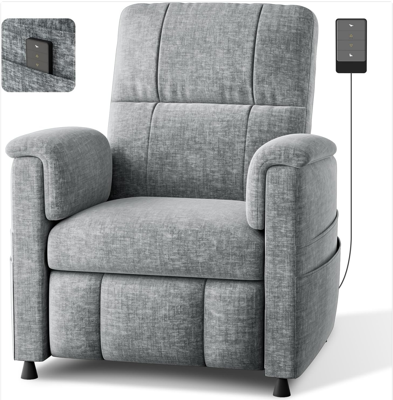
Figure 3.2: Assembled Recliner. A front view of the fully assembled recliner, showing its compact design and the remote control connected and ready for use.