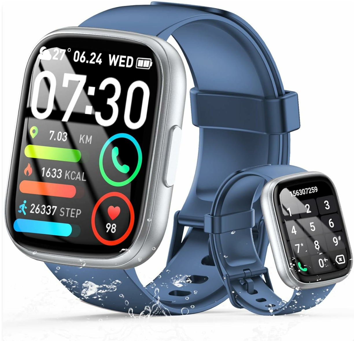
Image: The smartwatch displaying an incoming call, along with icons for built-in mic, Hi-Fi Spectra, call records, and 100 contacts. Examples of dial pad and contact list are also shown.