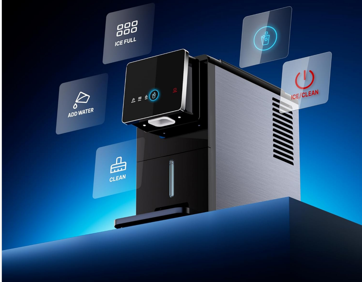
Figure 6.1: Intuitive control panel for the Silonn Nugget Ice Maker.