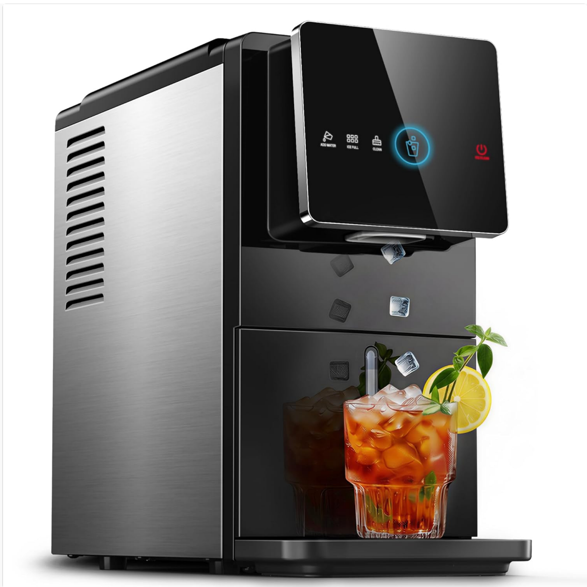
Figure 6.2: Hygienic ice dispensing directly into your cup.