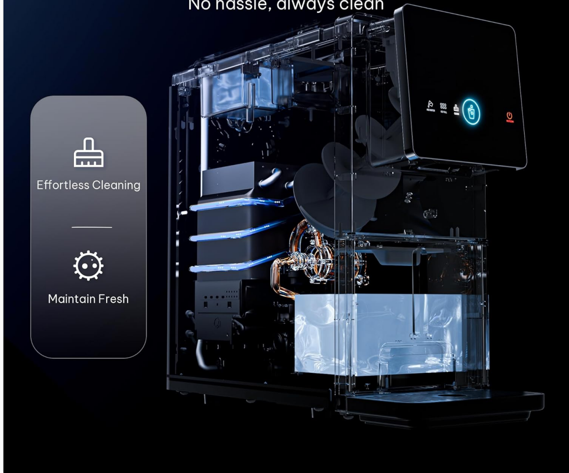
Figure 7.1: Internal view highlighting the self-cleaning mechanism.