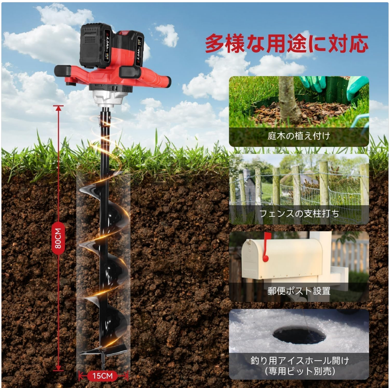
Image: This diagram illustrates the diverse applications of the earth auger, such as planting in gardens, installing fence posts, setting up mailboxes, and drilling ice holes for fishing (with a dedicated bit, sold separately).