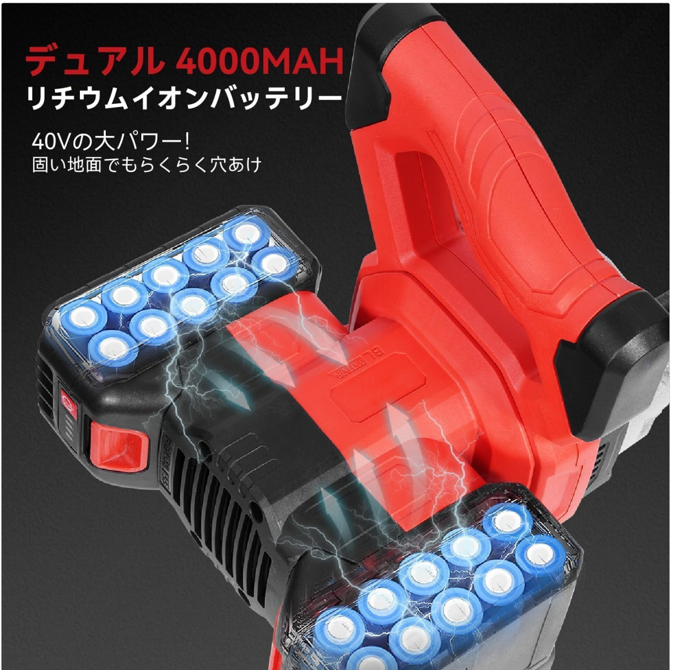
Image: This image highlights the dual 4000mAh lithium-ion battery system, providing 40V of power for easy drilling even in hard ground.