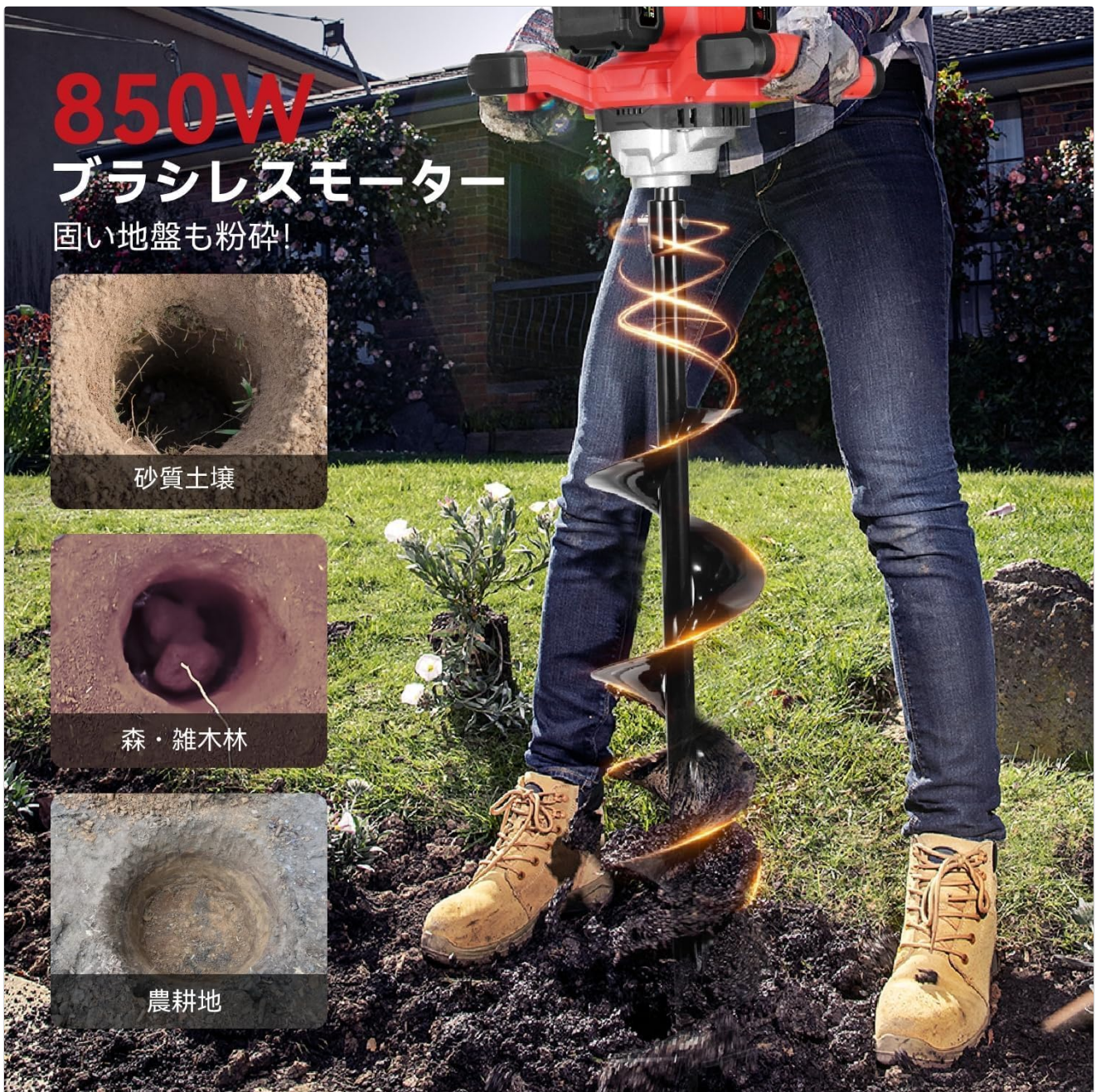
Image: The ONEVAN Cordless Earth Auger being used to drill holes in various soil types, including sandy soil, forest soil, and cultivated land. This illustrates the product's primary function and versatility.