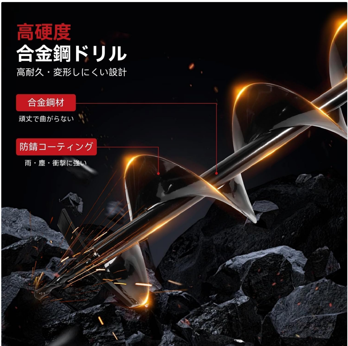
Image: A detailed view of the high-hardness alloy steel drill bit, highlighting its robust construction and anti-rust coating for enhanced durability against weather and impact.