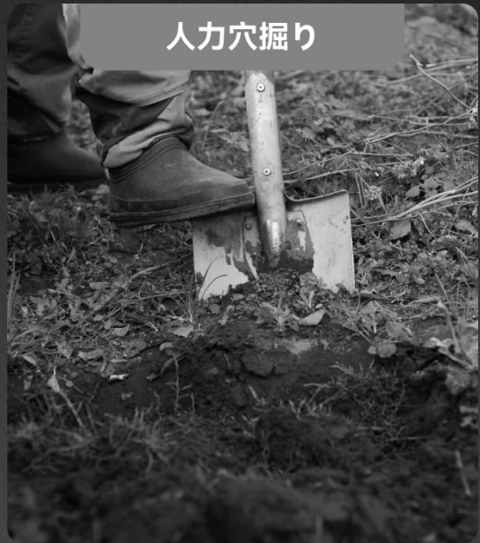
Image: A comparison illustrating the advantages of the ONEVAN Cordless Earth Auger over traditional gasoline-powered and manual digging methods, emphasizing its lightweight, portability, battery operation, and environmental friendliness.