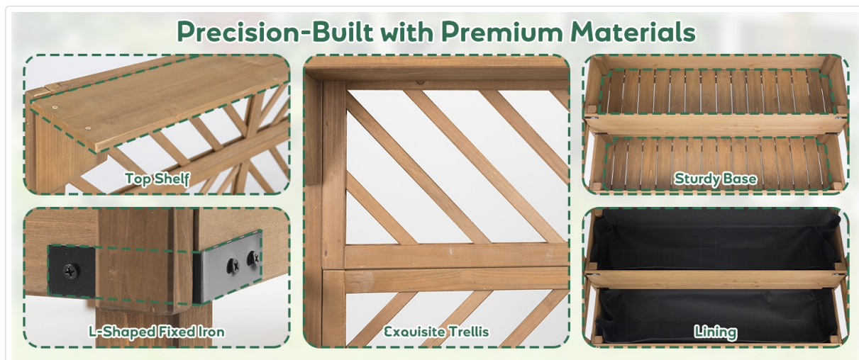
Image: The fully assembled garden bed, highlighting its sturdy construction with reinforced L-brackets and smooth, snag-free lattice for climbing plants.