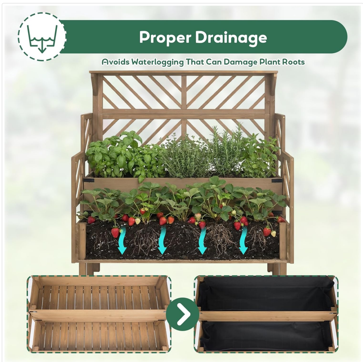
Image: Illustration of the proper drainage system within the planter boxes, showing how water flows through the soil and is prevented from waterlogging by the fabric liner and drainage holes.