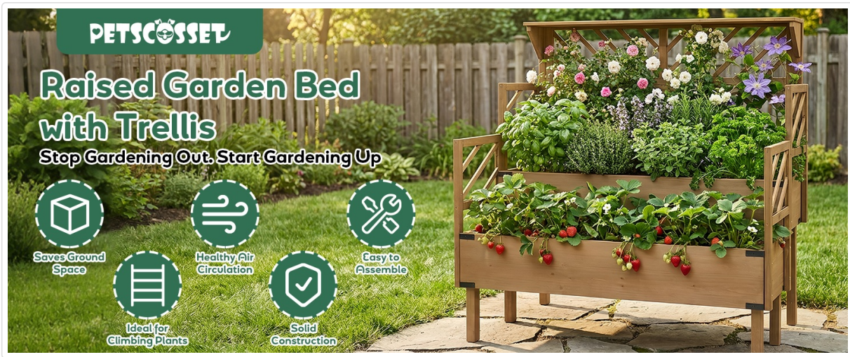
Image: The garden bed in use, illustrating the top display shelf, hooks for gardening tools, and the trellis supporting climbing plants. The lower tier is filled with herbs and strawberries.