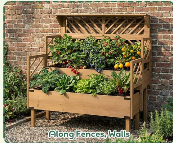
Image: Examples of suitable placement options for the raised garden bed, demonstrating its versatility in different outdoor environments.