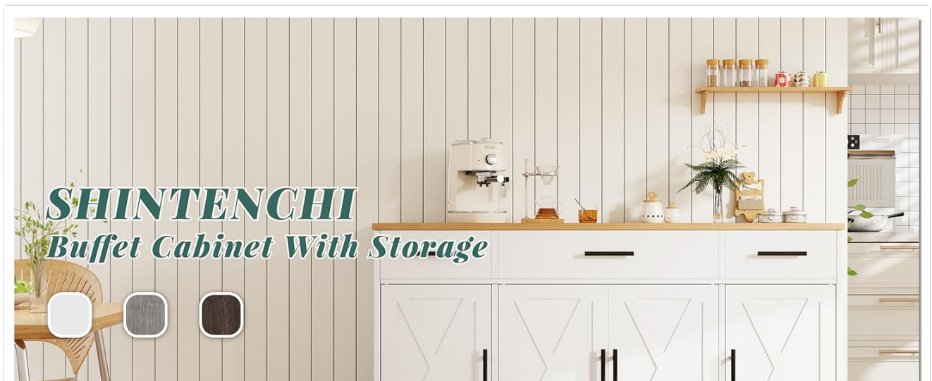
Figure 8: Overview of the Shintechi Buffet Cabinet, highlighting its design and available color options.