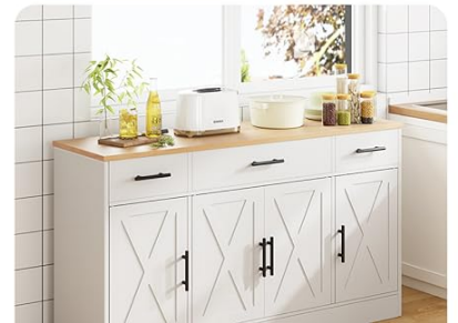
Figure 9: The buffet cabinet shown in multiple room scenarios, demonstrating its versatility.