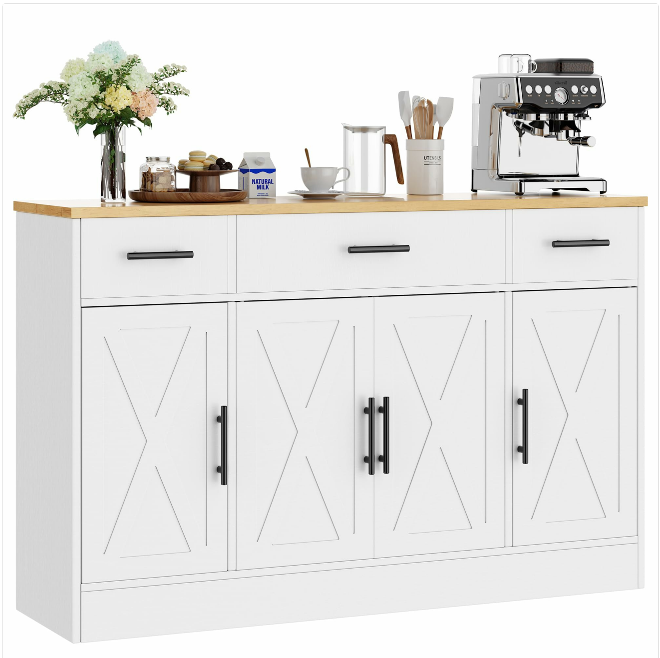
Figure 1: Front view of the Shintenchi Buffet Cabinet with Storage.