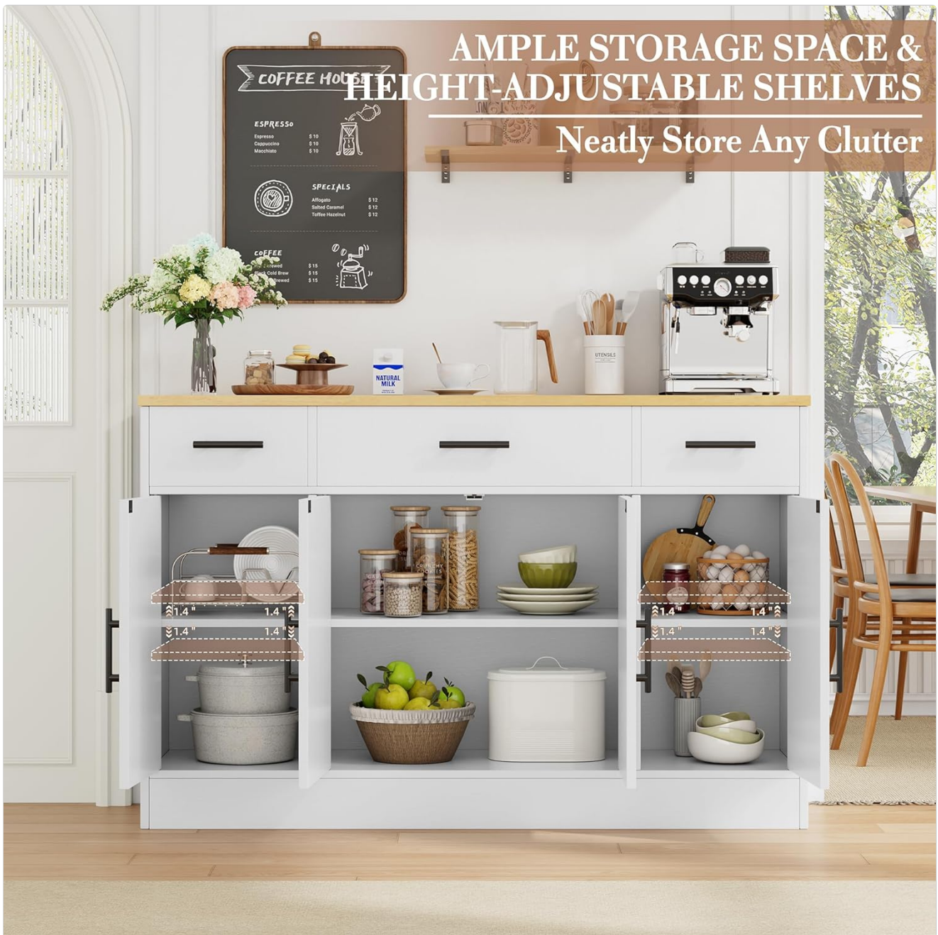
Figure 4: Open drawers demonstrating storage capacity and organization possibilities.