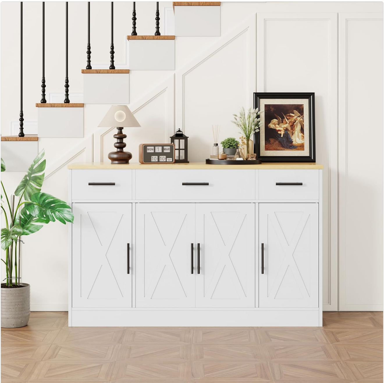
Figure 2: Detailed front view of the assembled buffet cabinet.