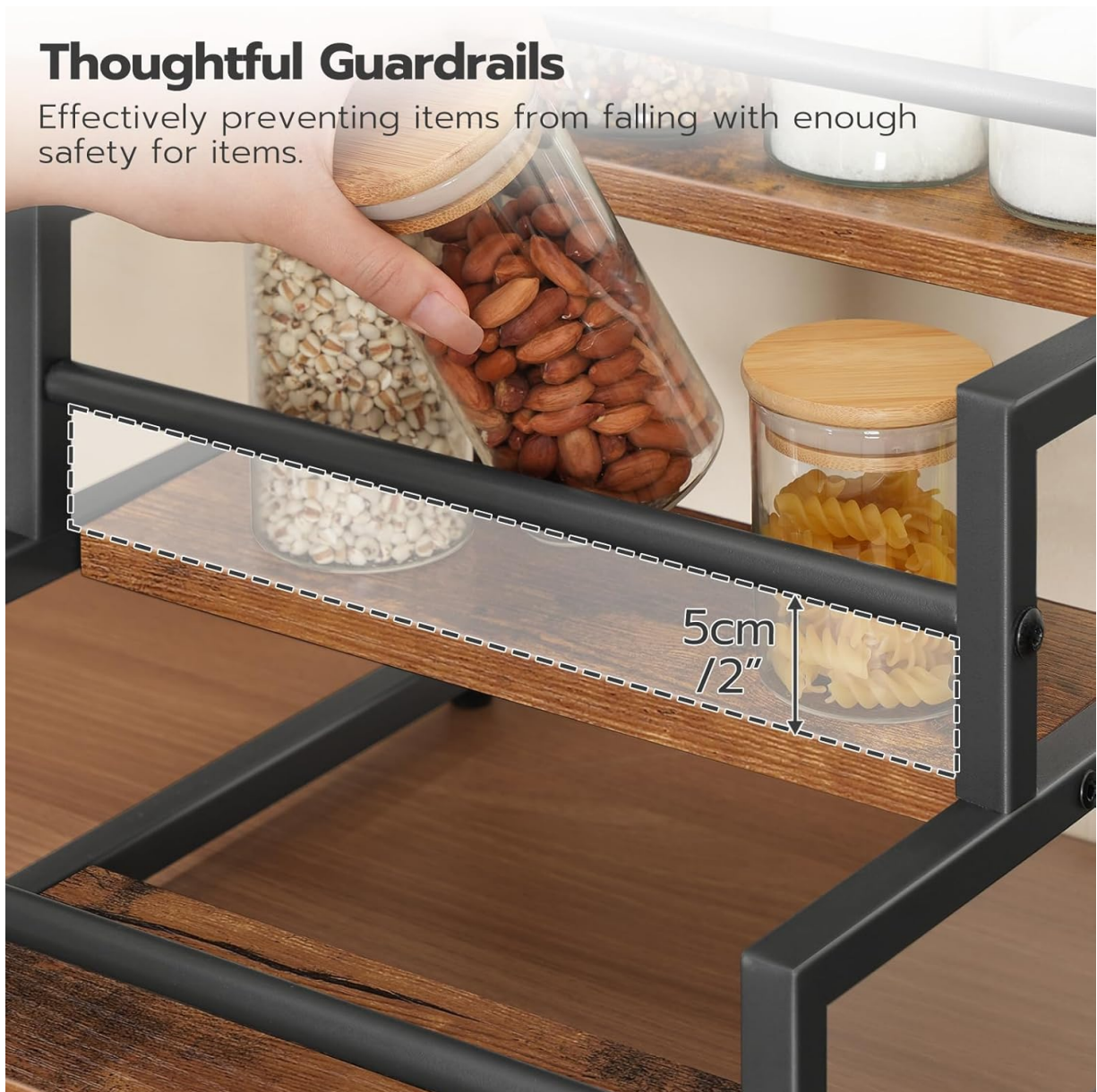
Figure 4.4: A close-up view of the thoughtful guardrails on the coffee syrup rack, illustrating their height and function in securing items.

Effectively preventing items from falling with enough safety for items.