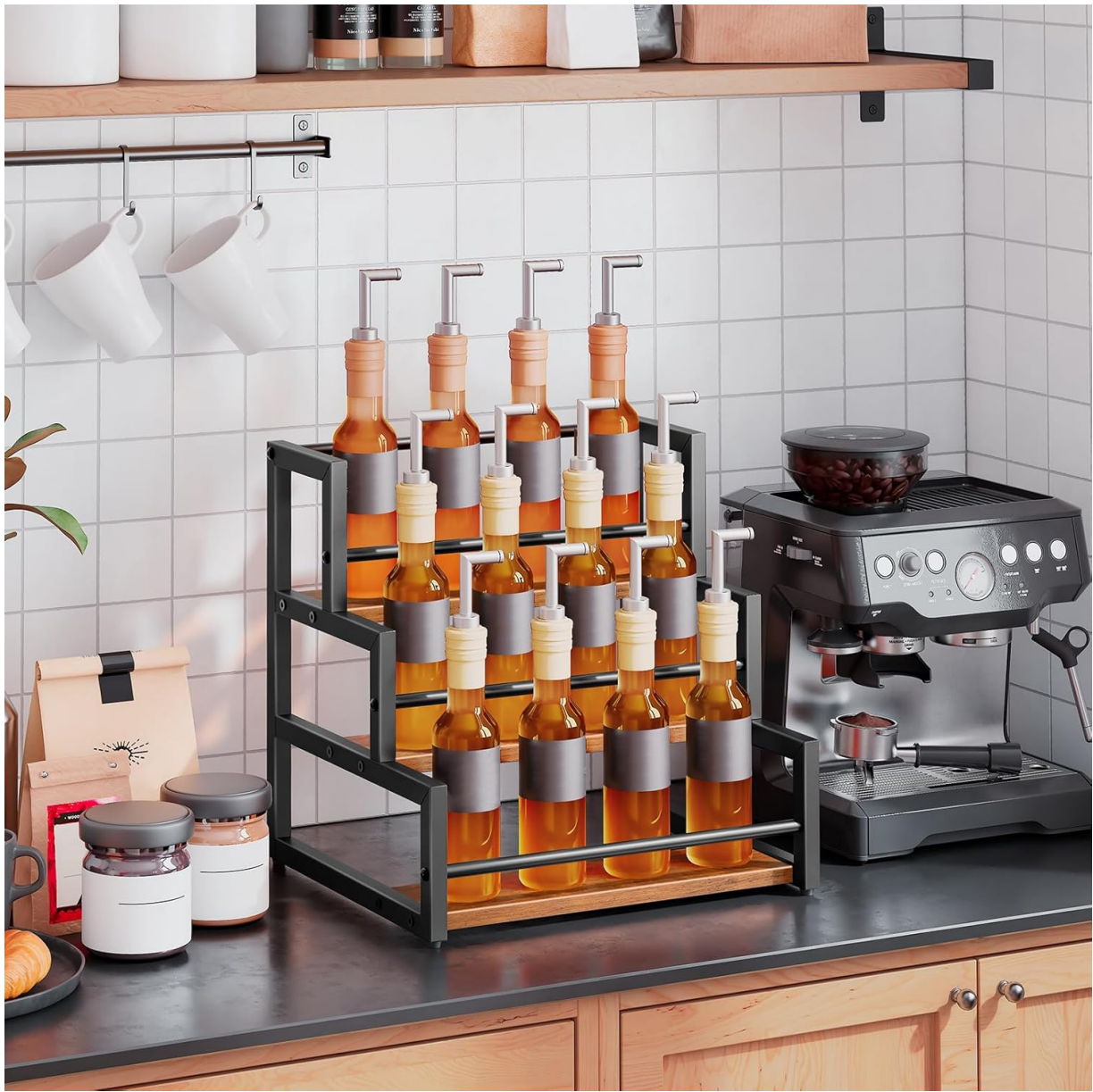
Figure 4.3: The HOOBRO Coffee Syrup Rack (BF38JJ01) on a kitchen counter, organized with coffee syrup bottles, demonstrating its practical stepped design.