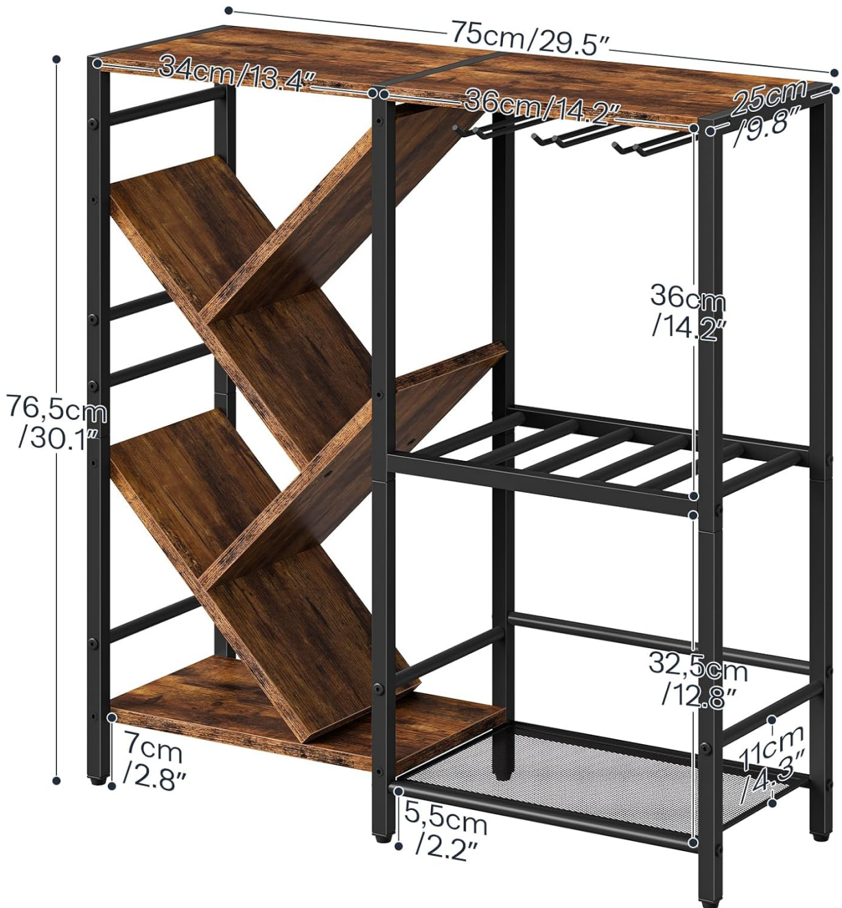
Figure 3.1: Detailed dimensions for the HOOBRO Wine Rack (BF36JJ01), showing overall length, width, height, and internal shelf measurements.