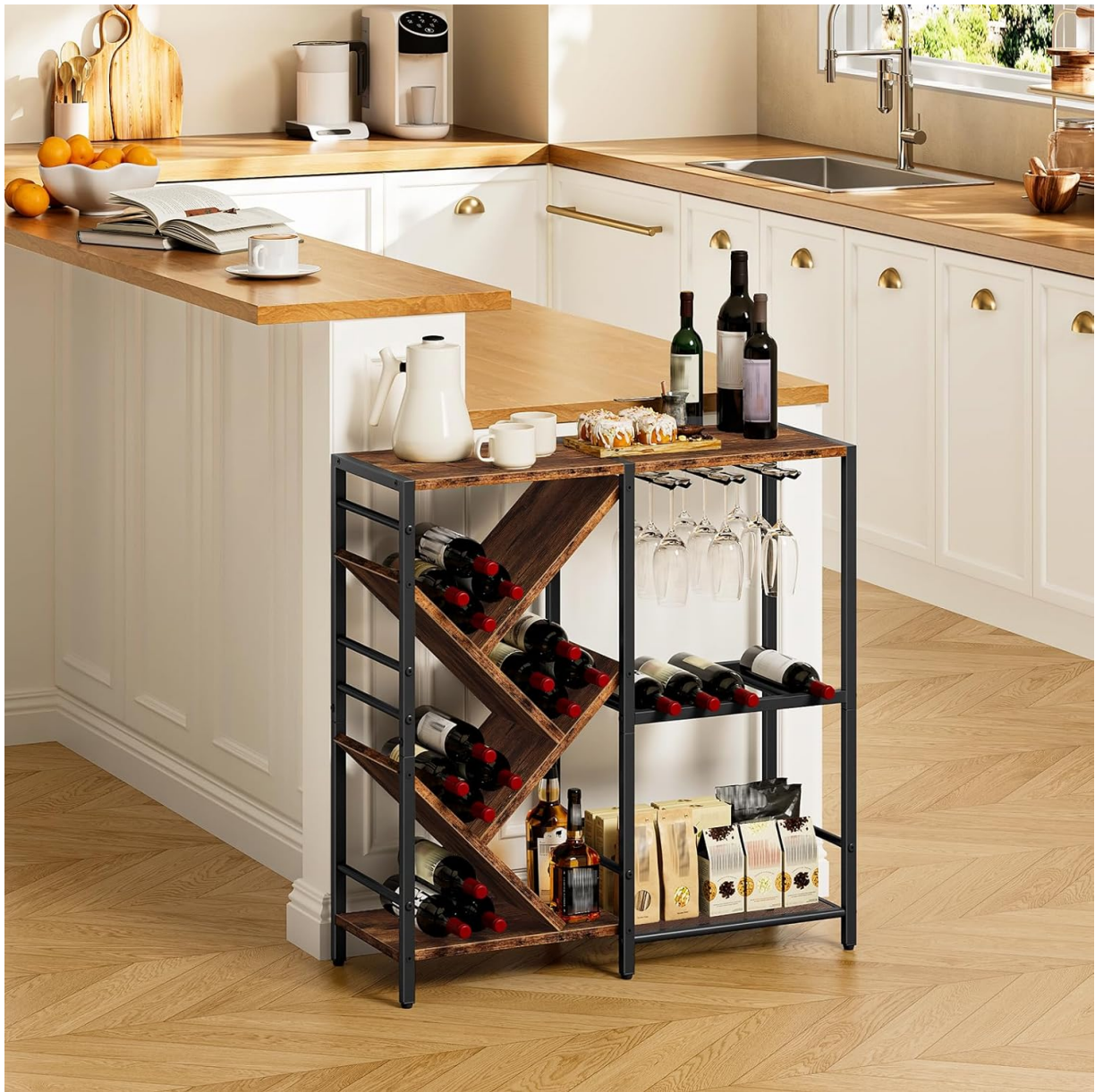
Figure 4.1: The HOOBRO Wine Rack (BF36JJ01) positioned in a kitchen, showcasing its capacity for wine bottles, glasses, and a top shelf for barware.