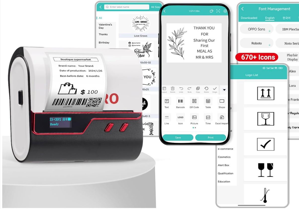
Image: A smartphone displaying the "4BarCode" app, showcasing multiple label templates and customization options.