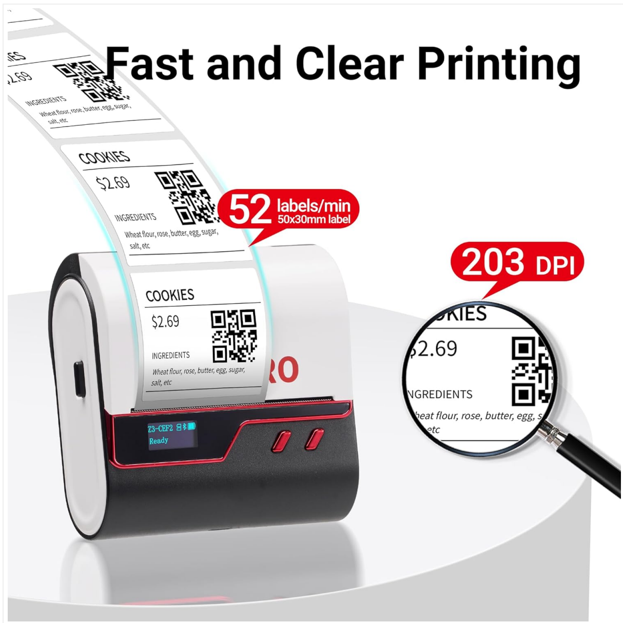
Image: A collection of labels printed by the ORGBRO Z3, showcasing different designs, text, and graphics for various applications.