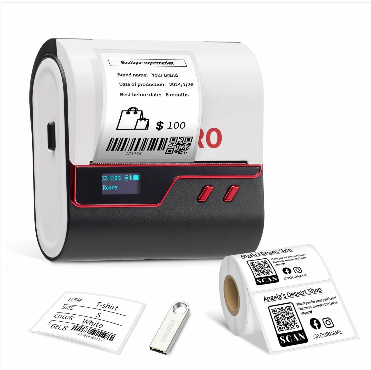
Image: The ORGBRO Z3 Label Maker Machine, featuring a sleek red and black design, ready for use.