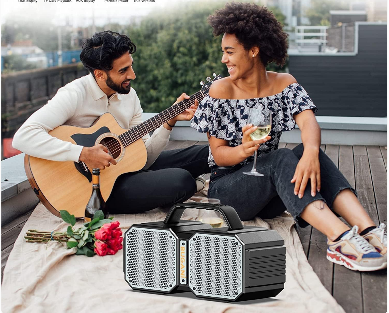
Image: The BUGANI Shock Bluetooth Speaker in an outdoor setting, highlighting its versatility with USB charging, TF card playback, AUX input, and True Wireless Stereo capabilities.