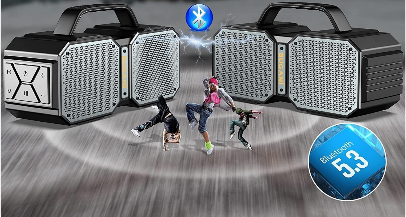
Image: Two BUGANI Shock Bluetooth Speakers demonstrating True Wireless Stereo (TWS) pairing for an enhanced 120W audio experience.

Pair TWO speakers together to get 120W super powerful stereo