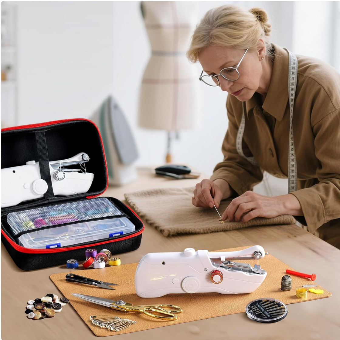
Image: Complete 109-piece sewing kit contents, including the handheld sewing machine, threads, needles, scissors, and other accessories, neatly arranged.