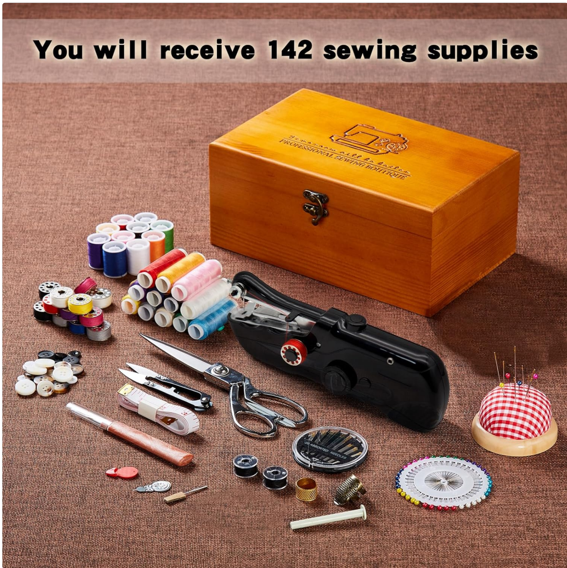
Figure 2.1: All 142 included sewing supplies.