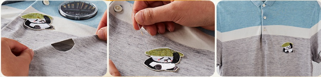
Figure 5.2: Examples of repairing torn pants and clothes with holes.