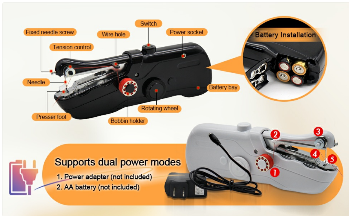
Figure 3.1: Key components and dual power modes of the handheld sewing machine.