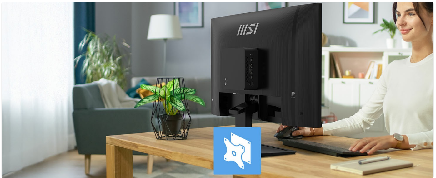
Image: The MSI PRO MP273 E14A monitor demonstrating its VESA mountable design, shown with a mini-PC attached to the back for a compact setup.