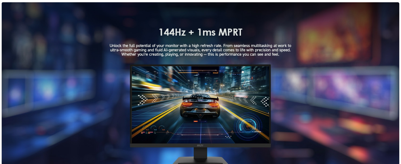
Image: The MSI PRO MP273 E14A monitor showcasing its 144Hz refresh rate capability during a fast-paced game scene, labeled "144Hz Game Ready".