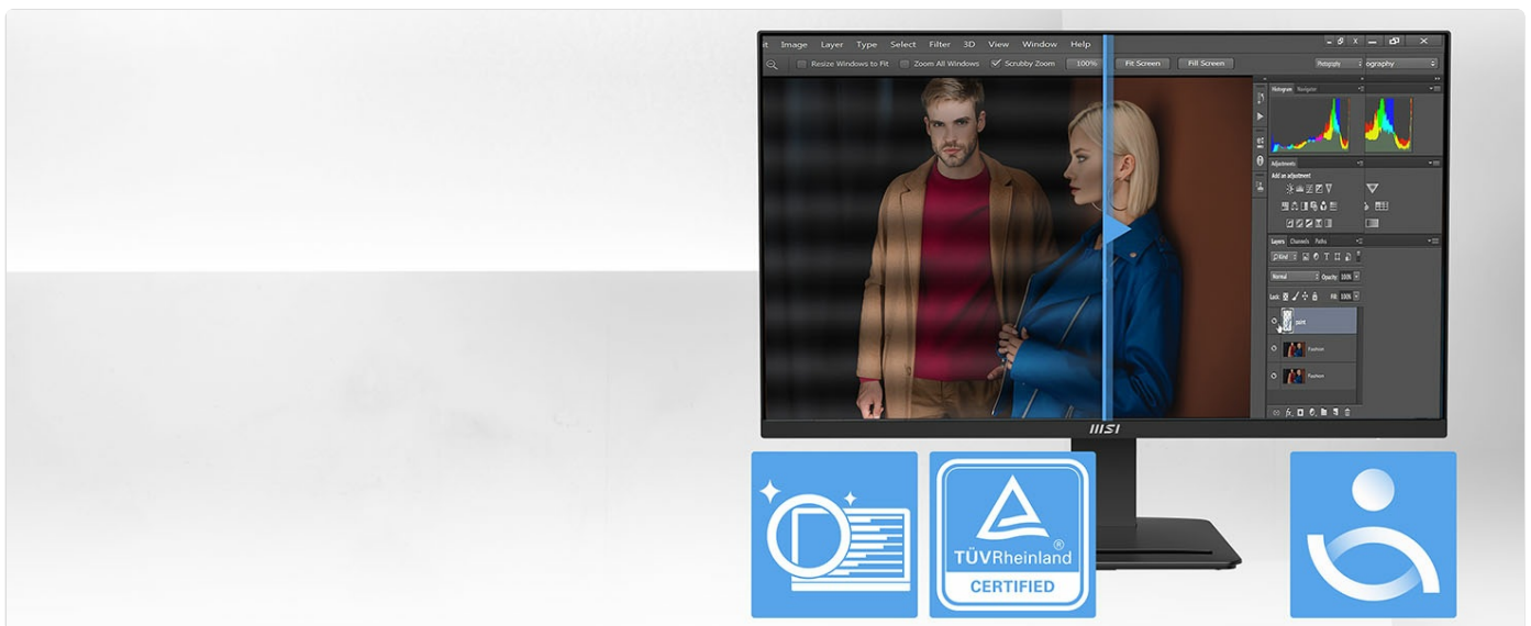
Image: The MSI PRO MP273 E14A monitor displaying image editing software, with icons representing its premium eye comfort features like Less Blue Light and Anti-Flicker.