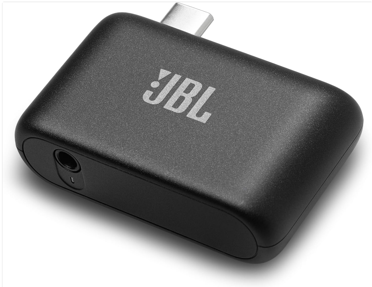
Image: Detailed product specifications including dimensions and weight of the JBL EasySing Mic Mini.