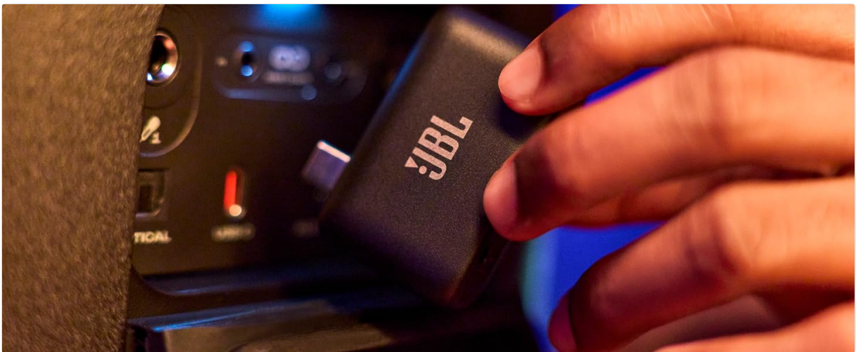
Image: The AI dongle being connected to a compatible device via USB-C.

Compatibility Note: The EasySing Mic Mini is compatible with JBL Boombox 4, JBL Xtreme 5, JBL Charge 6, JBL Flip 7, JBL Grip, JBL Go 5, newer JBL Portable speakers, and all JBL PartyBox models through either USB-C or Aux. It also works with other speakers that support Aux-in or UAC.