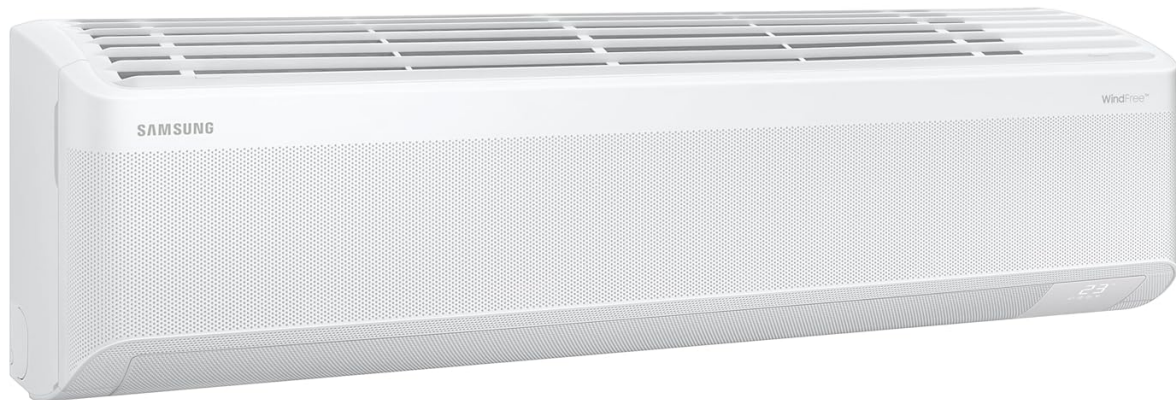
Figure 3.1: Indoor Unit of the Samsung Bespoke AI Inverter Smart Split AC. This image shows the sleek white design of the indoor unit with the Samsung logo and "WindFree" branding.