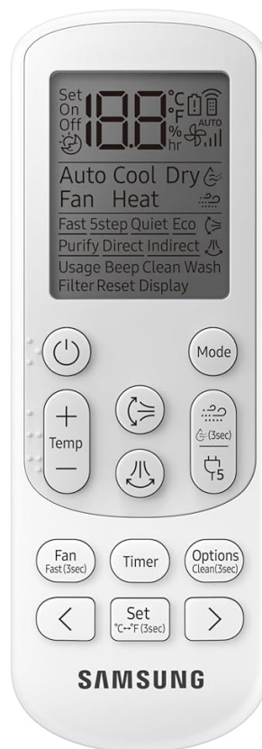
Figure 3.3: Remote Control for the Samsung Bespoke AI Inverter Smart Split AC. This white remote features a digital display and various buttons for controlling modes, temperature, fan speed, and special functions.