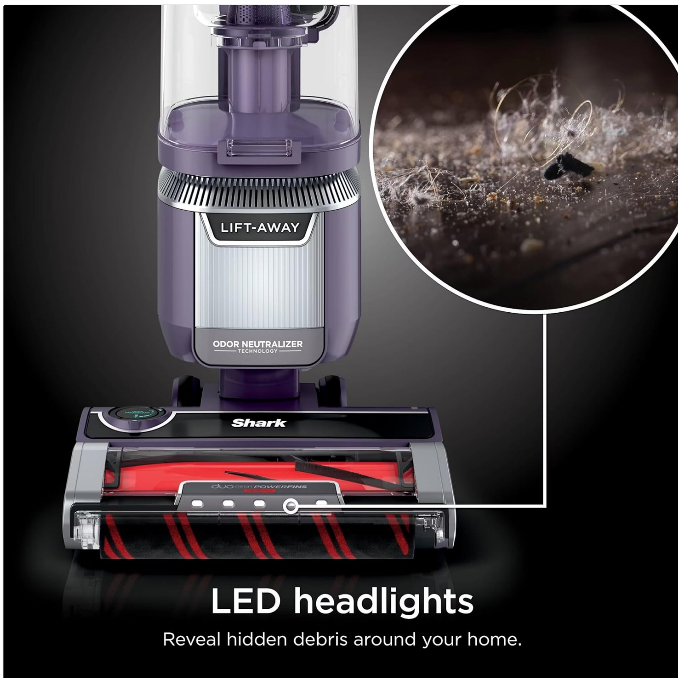
Image: The LED headlights on the vacuum nozzle revealing hidden dirt and debris on the floor.