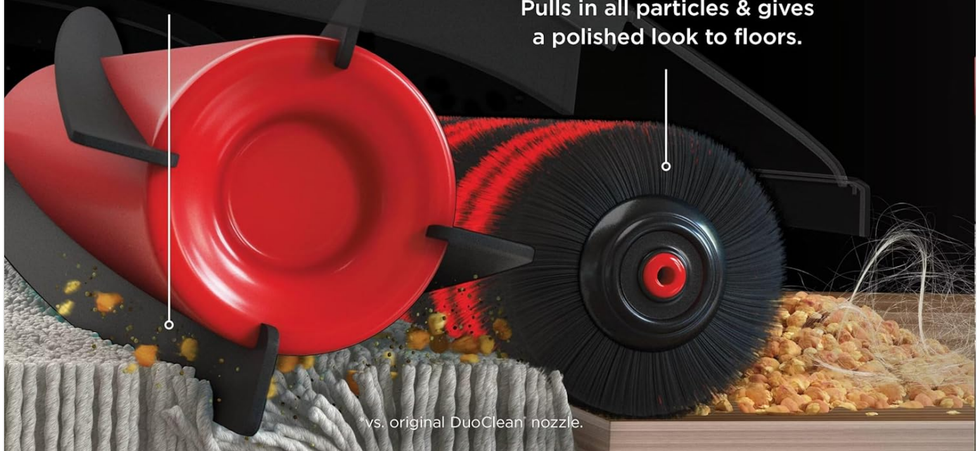
Image: Detailed view of the DuoClean PowerFins HairPro brushroll system, highlighting its dual cleaning action.

Pulls in all particles & gives a polished look to floors.