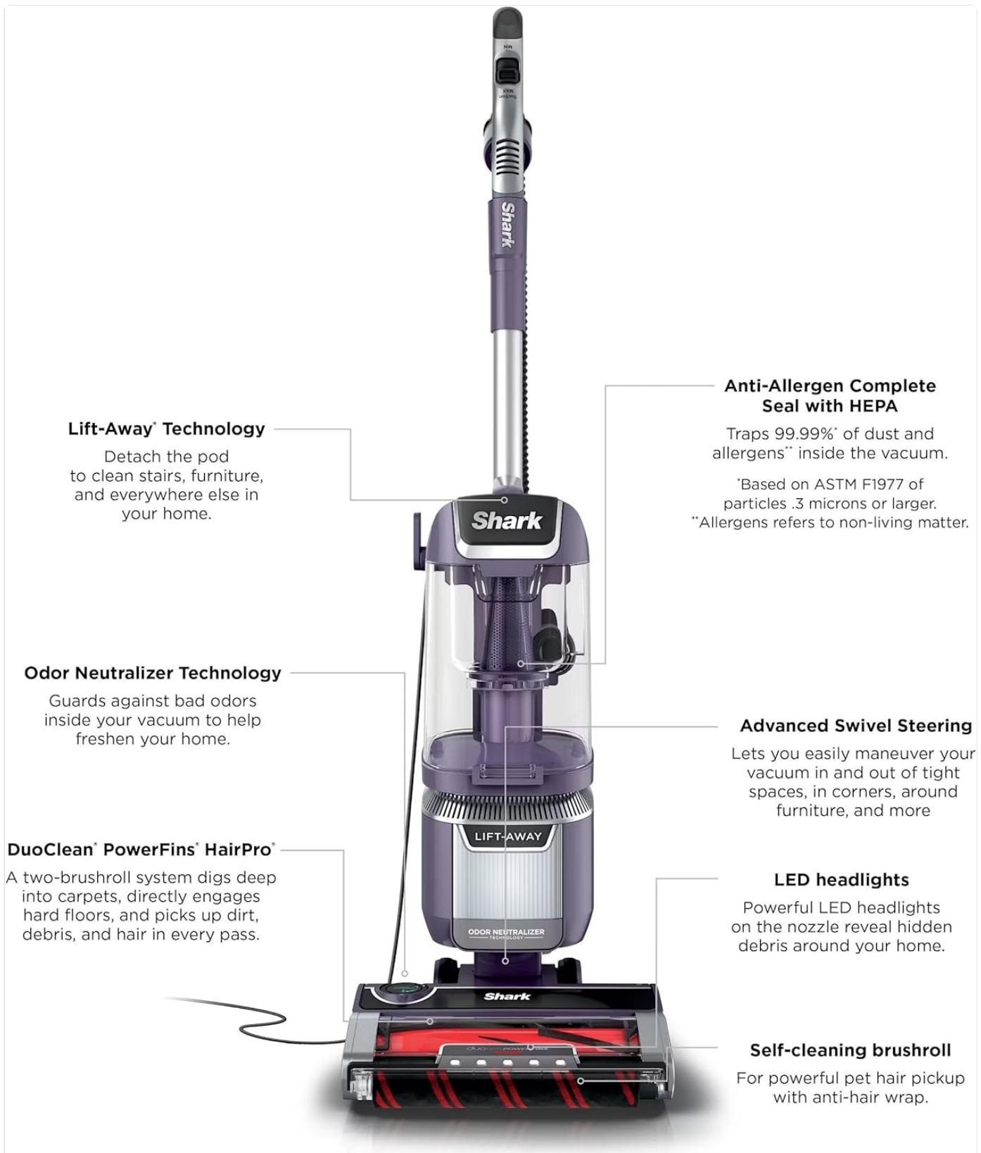
Image: An annotated diagram illustrating the main parts and assembly points of the Shark LA701 vacuum cleaner.

5. Store accessories on the onboard posts.