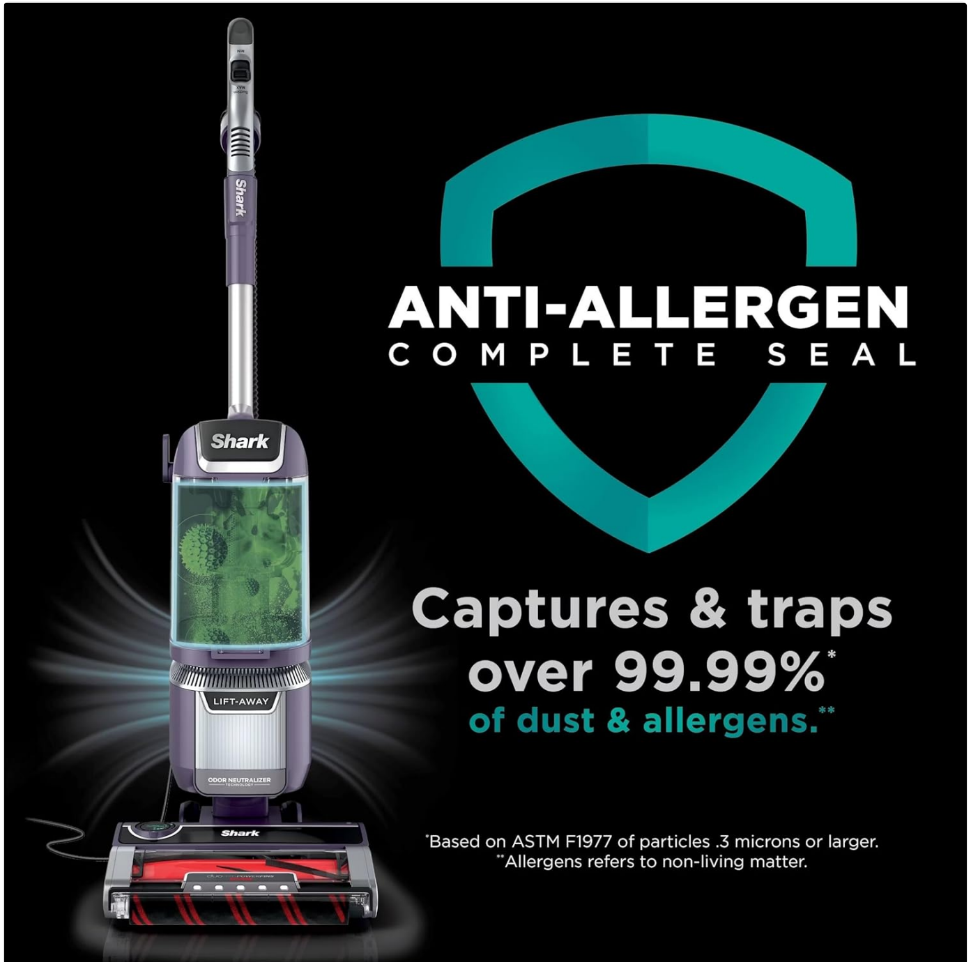
Image: Visual representation of the Anti-Allergen Complete Seal technology and HEPA filter, highlighting its effectiveness in trapping dust and allergens.

The Anti-Allergen Complete Seal with a HEPA filter captures and traps over 99.99% of dust and allergens inside the vacuum.