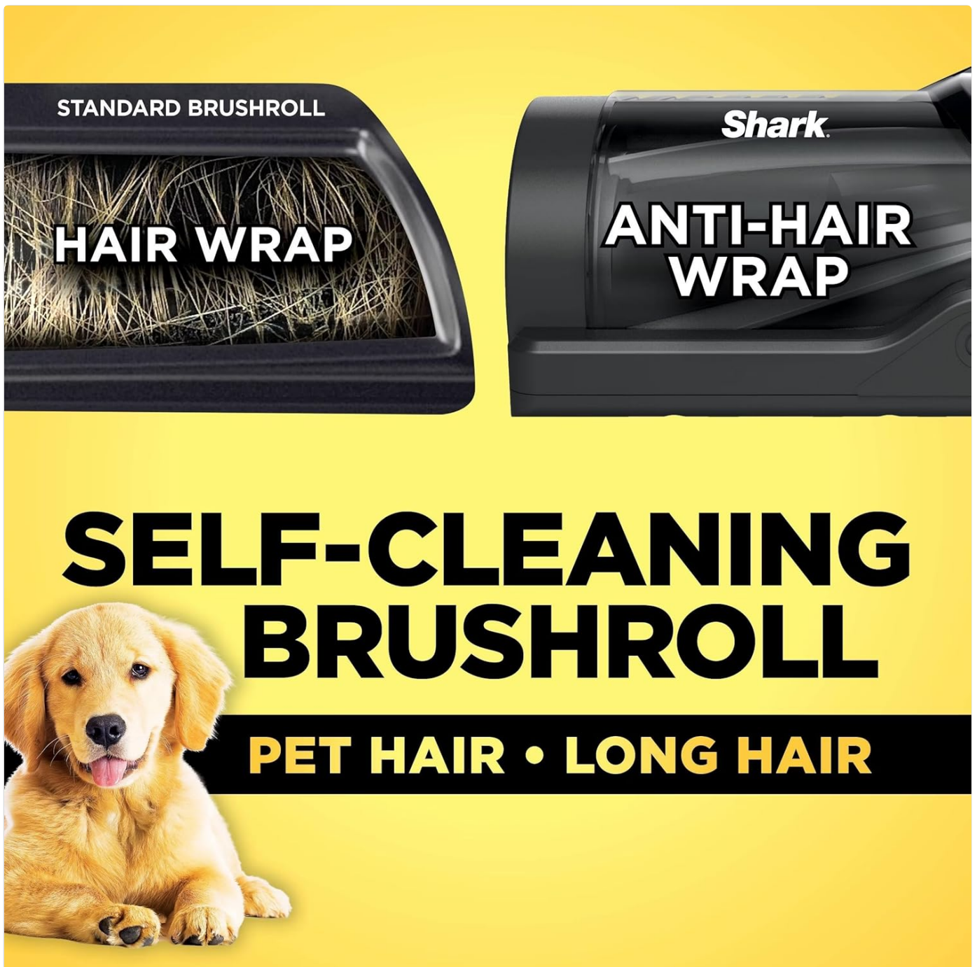
Image: A visual comparison demonstrating the effectiveness of the self-cleaning brushroll against hair wrap.