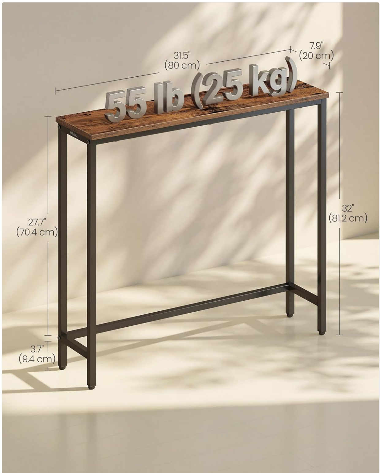
Image: A detailed diagram illustrating the dimensions of the console table, including height, width, and depth, along with its weight capacity.