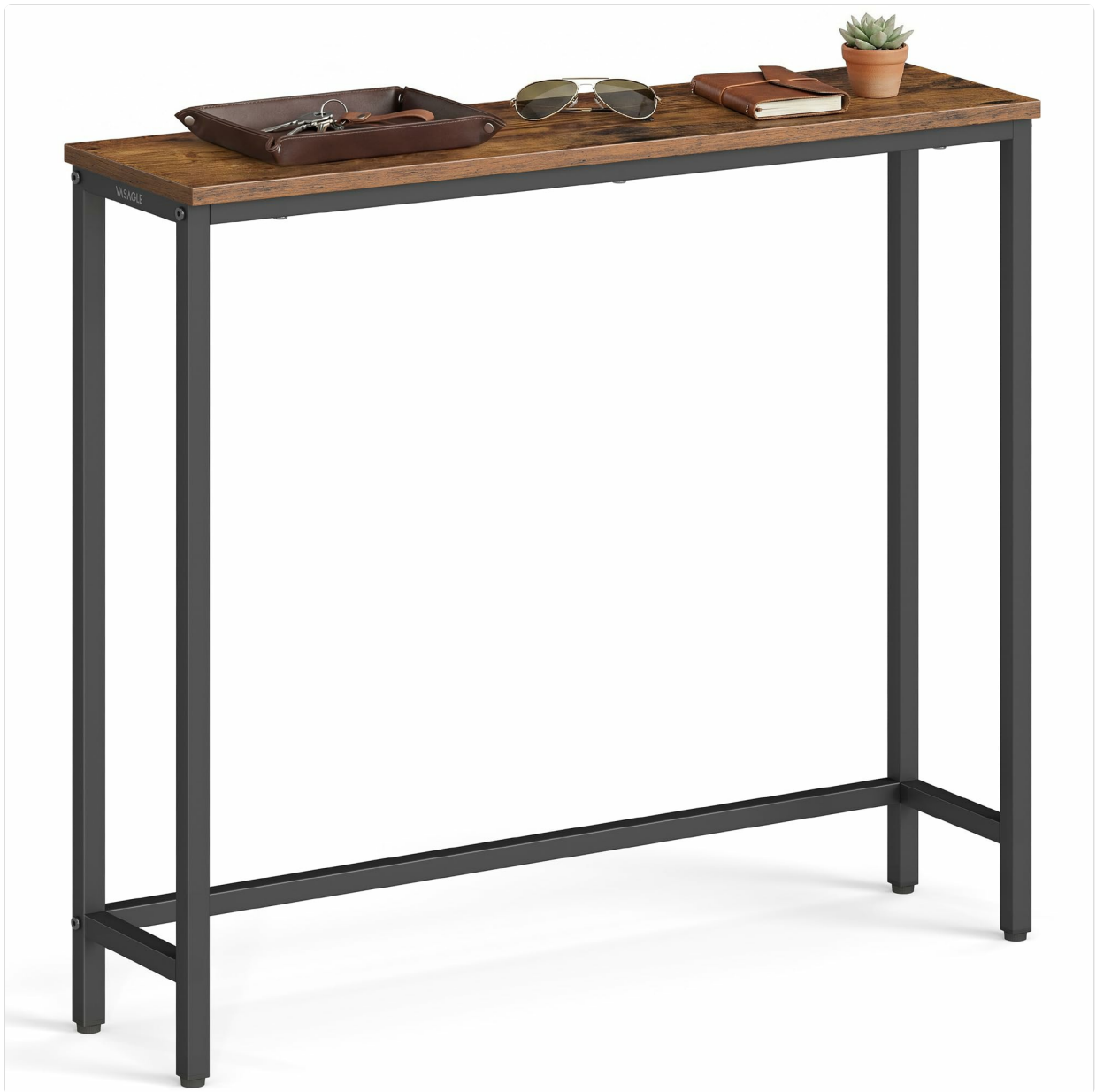
Image: The VASAGLE BARNET Console Table, showcasing its slim design and rustic brown top with an ink black steel frame, suitable for an entryway.