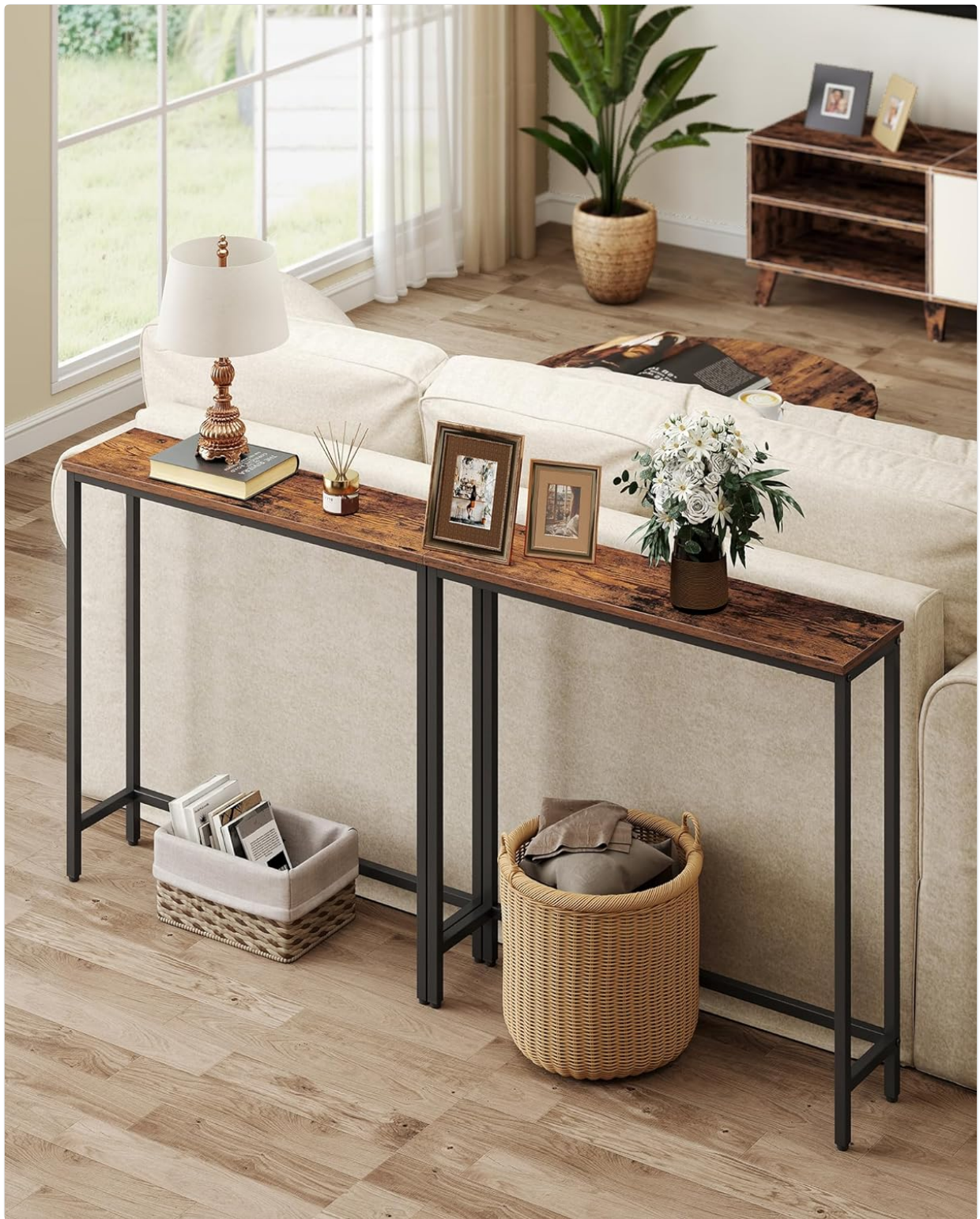
Image: The console table positioned behind a sofa, demonstrating its use as a convenient surface for living room essentials and decor.

Your browser does not support the video tag.