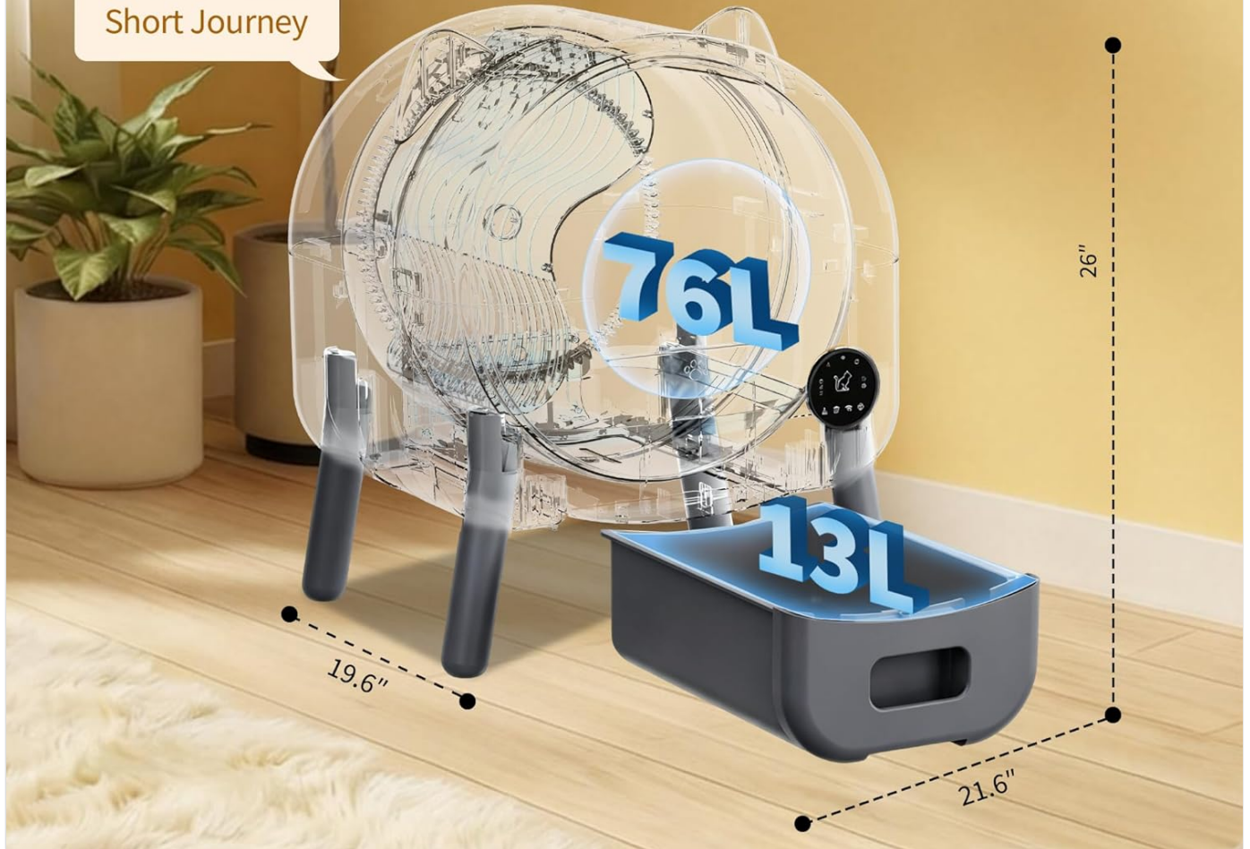
Image: The SunnyFurn Self-Cleaning Cat Litter Box showing its 76L litter drum and 13L waste bin capacity, along with product dimensions (26 inches height, 19.6 inches width, 21.6 inches depth).