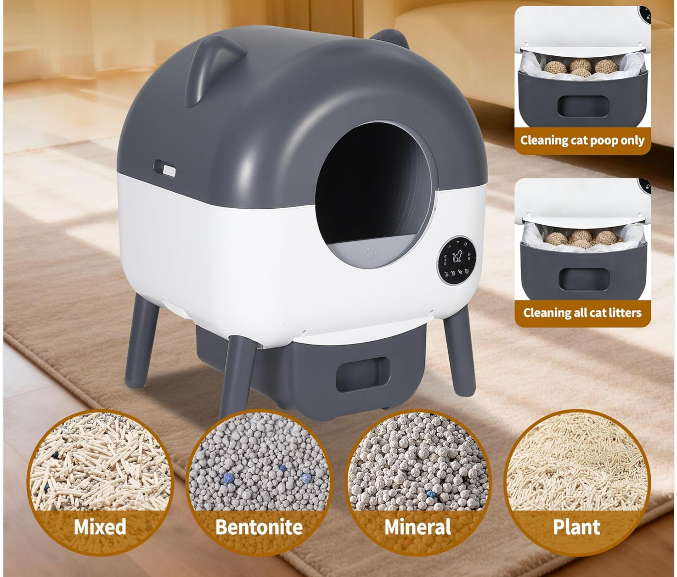
Image: Illustration of different cat litter types (Mixed, Bentonite, Mineral, Plant) that are compatible with the self-cleaning litter box, demonstrating its versatility.