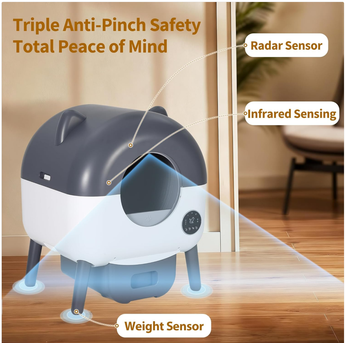
Image: Diagram illustrating the triple anti-pinch safety features: Radar Sensor, Infrared Sensing, and Weight Sensor, designed to ensure the safety of your pet during operation.

Your browser does not support the video tag.