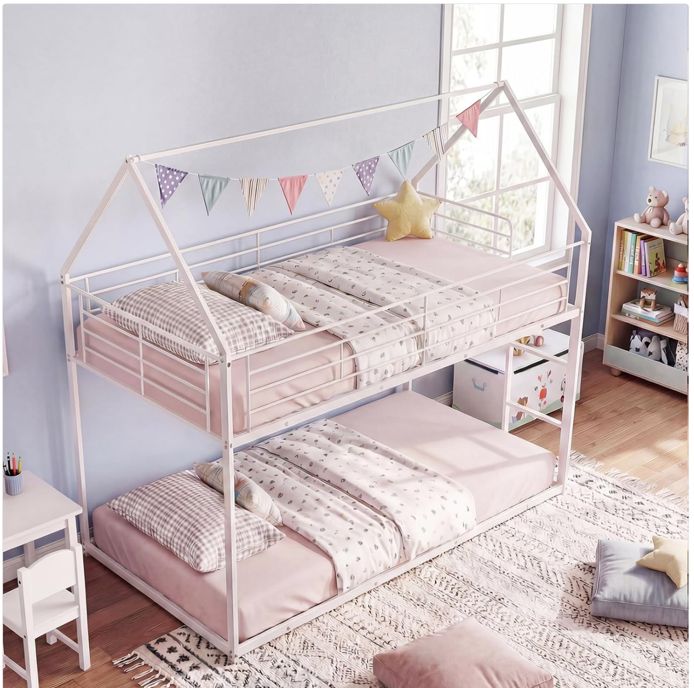
Figure 3: Overall dimensions of the bunk bed. Length: 78 inches, Width: 41.5 inches, Height: 71.5 inches. The upper bed clearance is 15 inches, and the lower bed height is 33 inches from the floor.