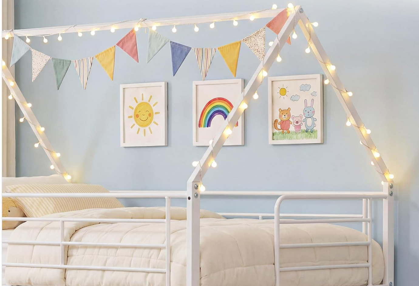
Figure 6: The house-shaped roof allows for creative decoration, such as string lights and colorful flags, to personalize the bed.