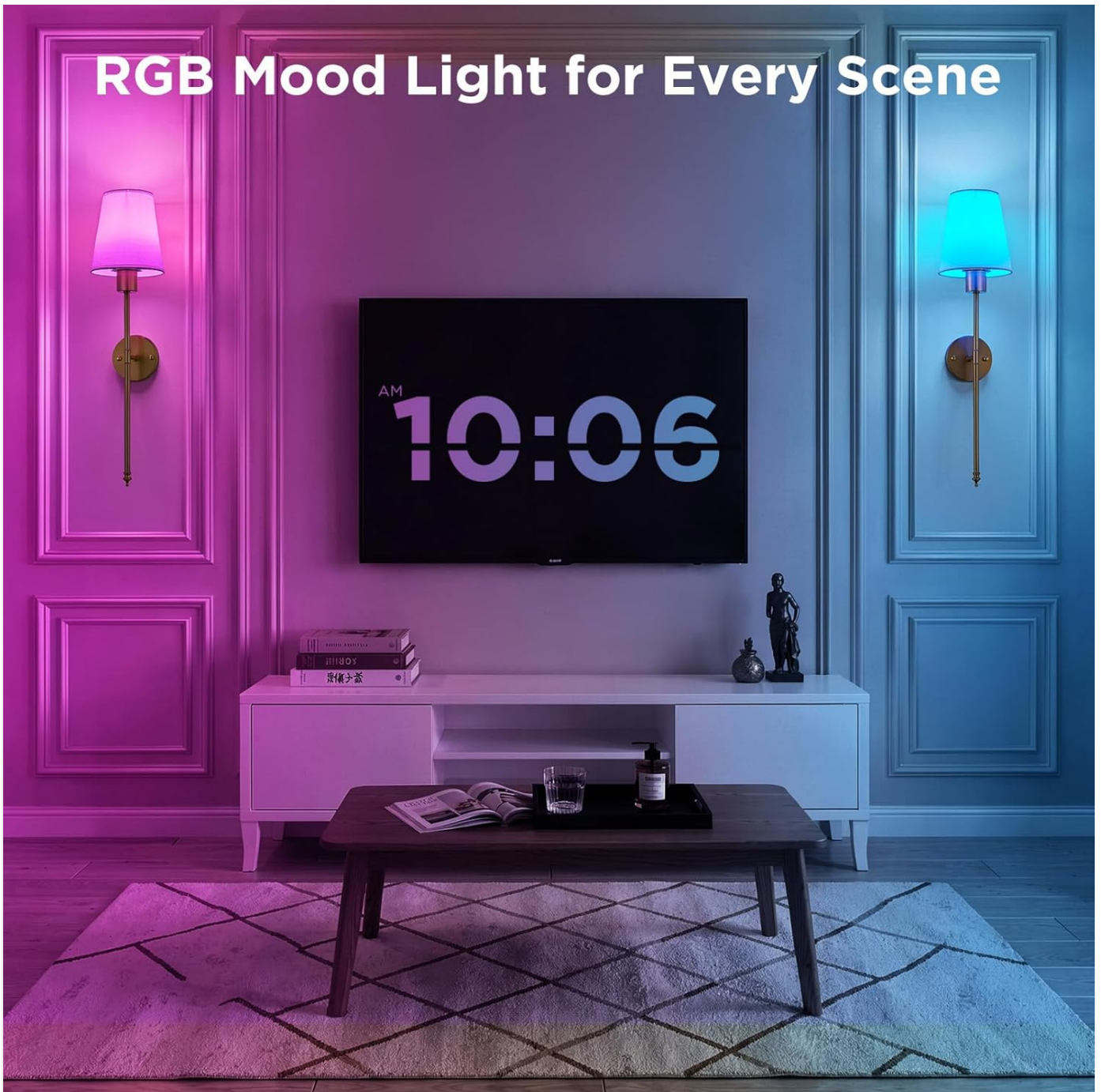
Image: Demonstrates the RGB mood lighting capability of the sconces, showing different colors illuminating a living room.