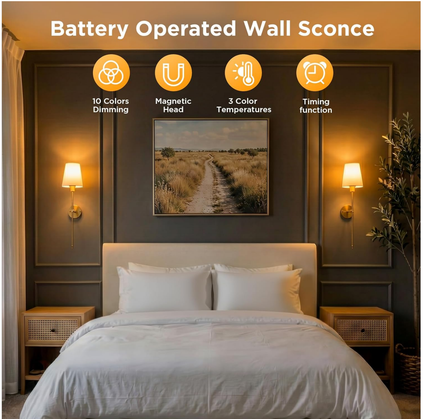
Image: Overview of the sconce features, including color options, magnetic attachment, color temperature, and timer, shown in a bedroom setting.