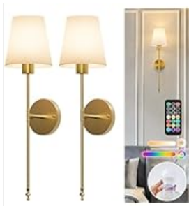
Image: Contents of the Brighttown Wall Sconces package, including two sconce units, a remote control, and charging cables.