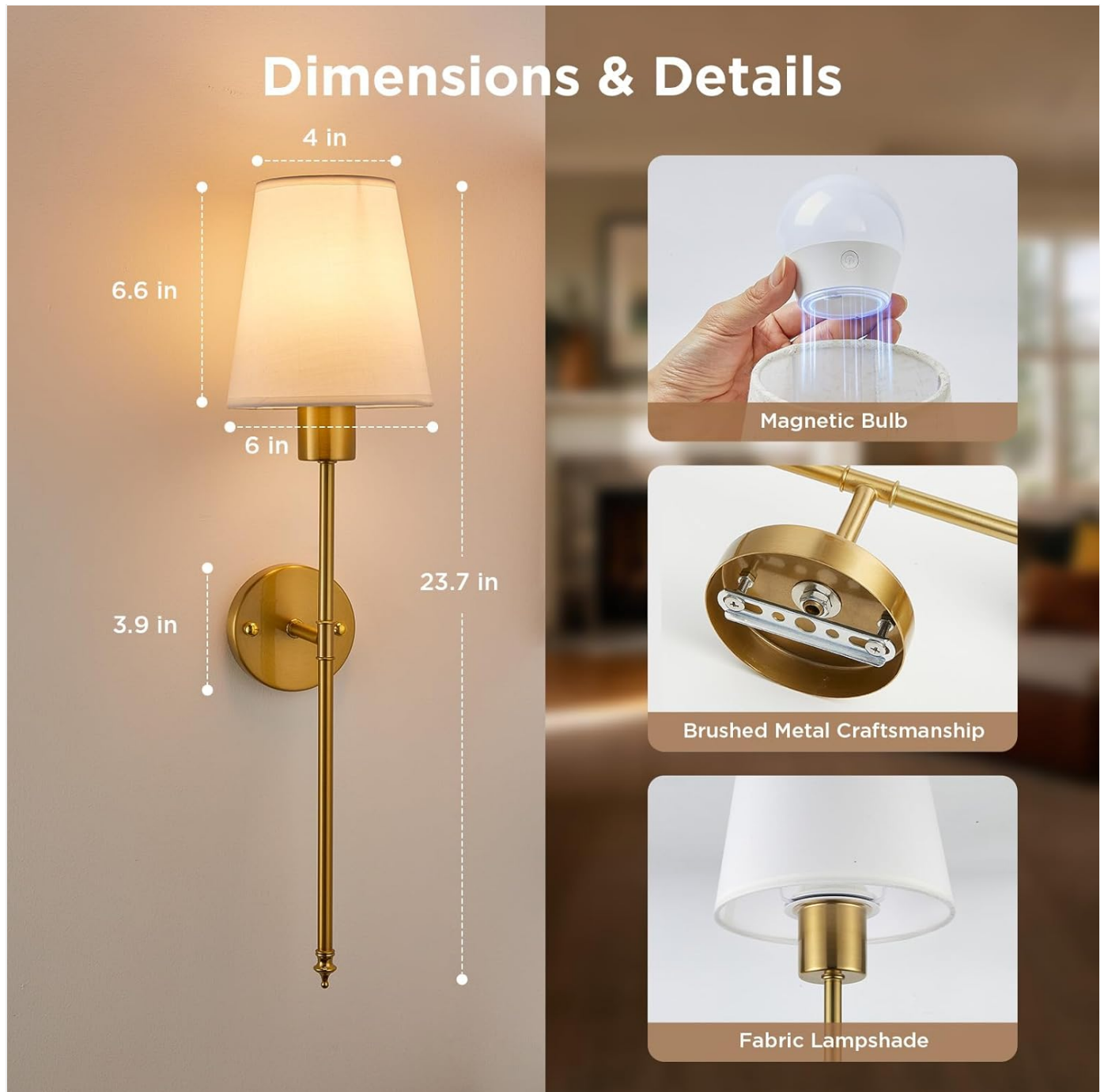
Image: Detailed view of the sconce dimensions and key components, including the magnetic bulb, brushed metal finish, and fabric lampshade.

Video: This video demonstrates the installation process for the Brightown Battery Operated Wall Sconce, showing how to assemble the components and mount the sconce to a wall.