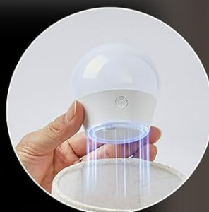
Image: Illustration of the E26 detachable magnetic base, highlighting the ease of removing the bulb for charging without unscrewing.