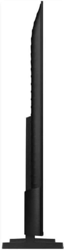
Image: Side profile of the Samsung 65-inch QLED TV, demonstrating its sleek and thin form factor.