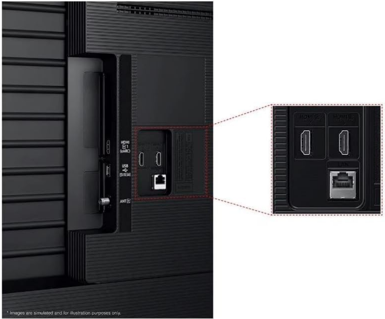
Image: A detailed view of the TV's back panel, highlighting the various input and output ports including HDMI, USB, and LAN connections.