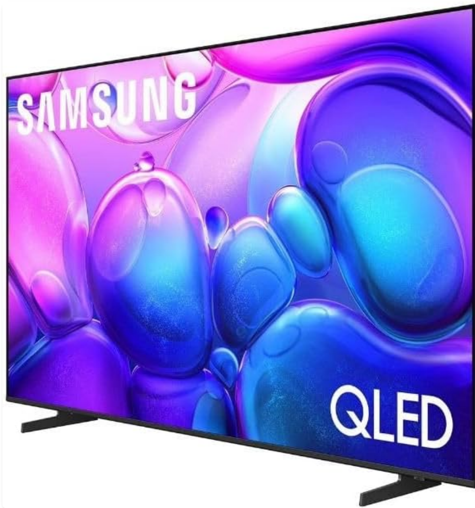
Image: Front view of the Samsung 65-inch QLED TV on its stands, showcasing its slim bezels and a colorful display.