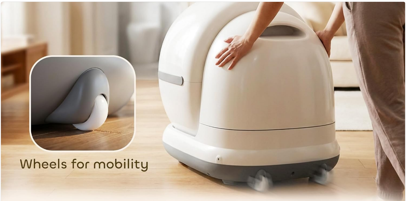
Wheels for mobility