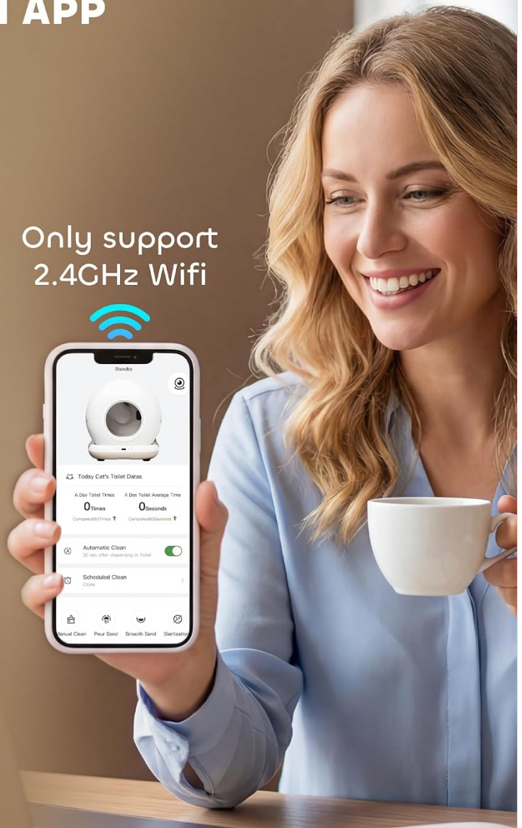
Image: The PawHut app interface on a smartphone, demonstrating remote control capabilities.

Your browser does not support the video tag.