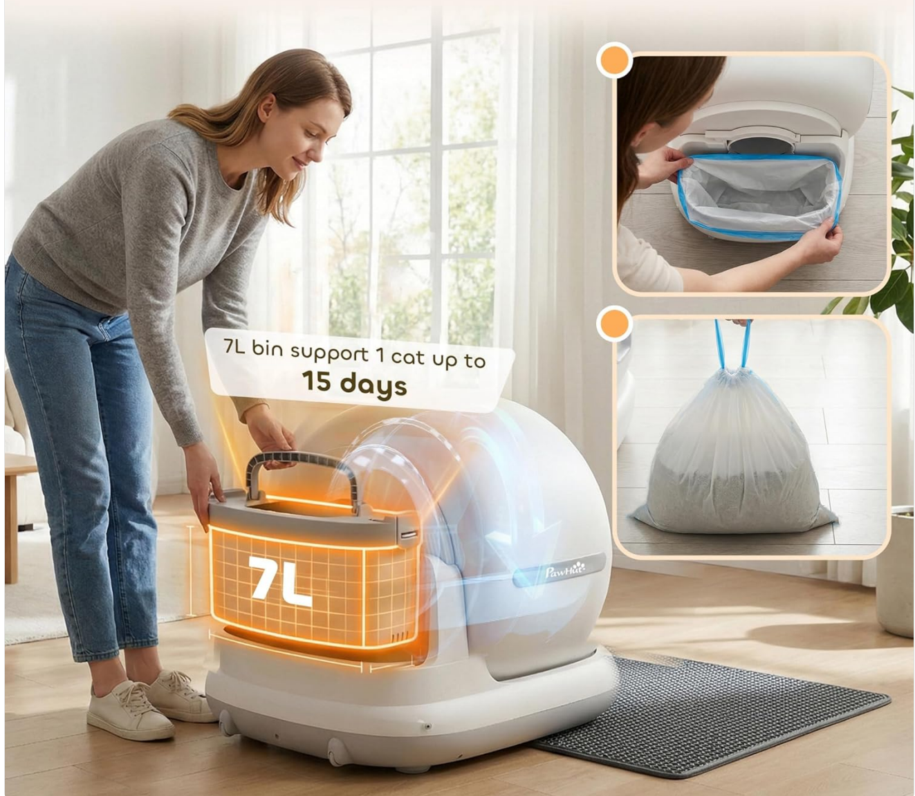
Image: Steps for automatic hands-free scooping and waste bin management.