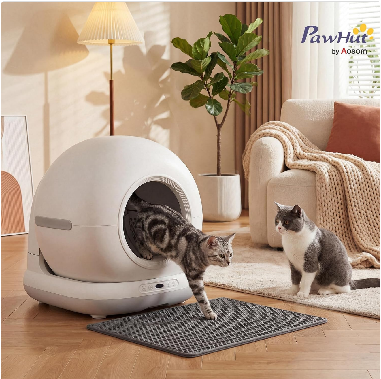
Image: Two cats interacting with the PawHut automatic litter box.