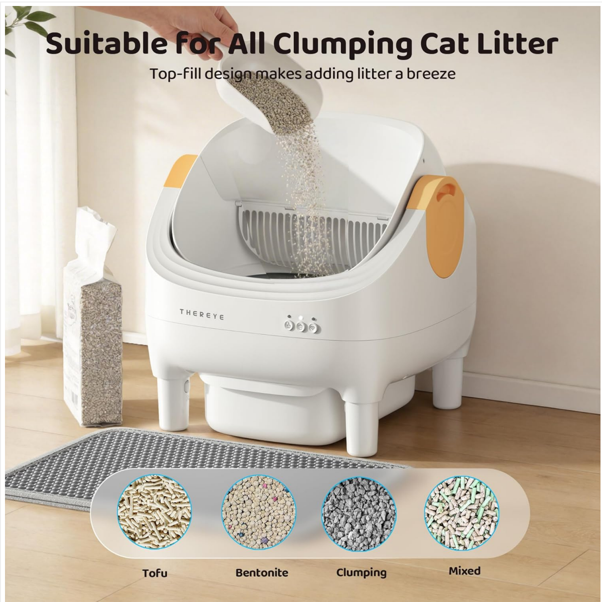
Image: Demonstrates adding clumping cat litter to the open-top compartment, showing compatibility with Tofu, Bentonite, Clumping, and Mixed litter types.