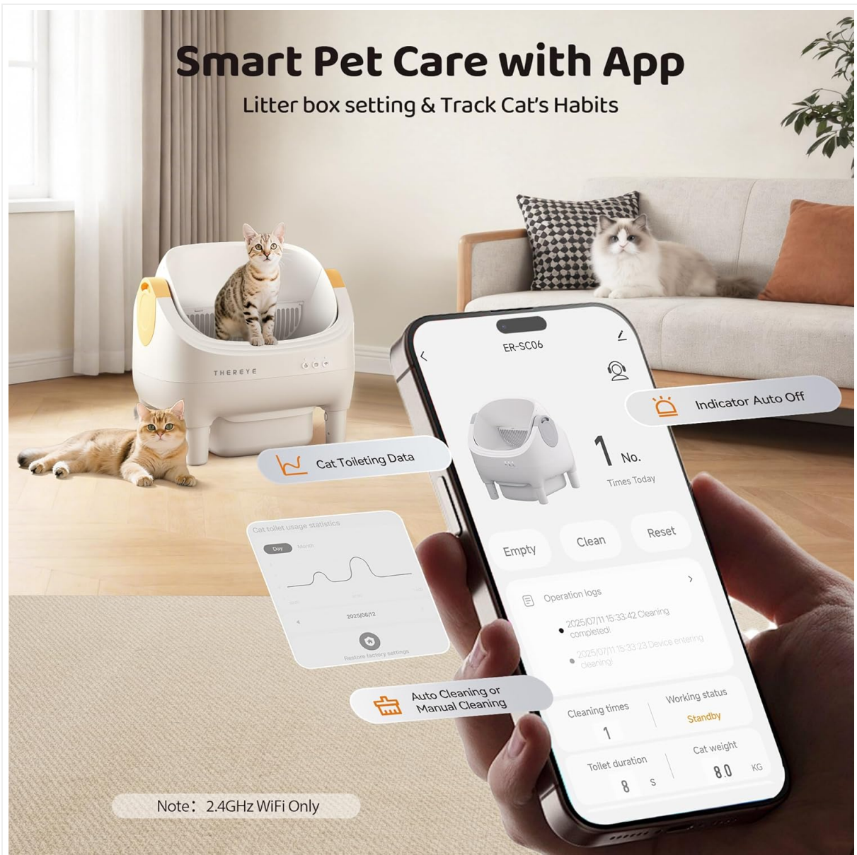
Image: A smartphone displaying the app interface for the Thereye litter box, showing options for manual/automatic cleaning, operation logs, cat weight tracking, and cleaning delay settings.