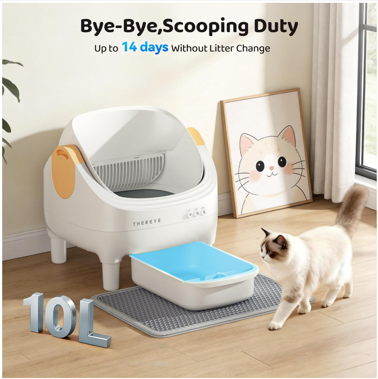
Image: The 10L waste bin being removed from the litter box, demonstrating the ease of waste disposal and the capacity for extended use without frequent emptying.