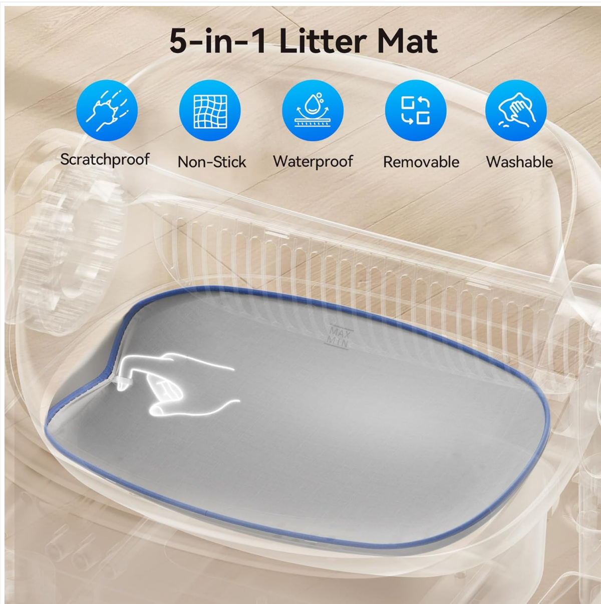
Image: Close-up of the 5-in-1 litter mat, highlighting its scratchproof, non-stick, waterproof, removable, and washable properties.