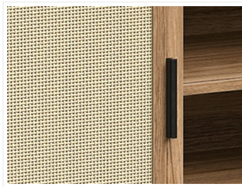
Image: Close-up of the natural rattan weave door panel, showcasing its texture and design.