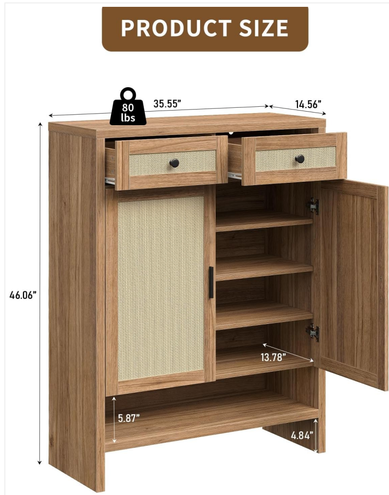
Image: Diagram showing the overall dimensions of the Yanosaku Rattan Shoe Cabinet, including height (46.06"), width (35.55"), and depth (14.56"). Internal shelf and drawer dimensions are also indicated.