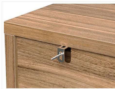
Image: Close-up of the anti-tip safety kit hardware, showing a metal bracket and screw for wall attachment.