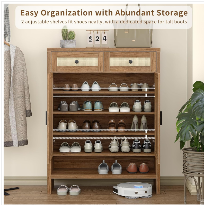
Image: The shoe cabinet with its doors open, revealing multiple adjustable shelves filled with various types of shoes. The image highlights the flexibility of the shelving system.