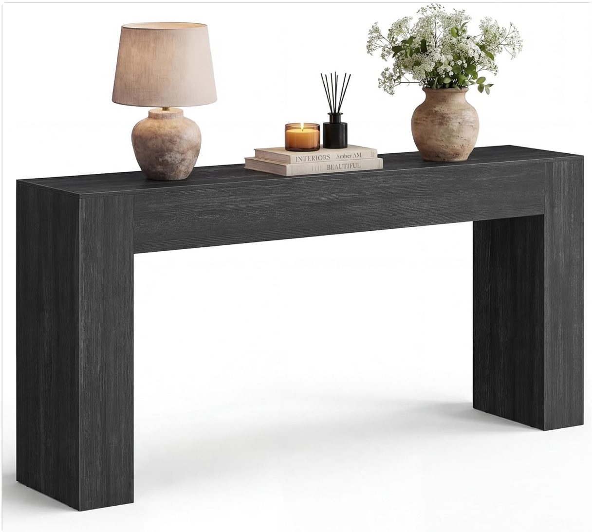
Image 1.1: The VASAGLE ULNT147BA01S Entryway Console Table, showcasing its U-shaped design and charcoal gray finish.