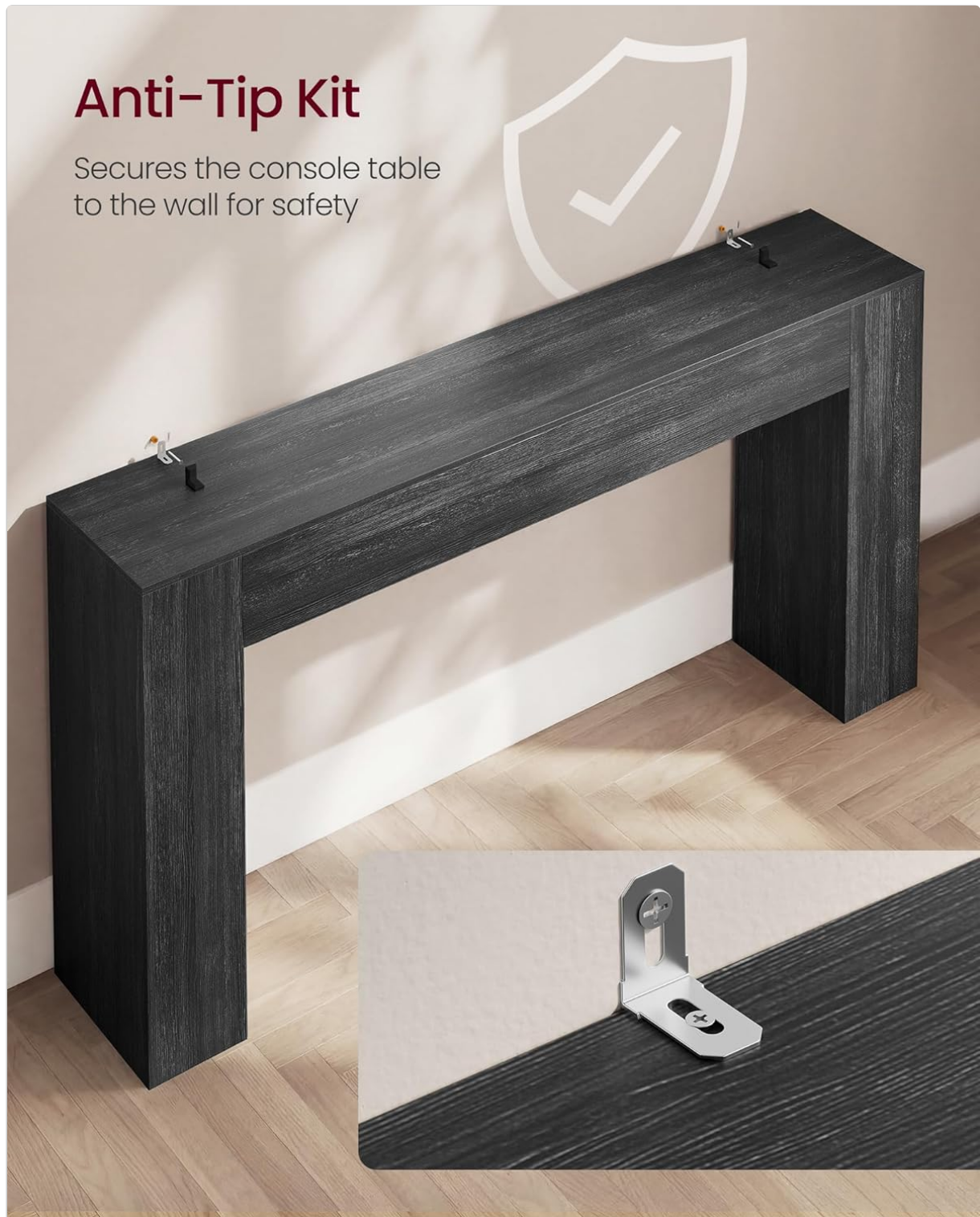
Image 2.1: Illustration of the anti-tip kit, which secures the console table to the wall for enhanced safety.