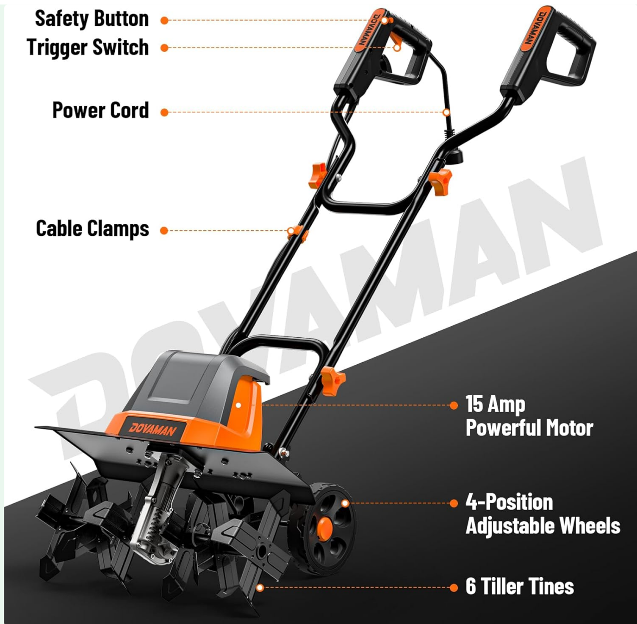
Figure 1: Labeled components of the DOVAMAN T03 Electric Garden Tiller, including the safety button, trigger switch, power cord, cable clamps, 15 Amp motor, 4-position adjustable wheels, and 6 tiller tines.