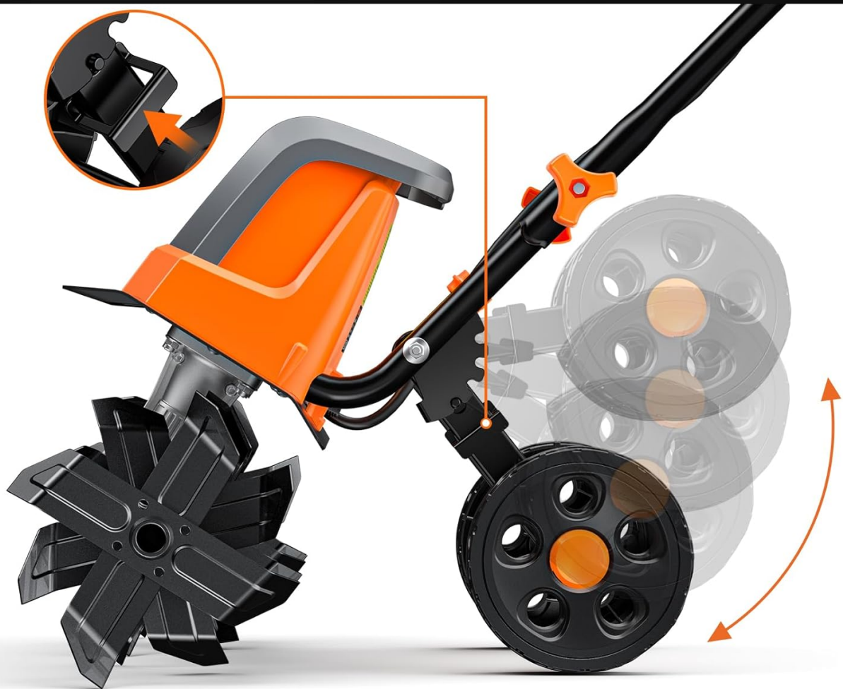
Figure 2: Illustration of the 4-position adjustable wheels on the DOVAMAN T03 Electric Garden Tiller, allowing users to customize tilling depth.