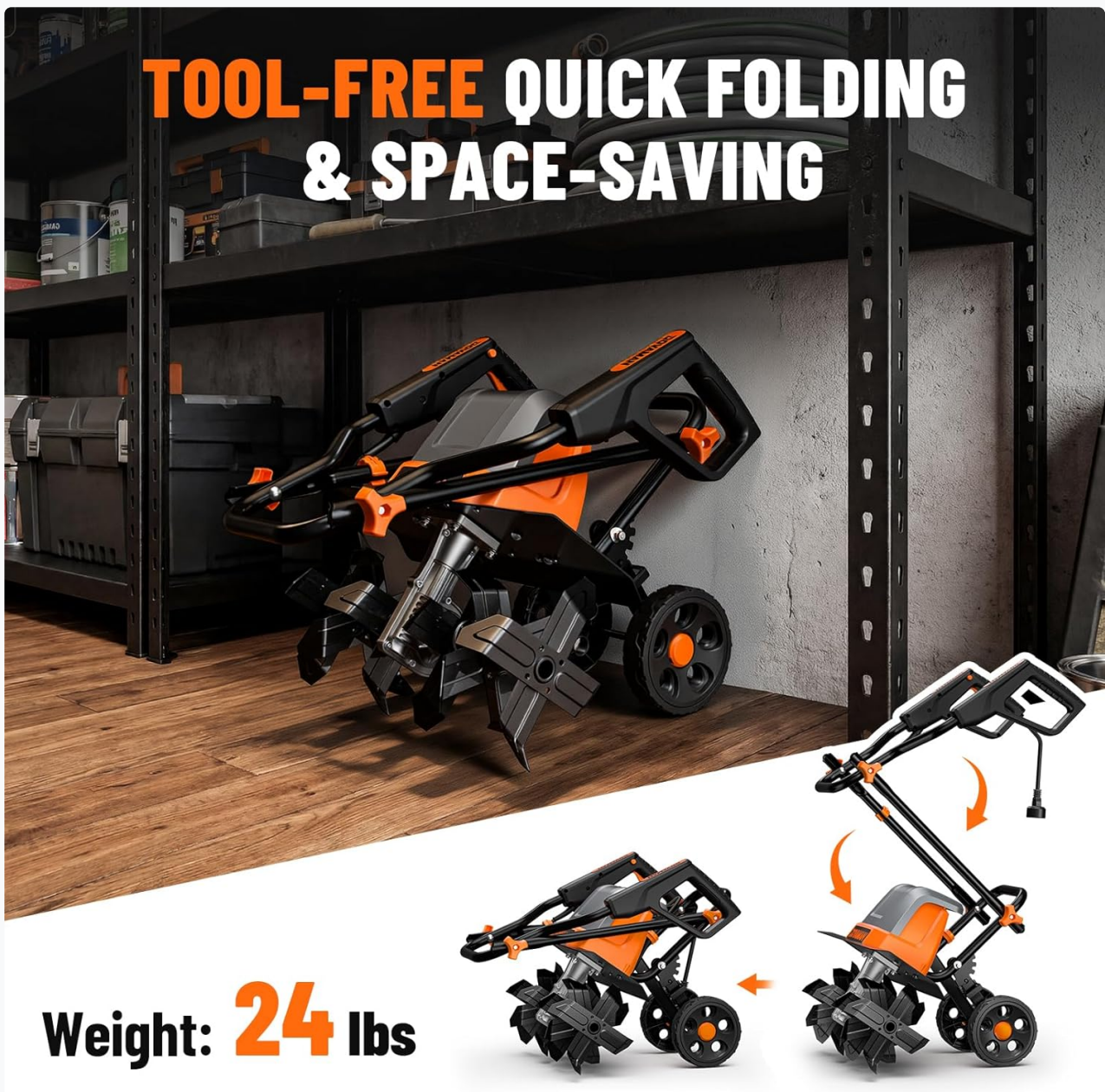
Figure 4: The DOVAMAN T03 Electric Garden Tiller shown with its handle folded, demonstrating its compact design for easy storage.