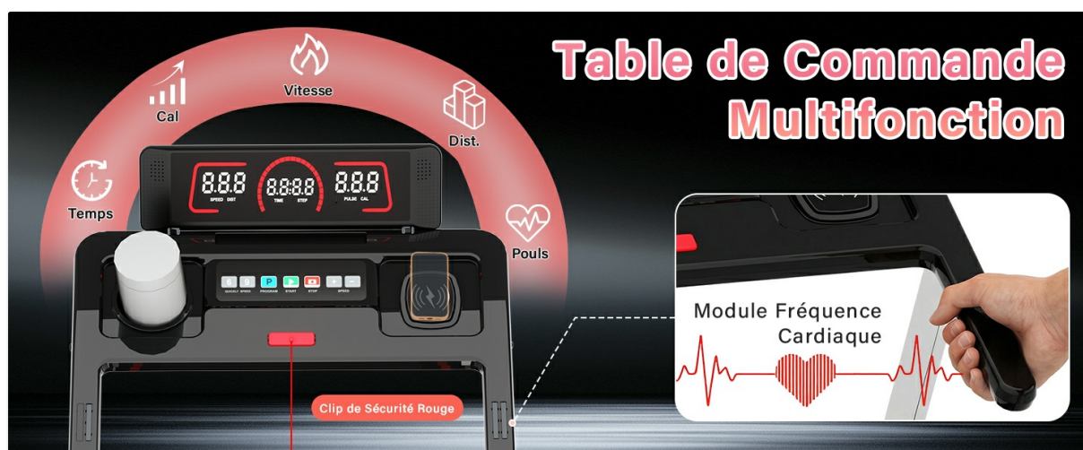
Image: Detailed view of the treadmill's multifunction control panel, showing various functions and display areas.