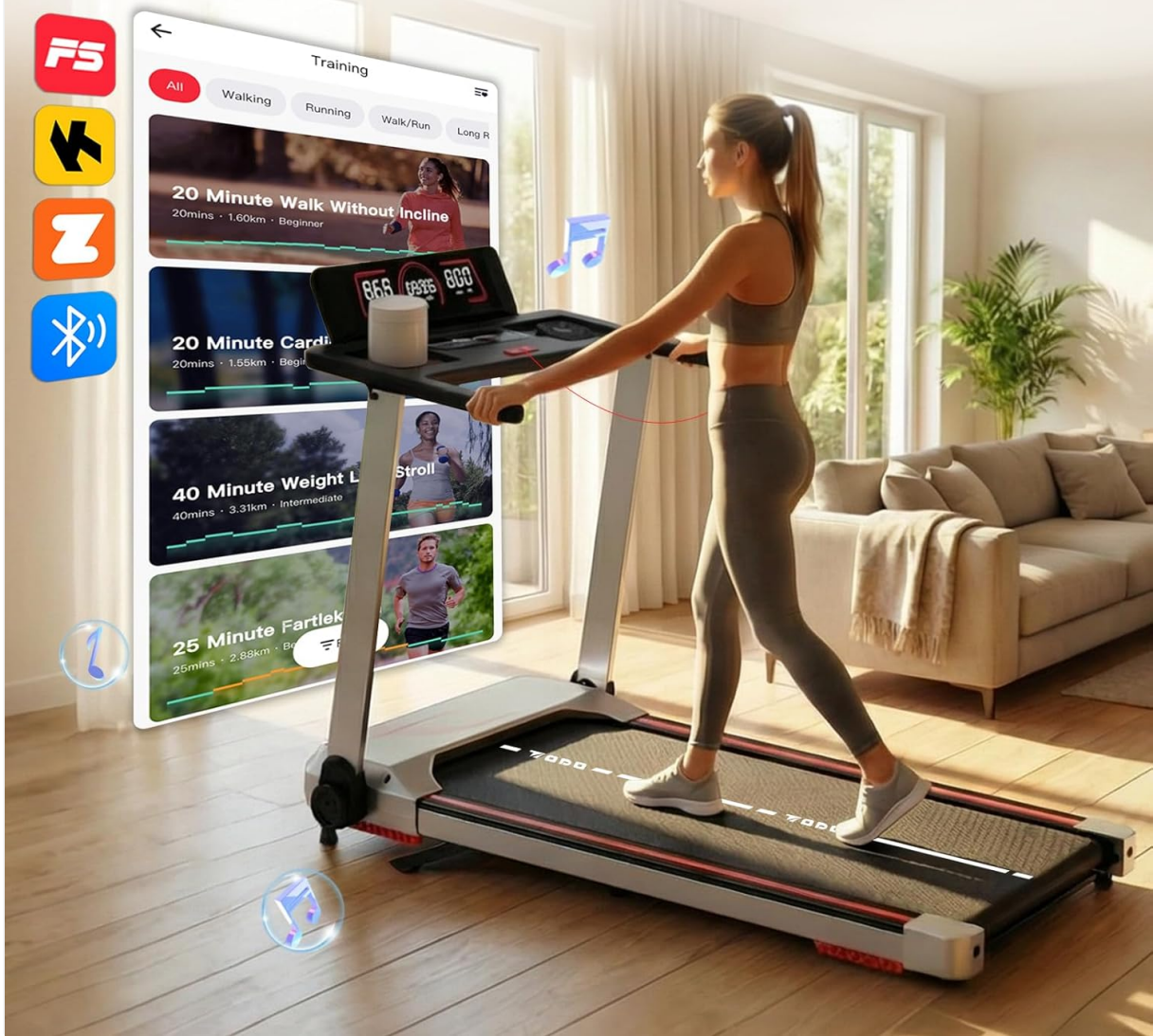
Image: Detail of the integrated Bluetooth speaker on the treadmill console.