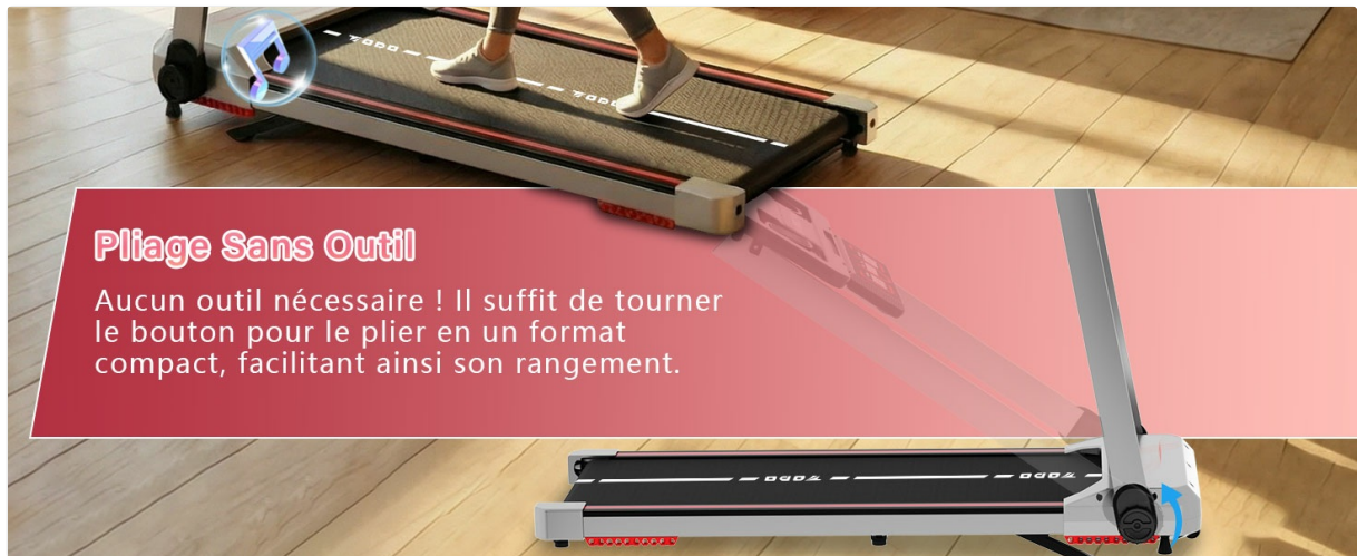
Image: Hands demonstrating the tool-free folding process of the treadmill.

The treadmill is designed for tool-free quick folding. To unfold, simply turn the knob to lower the armrest and position the running deck. Ensure all locking mechanisms are securely engaged before use.