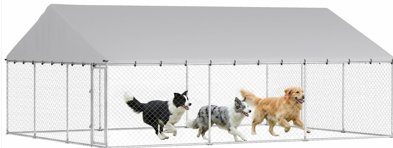
Image: The PawHut Outdoor Dog Kennel, fully assembled, providing a large outdoor space for pets.