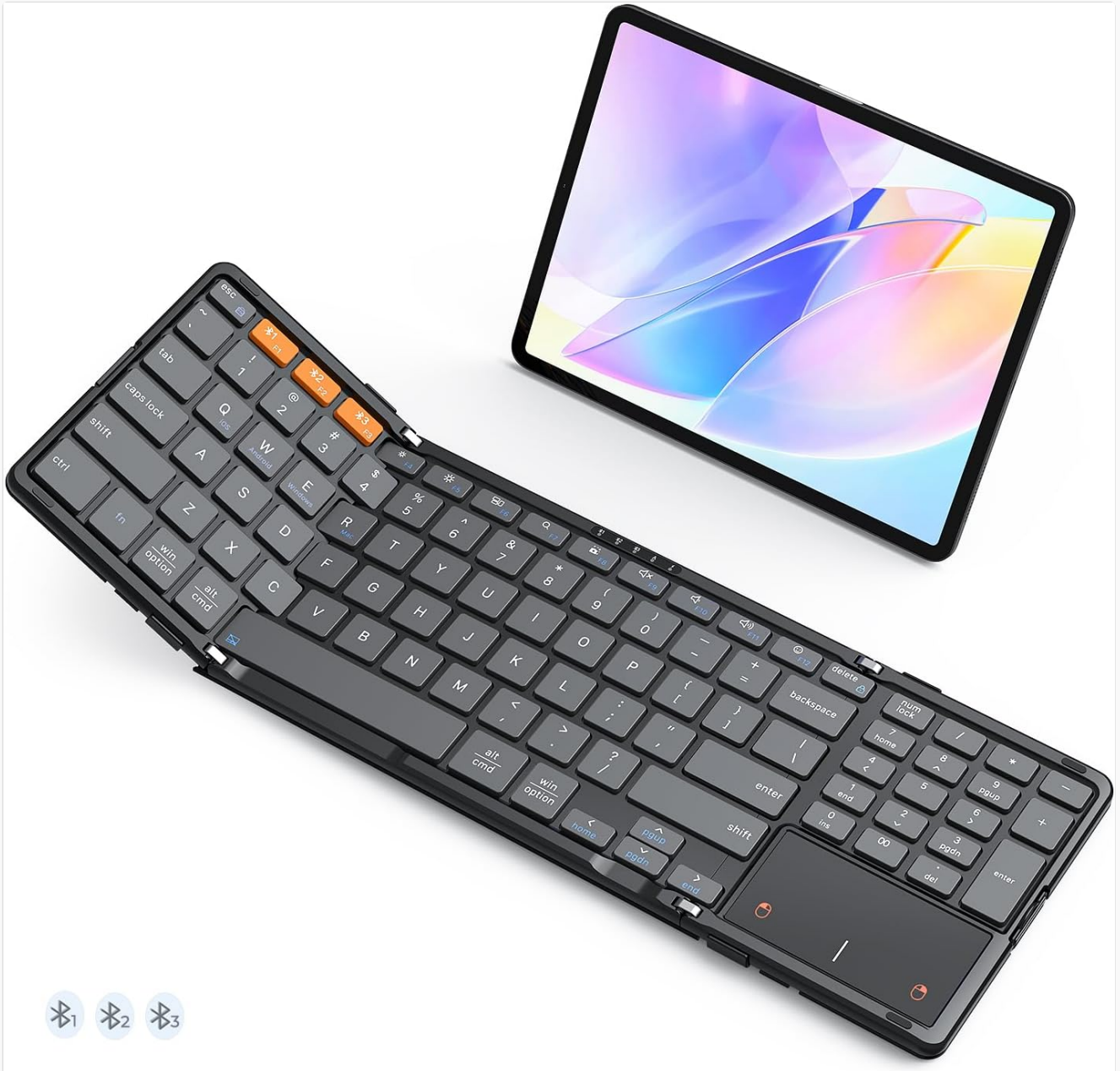
Figure 2.1: The MEETION K9552 Foldable Keyboard in its fully unfolded state, highlighting the complete QWERTY key layout, integrated numeric keypad, and multi-touch touchpad.