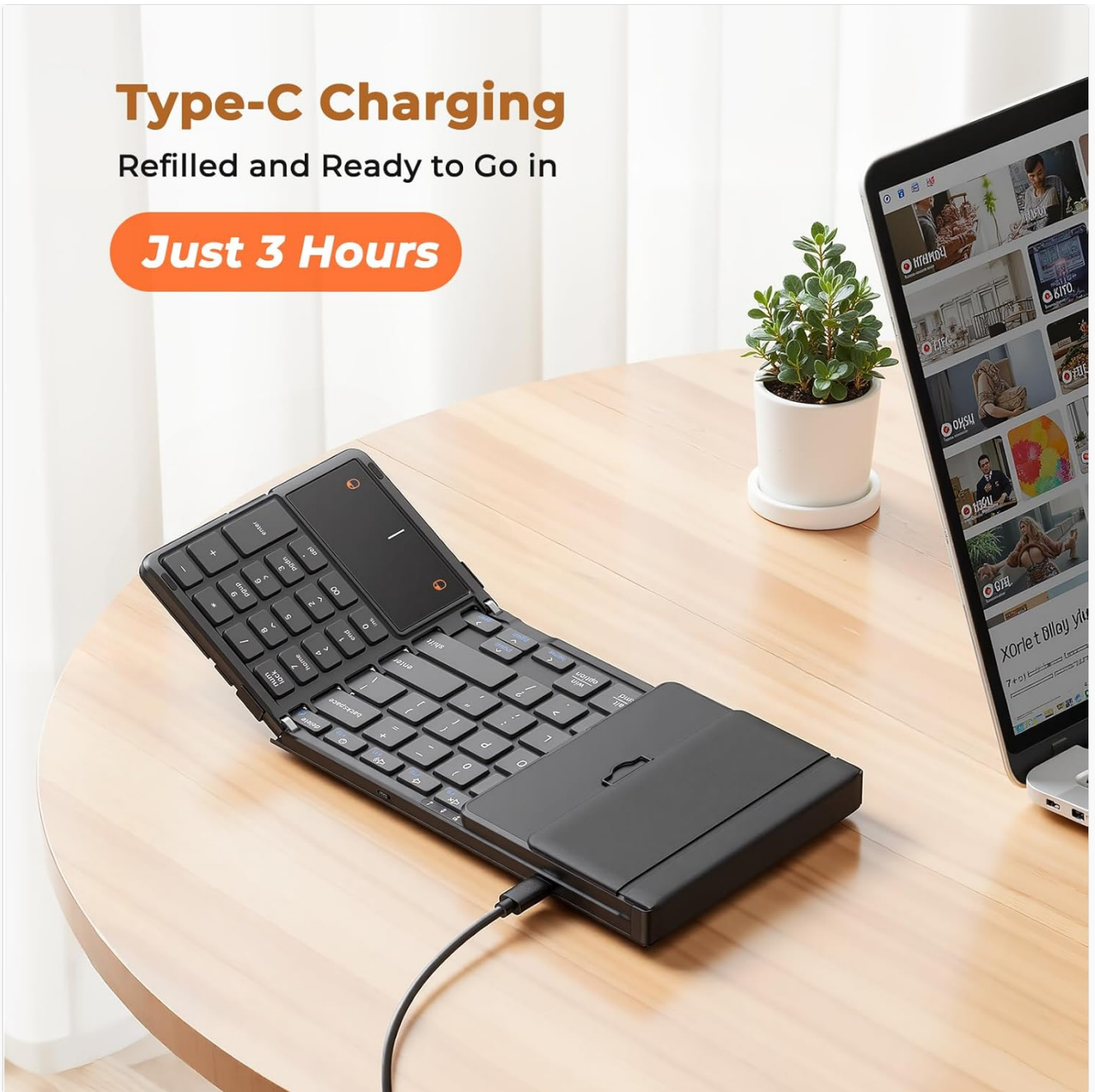
Figure 3.1: The keyboard connected to a power source via its USB-C charging cable, indicating the charging process.