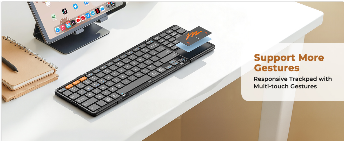
Figure 4.2: A visual guide to the keyboard's full row of shortcut keys and common multi-touch gestures for the touchpad.