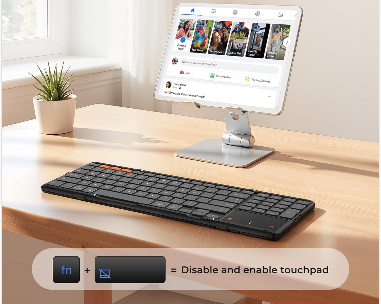
Figure 2.2: The keyboard connected to multiple devices, including a tablet and a smartphone, illustrating its triple device connection capability.