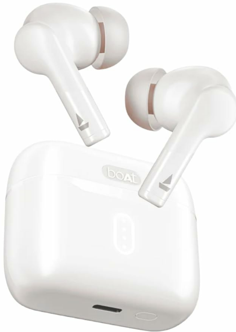
Image: The boAt Airdopes 148 Gen 2 charging case with earbuds inserted, illustrating the charging process.