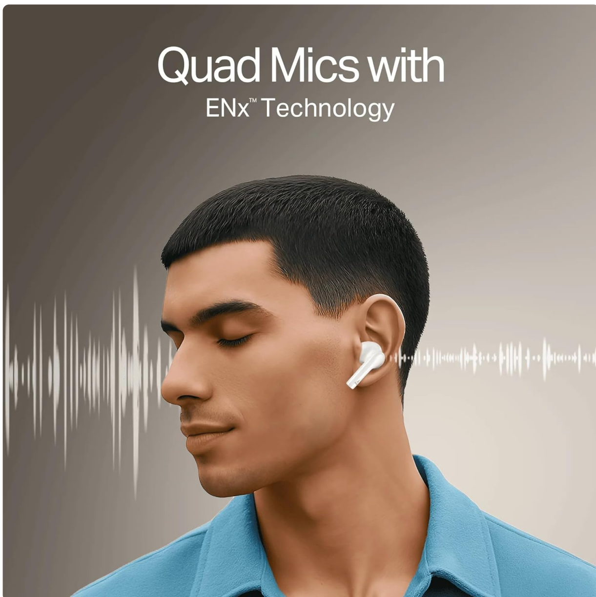
Image: A user wearing an earbud, highlighting the Quad Mics with ENx Technology for enhanced call clarity.

The earbuds feature Quad Mics with ENx Technology for clear voice calls by cancelling environmental noise.