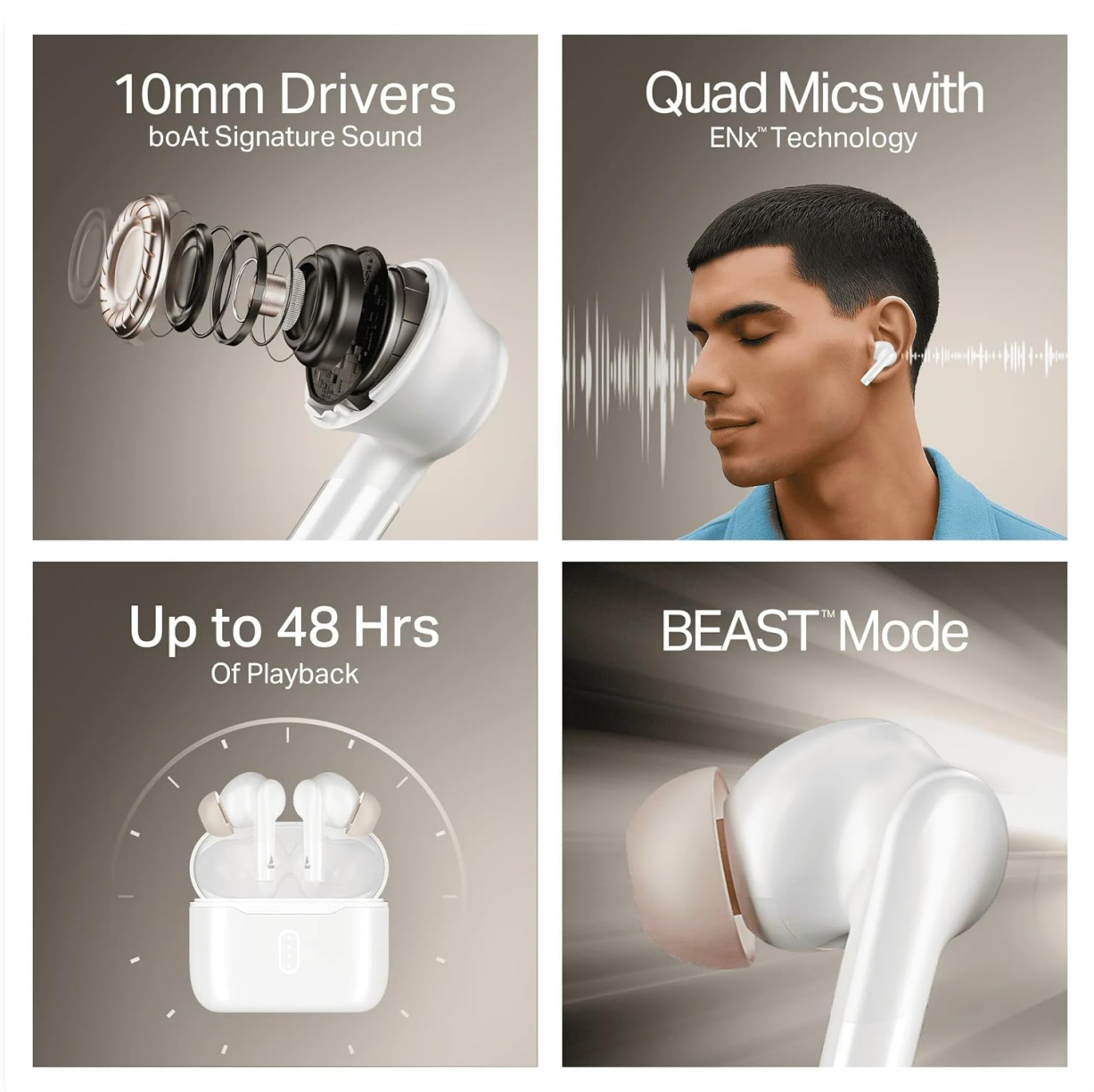
Image: A summary of key specifications and features of the Airdopes 148 Gen 2.