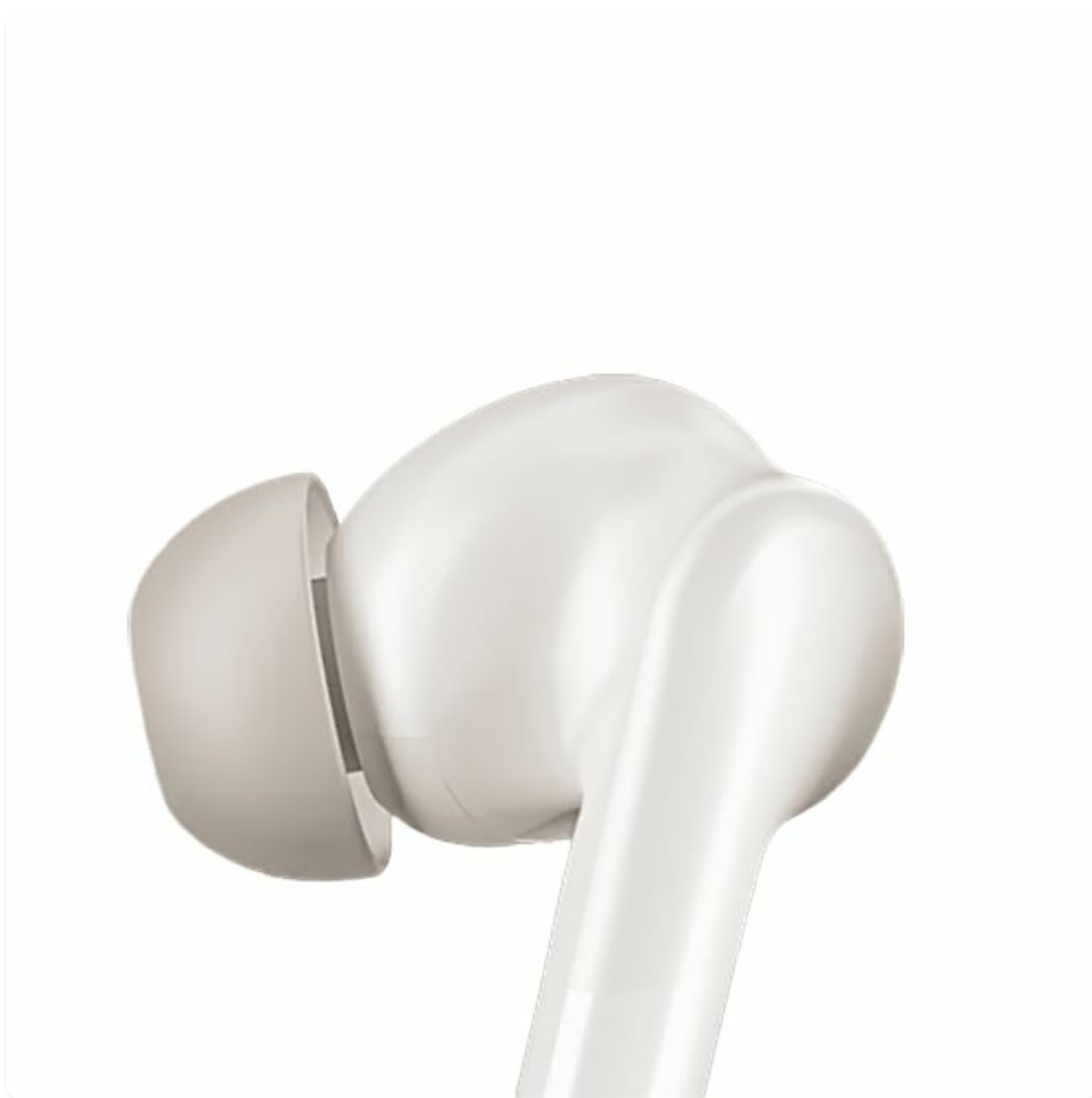
Image: boAt Airdopes 148 Gen 2 earbuds shown with their charging case.