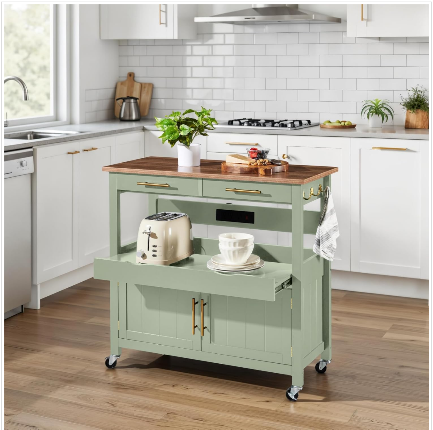
Image: The kitchen island cart in a kitchen environment, showing its functionality with the pull-out shelf extended and a toaster in use.