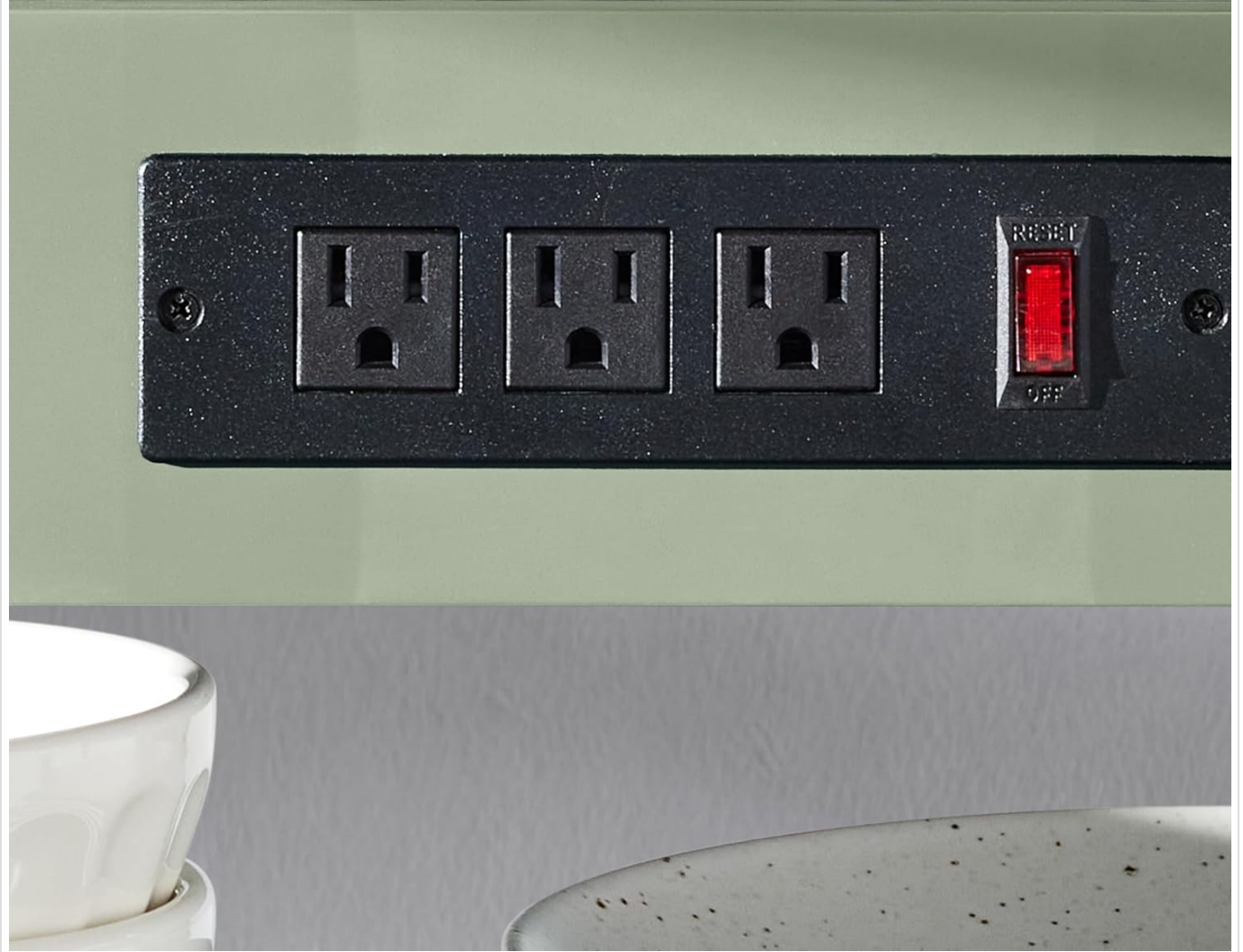
Image: A close-up view of the three built-in 3-prong power outlets with a reset switch, integrated into the cart's design.