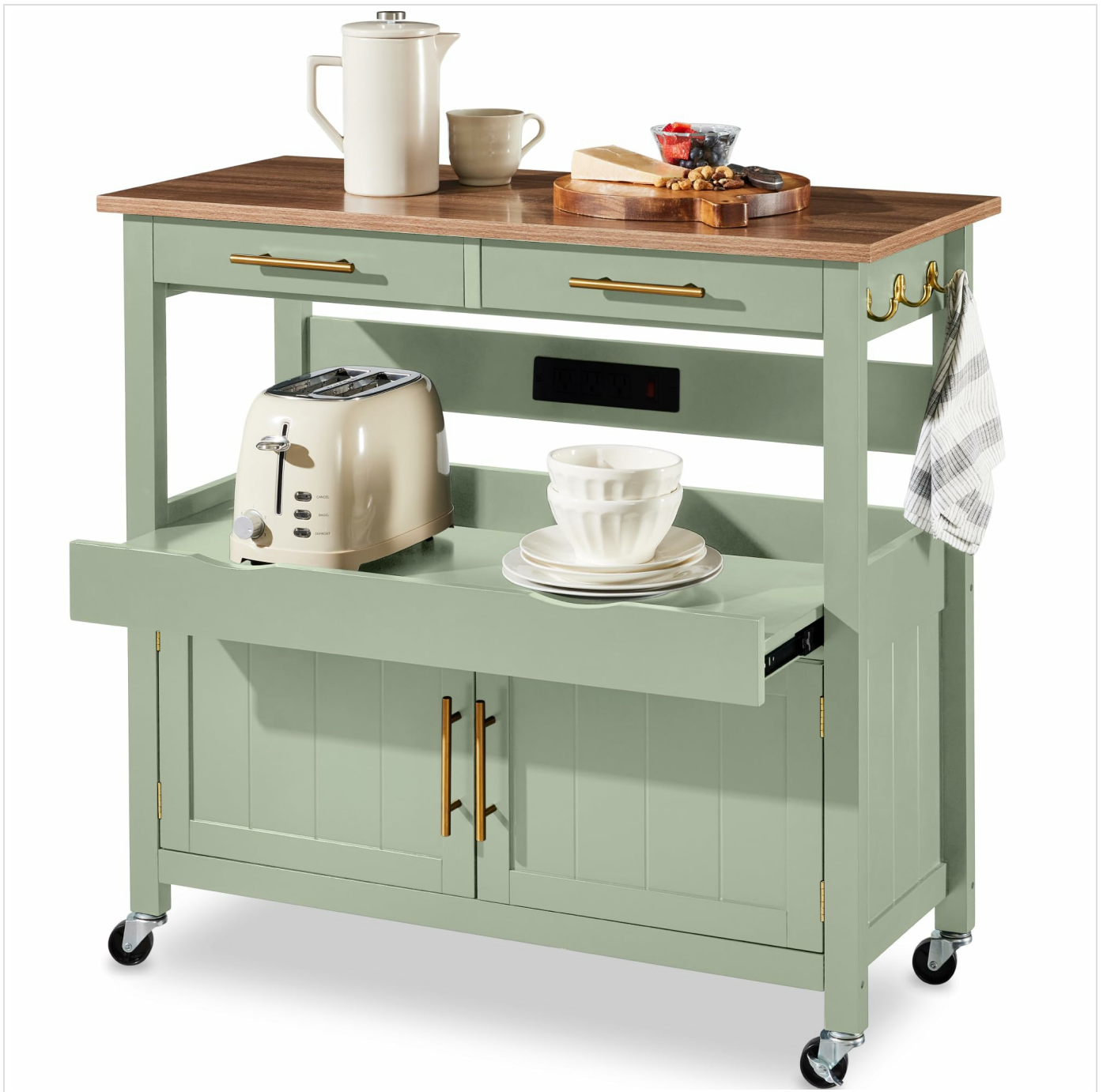
Image: The Best Choice Products 36in Large Rolling Kitchen Island Cart in Pistachio Green, showcasing its overall design and features.