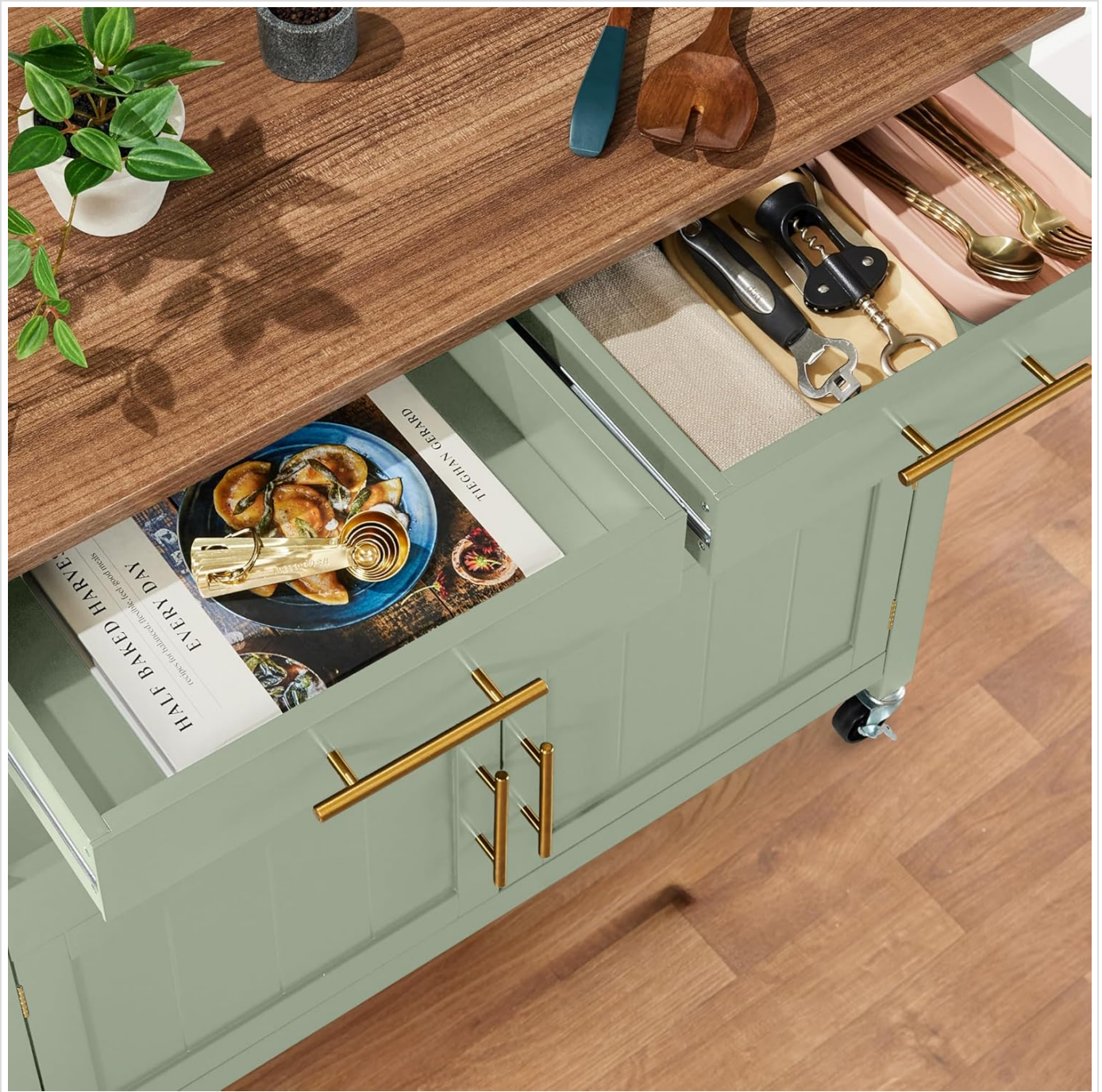
Image: An open drawer filled with kitchen utensils and the cabinet below, demonstrating the storage capacity.