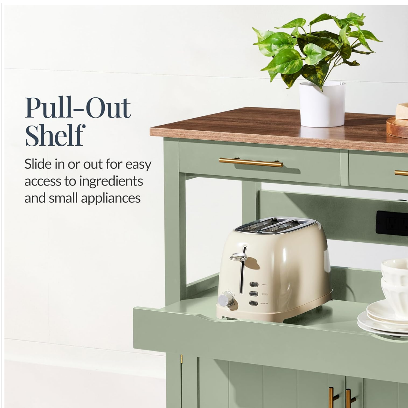
Image: The pull-out shelf extended, demonstrating its use for small appliances like a toaster.

Slide in or out for easy access to ingredients and small appliances