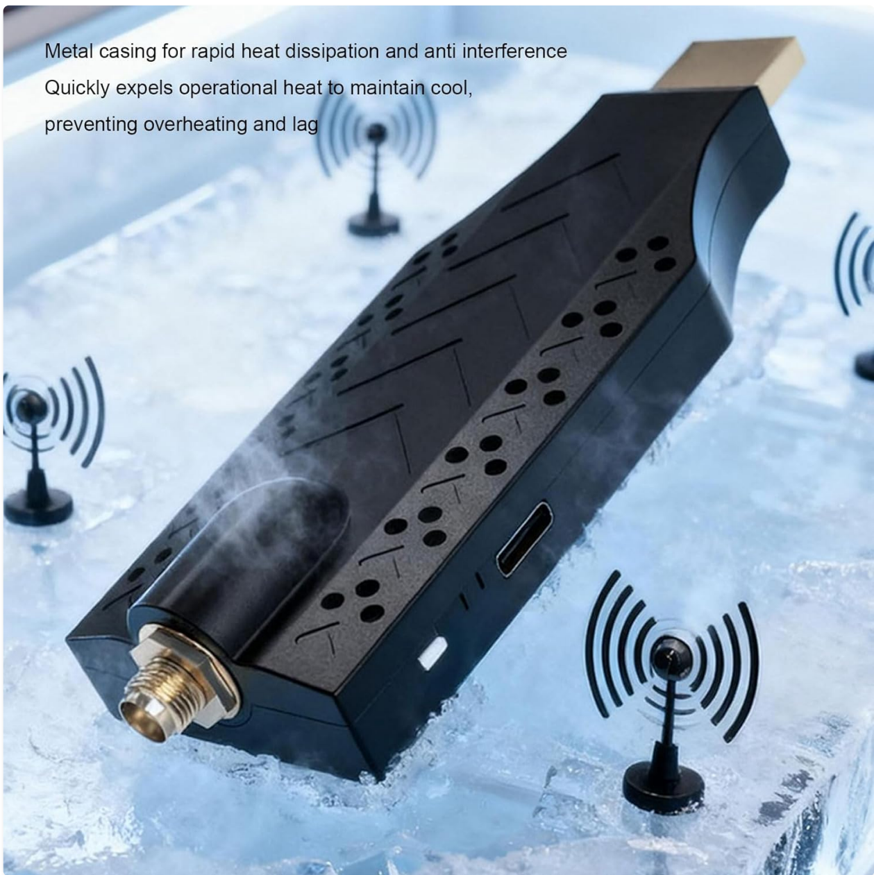
Figure 3.2: Metal casing for efficient heat dissipation.