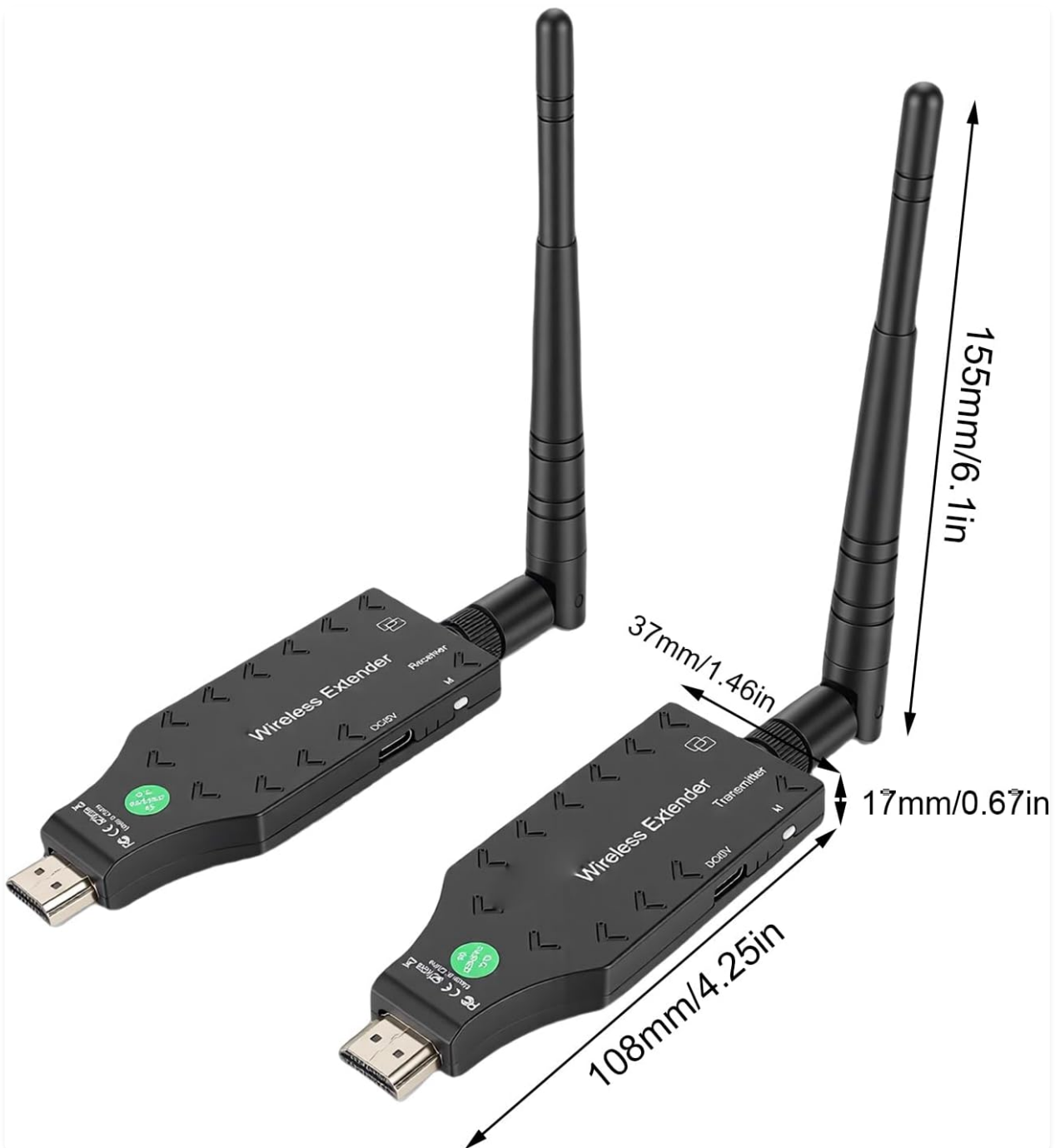
Figure 8.1: Product dimensions.