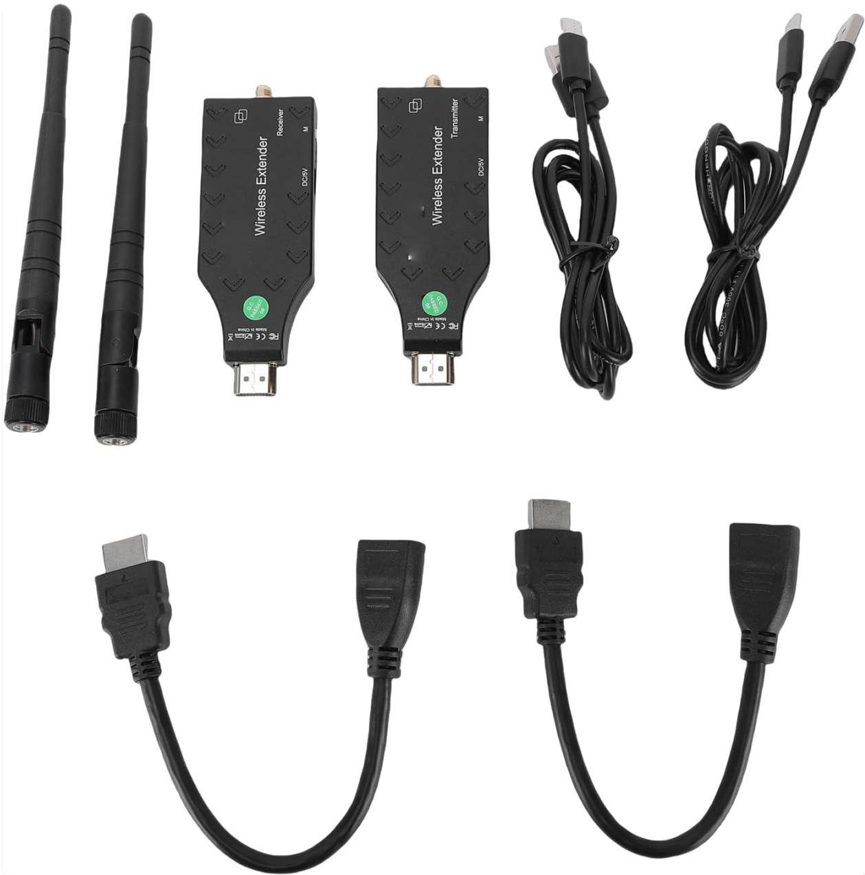
Figure 2.1: All components included in the package.