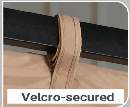
Figure 4.2.1: Close-up of canopy features including drainage holes and guiding straps.