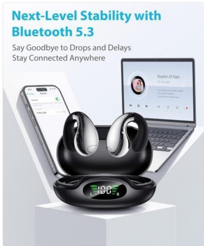
Image: The Boytond S30i earbuds and their charging case positioned between a smartphone and a laptop, symbolizing their ability to connect seamlessly across multiple devices via Bluetooth 5.3.