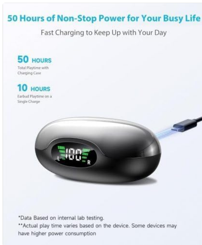
Image: The charging case of the Boytond S30i earbuds, with a USB-C cable inserted into the charging port, and the digital display indicating the current battery level.