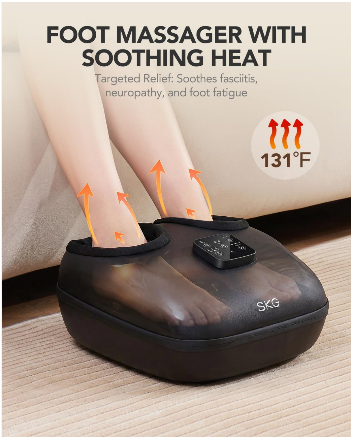
Image: The compact remote control for the SKG YS100 Foot Massager, featuring buttons for Power, Mode, Air Intensity, Heat, and Time.