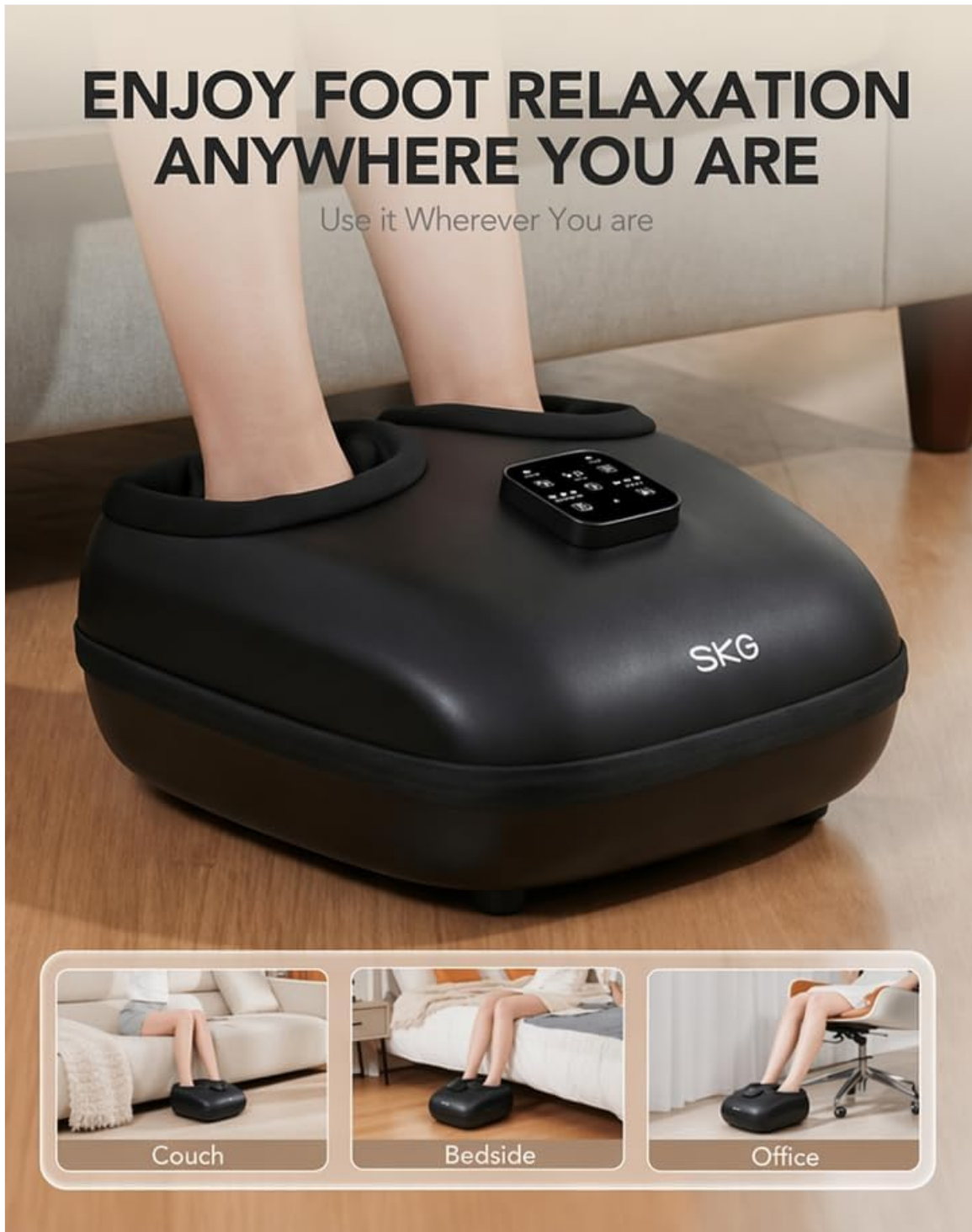
Image: The SKG YS100 Foot Massager is depicted as compact and lightweight, suitable for easy carrying and storage.