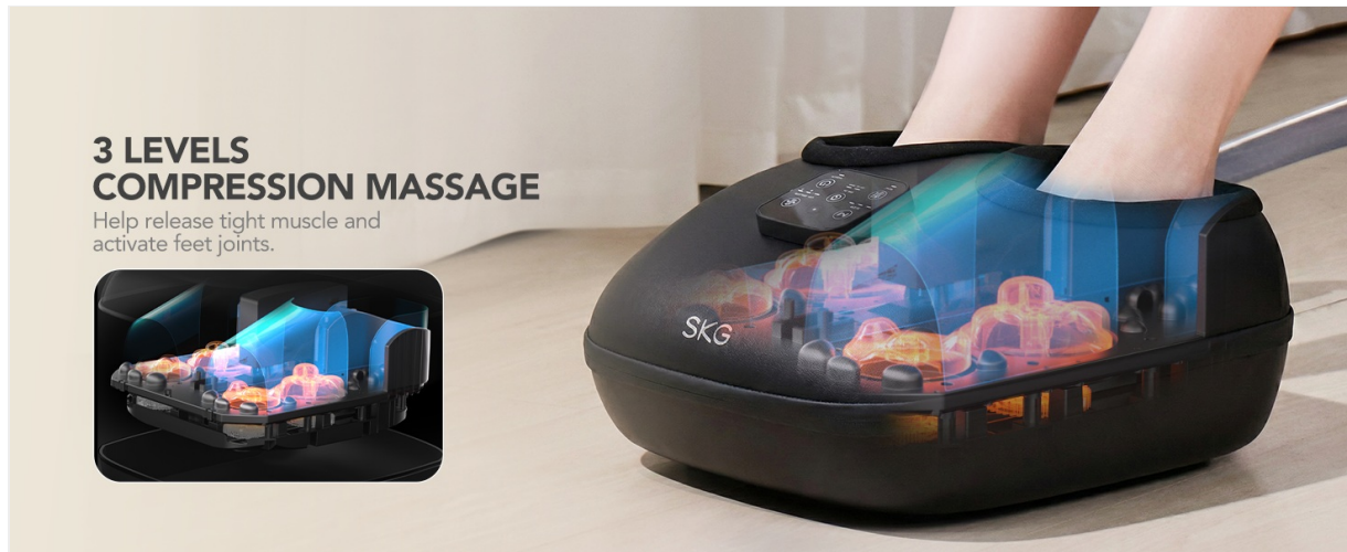
Image: An internal view diagram of the SKG YS100 Foot Massager highlighting the areas of the foot targeted by the massage mechanisms, including heels, instep, plantar, arch, and toe.