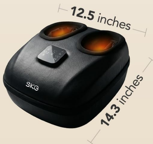
Image: A visual representation showing the SKG YS100 Foot Massager can comfortably accommodate feet up to size 13, with a comparison of foot sizes.