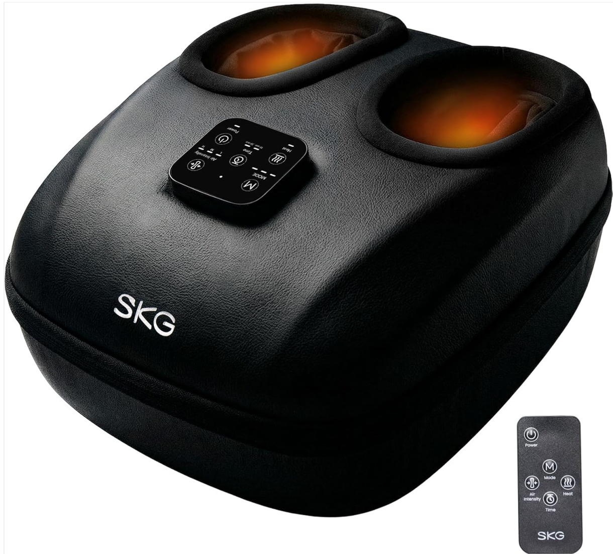
Image: The SKG YS100 Foot Massager in black, positioned on a floor, ready for a user to place their feet inside.