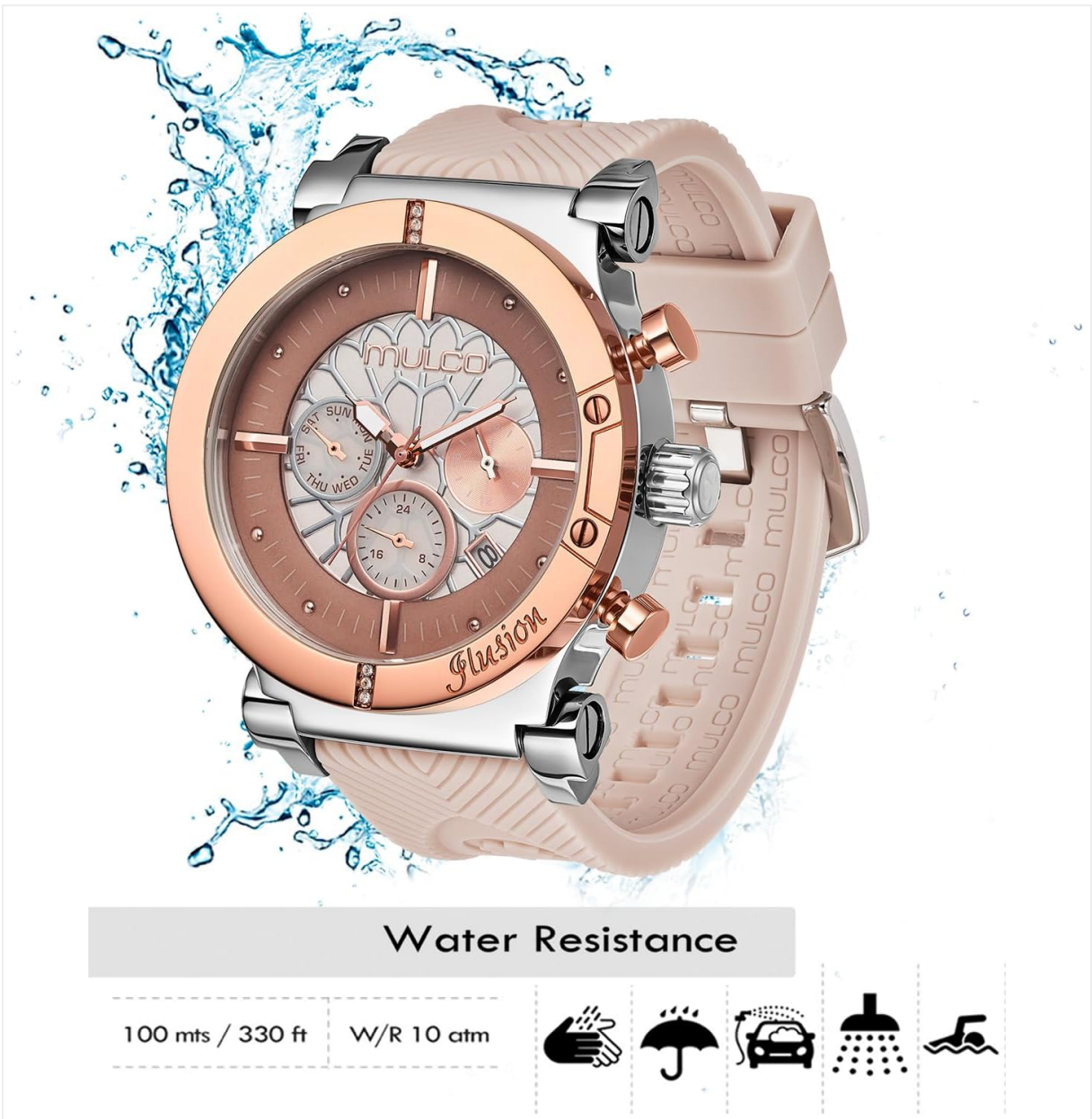
Image: Illustration of the watch's water resistance, indicating 100 meters / 330 feet (10 ATM) suitability for swimming and showering.