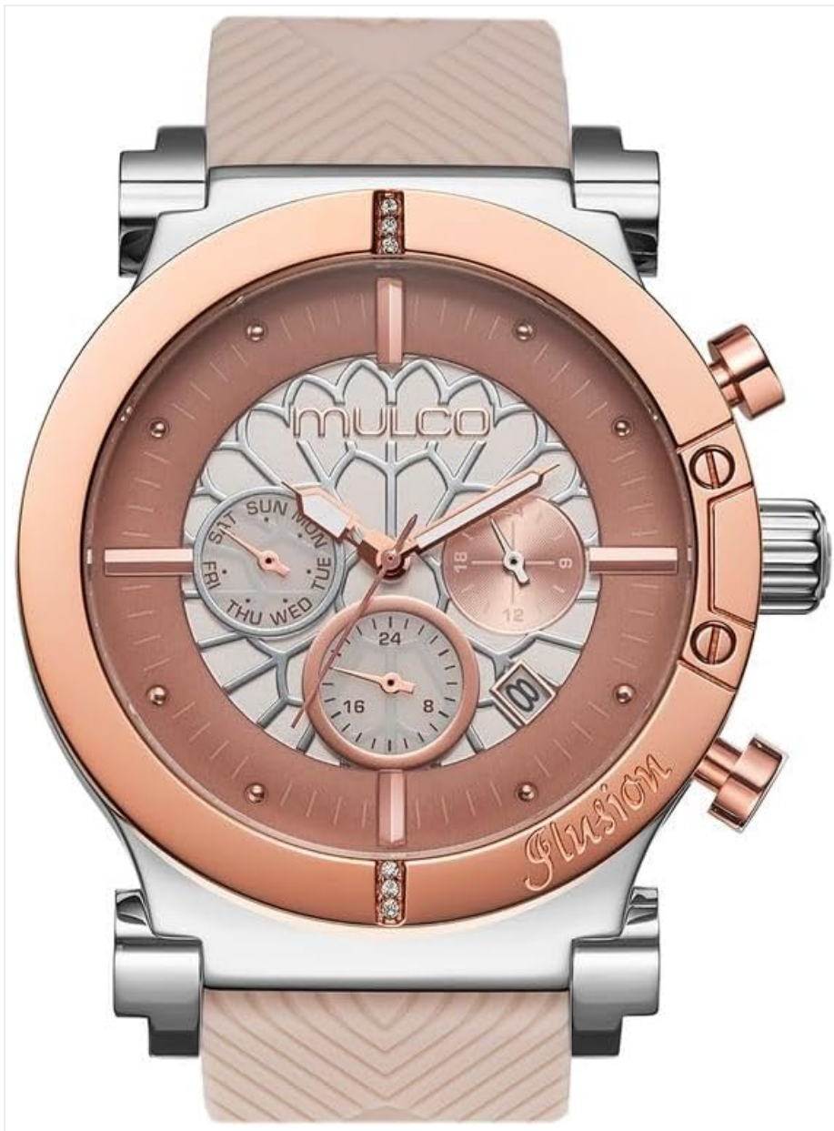
Image: Front view of the MULCO Dream Catcher Women's Watch in beige, showcasing the dial, hands, and silicone strap.

The MULCO Dream Catcher watch combines a stylish design with practical features. Key components include: