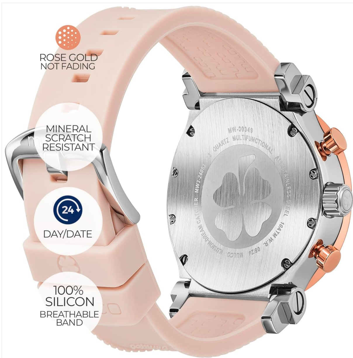
Image: Rear view of the MULCO Dream Catcher watch, displaying the stainless steel case back with an engraved model number and water resistance rating.