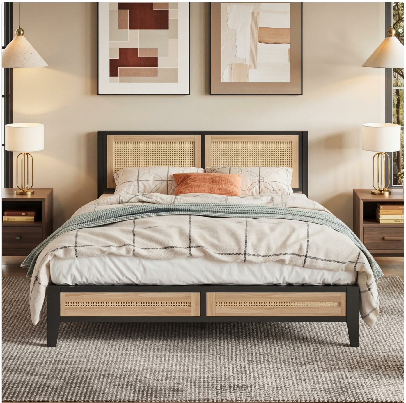
Image: LIKIMIO Full Bed Frame with Rattan Headboard and Footboard.