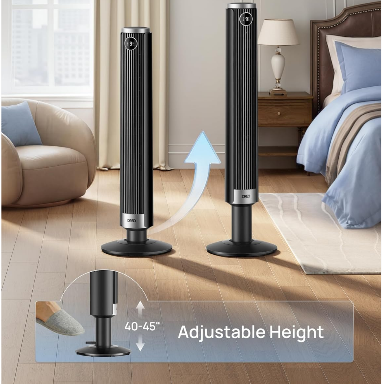
Image: The fan demonstrating its adjustable height feature, extending from 40 to 45 inches.

The fan features a control panel on top, a main tower body with air outlets, and a stable circular base. The adjustable height mechanism is located at the base of the tower.