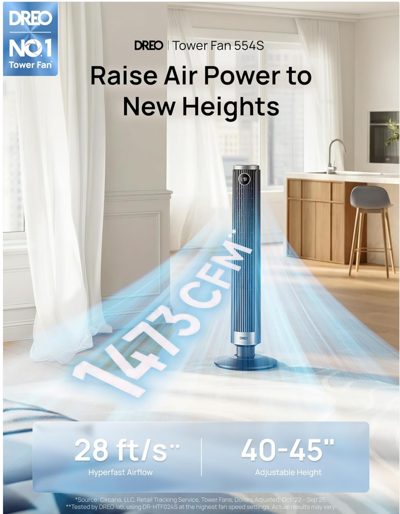
Image: Overall view of the DREO Smart Tower Fan, highlighting its sleek design and powerful airflow.

Familiarize yourself with the components of your DREO Smart Tower Fan.