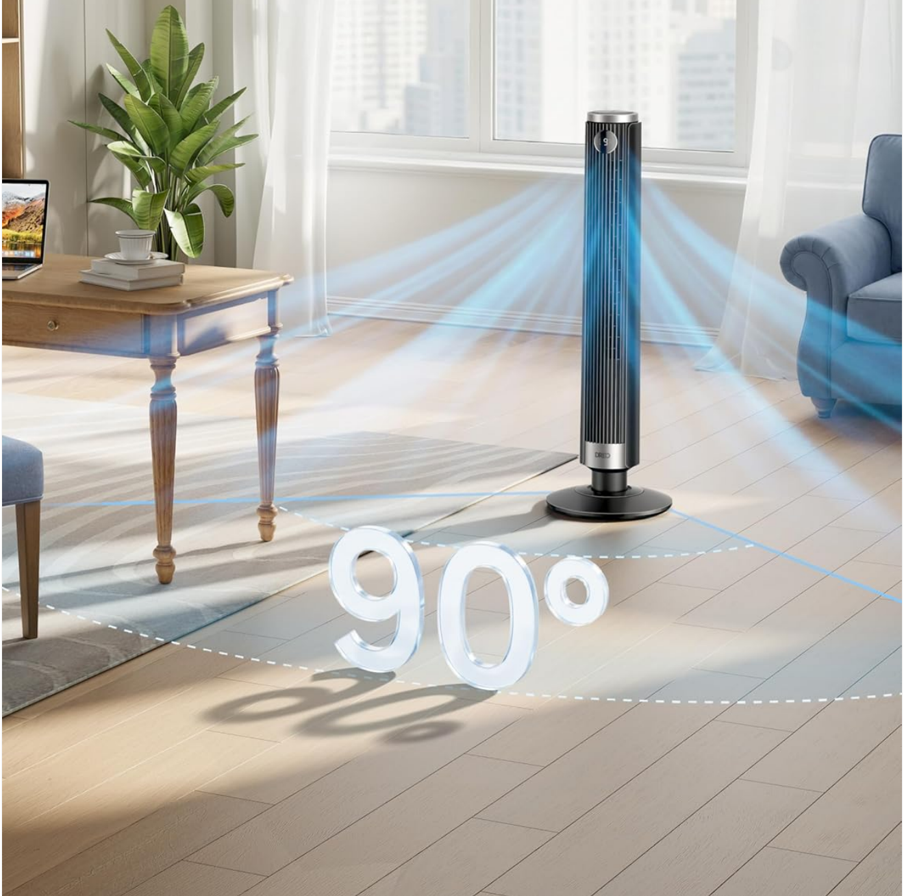
Image: The DREO Smart Tower Fan demonstrating its 90-degree oscillation feature, distributing air across a wide area.