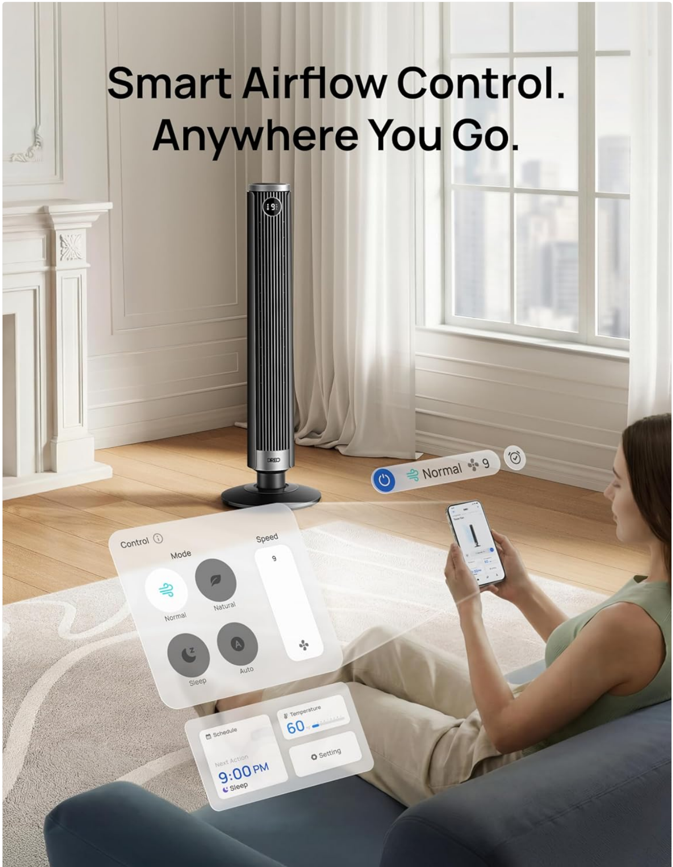
Image: A user controlling the DREO Smart Tower Fan via the DREO mobile application.