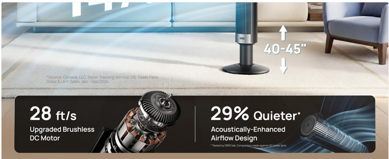
Image: Illustration of the fan's one-step height adjustment, allowing it to extend from 40 to 45 inches.