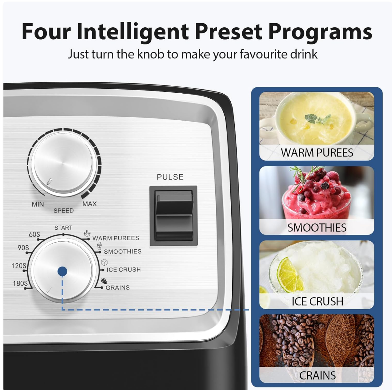
Image: Detailed view of the blender's control panel, showing the ON/OFF switch, Pulse button, Speed dial, and Preset program dial.

The Aeitto blender features an intuitive control panel for ease of use: