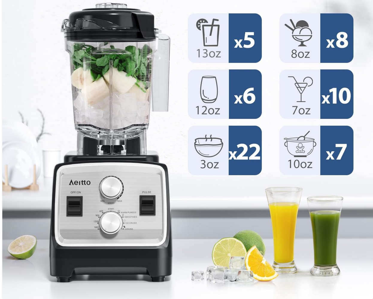
Image: Visual representation of the 68oz blender jar's large capacity, illustrating how many servings it can produce for various drink types.

The main blender jar has an extra-large 68oz capacity, suitable for preparing large batches for families or gatherings. The grinding cup has a 28oz capacity, ideal for smaller quantities of dry ingredients.