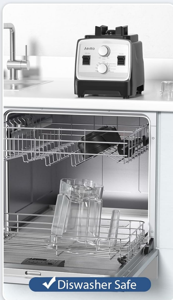
Image: Visual guide demonstrating the self-cleaning function and indicating that the blender jar and grinding cup are dishwasher safe.