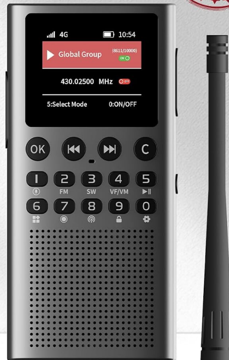
Figure 4.1: The Choyong WT2 supports both 4G (via eSIM) and Wi-Fi connectivity for internet access.