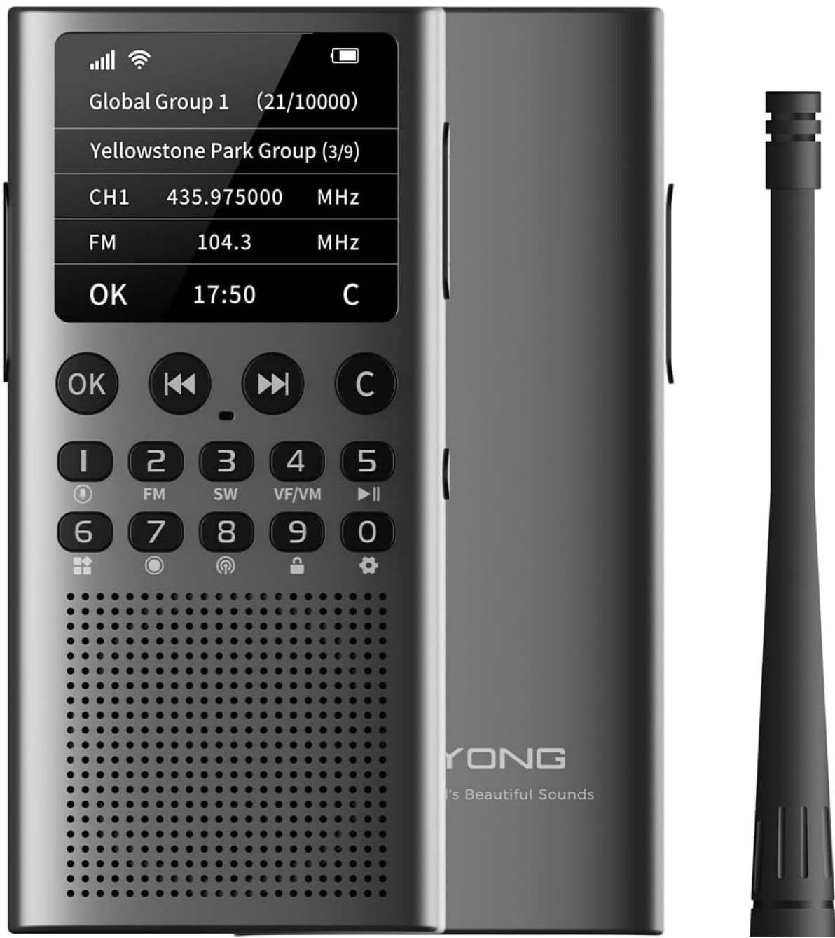
Figure 3.1: Front view of the Choyong WT2 radio, highlighting the display and control buttons.