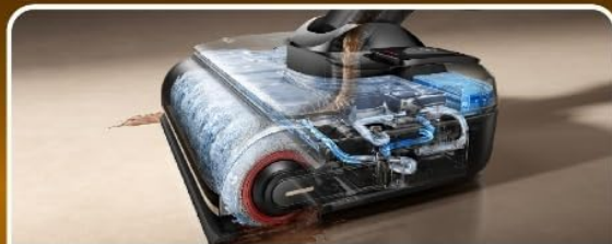
Automatic Solution Dispensing