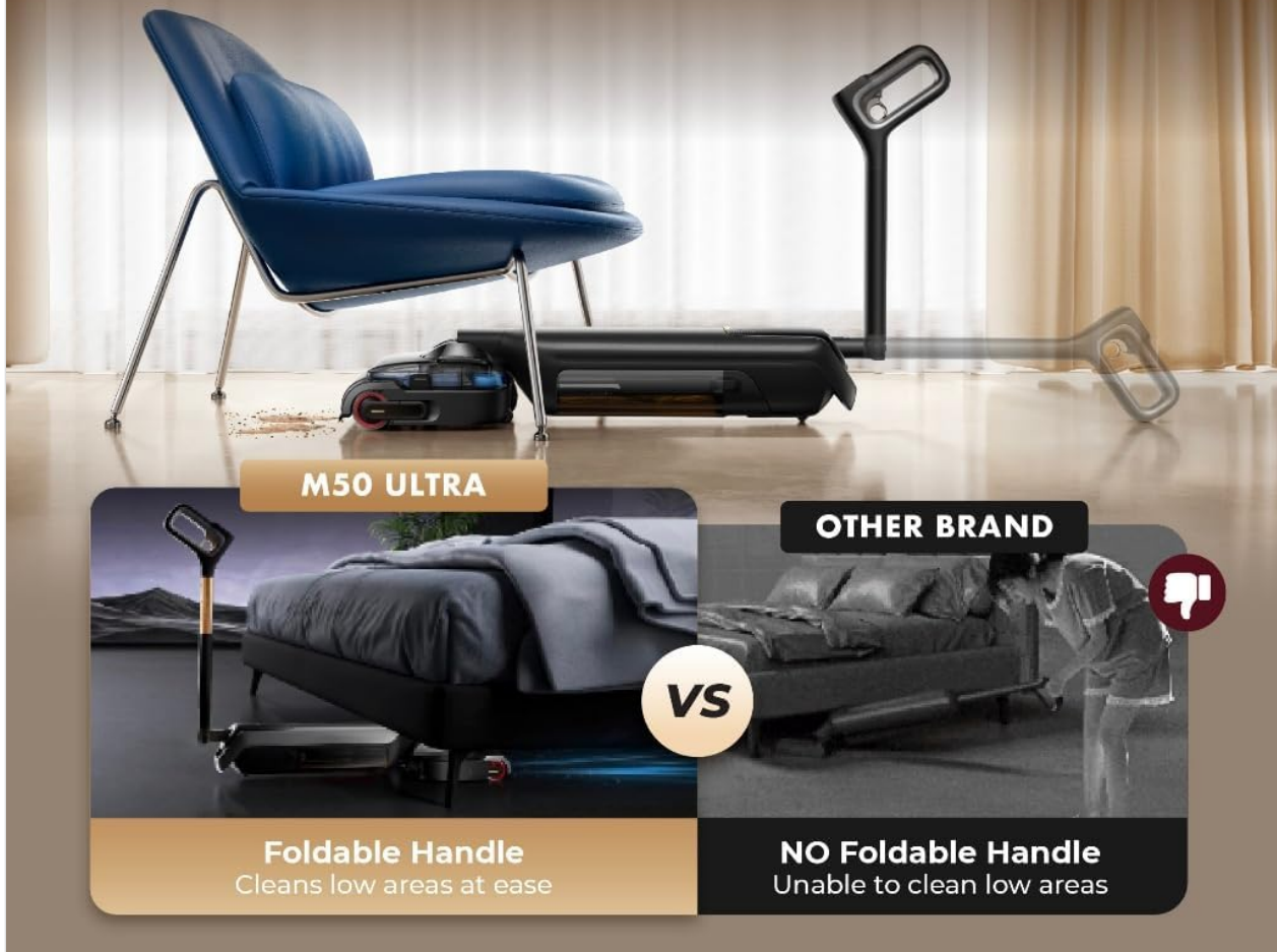
Figure 2.3: Foldable Handle for low space access.