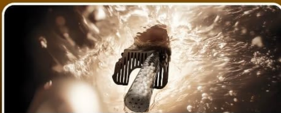
Deodorizer Stick Removes Odor