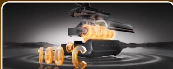
100°C Hot Wash 90°C (5mins) Hot Air Dry