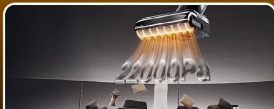
22,000 Pa Suction Clears All Heavy Debris