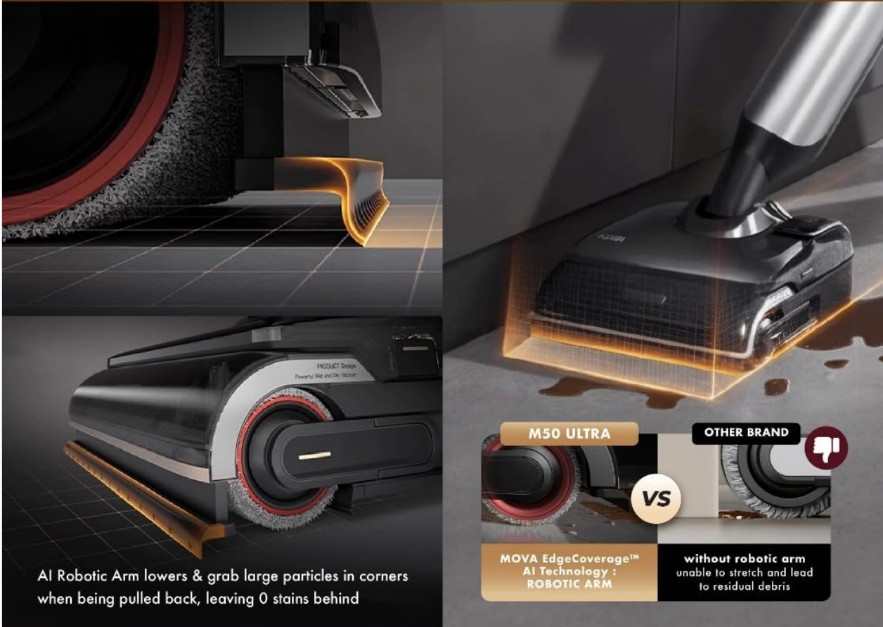
Figure 2.2: AI EdgeCoverage Robotic Arm in action.

Actively extends the arm to reach the gaps along the front wall edge, achieving 0-gap edge cleaning.