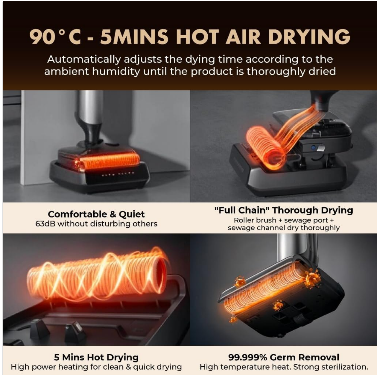
Figure 5.1: 90°C Hot Air Drying process.

Following the self-cleaning cycle, the MOVA M50 Ultra will initiate a 90°C hot air drying process for approximately 5 minutes. This prevents odor and bacterial growth on the roller brush and within the system.