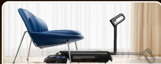
Flex-Master Pro Foldable & Clean Low Areas