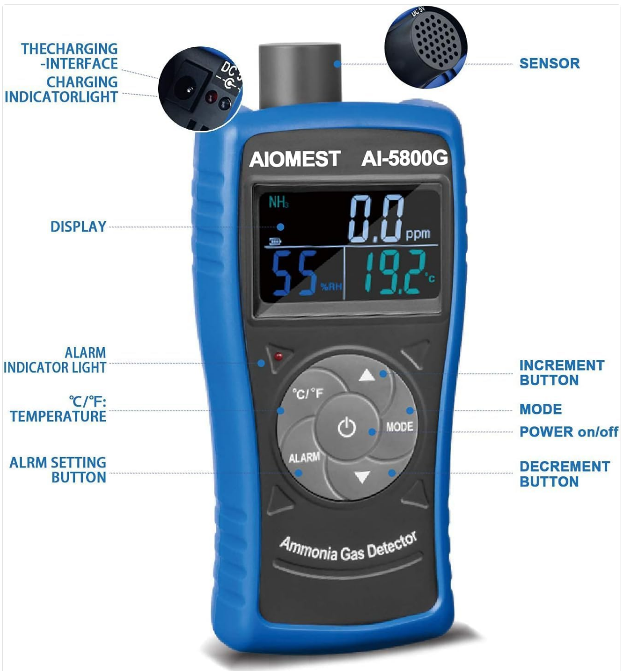
Image: Front view of the AIOMEST AI-5800G detector with key components labeled.