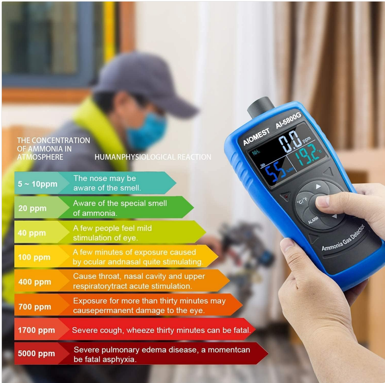
Image: A chart illustrating the human physiological reactions at various ammonia concentration levels in the atmosphere.

Understanding the potential effects of different ammonia concentrations is crucial for safety: