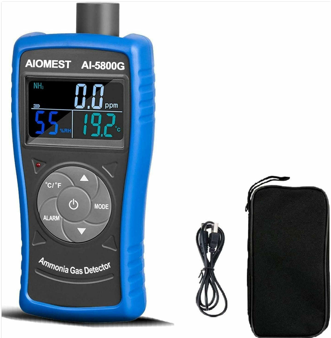
Image: The AIOMEST AI-5800G Ammonia Gas Detector displaying NH 3 , humidity, and temperature readings.