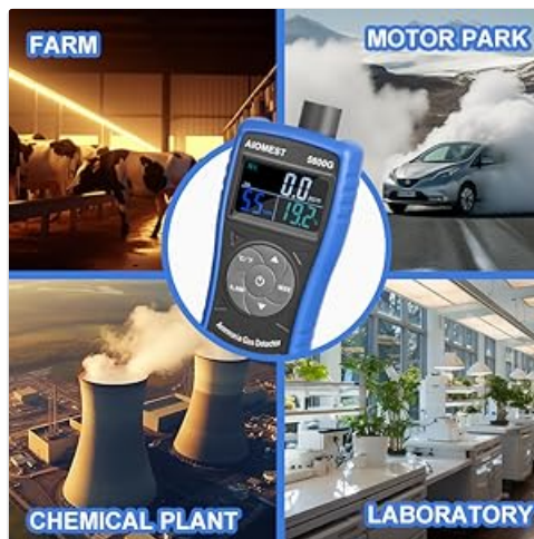
Image: The AIOMEST AI-5800G detector shown in typical application environments such as farms, motor parks, chemical plants, and laboratories.

The AIOMEST AI-5800G detector is versatile and can be used in various environments where ammonia monitoring is necessary: