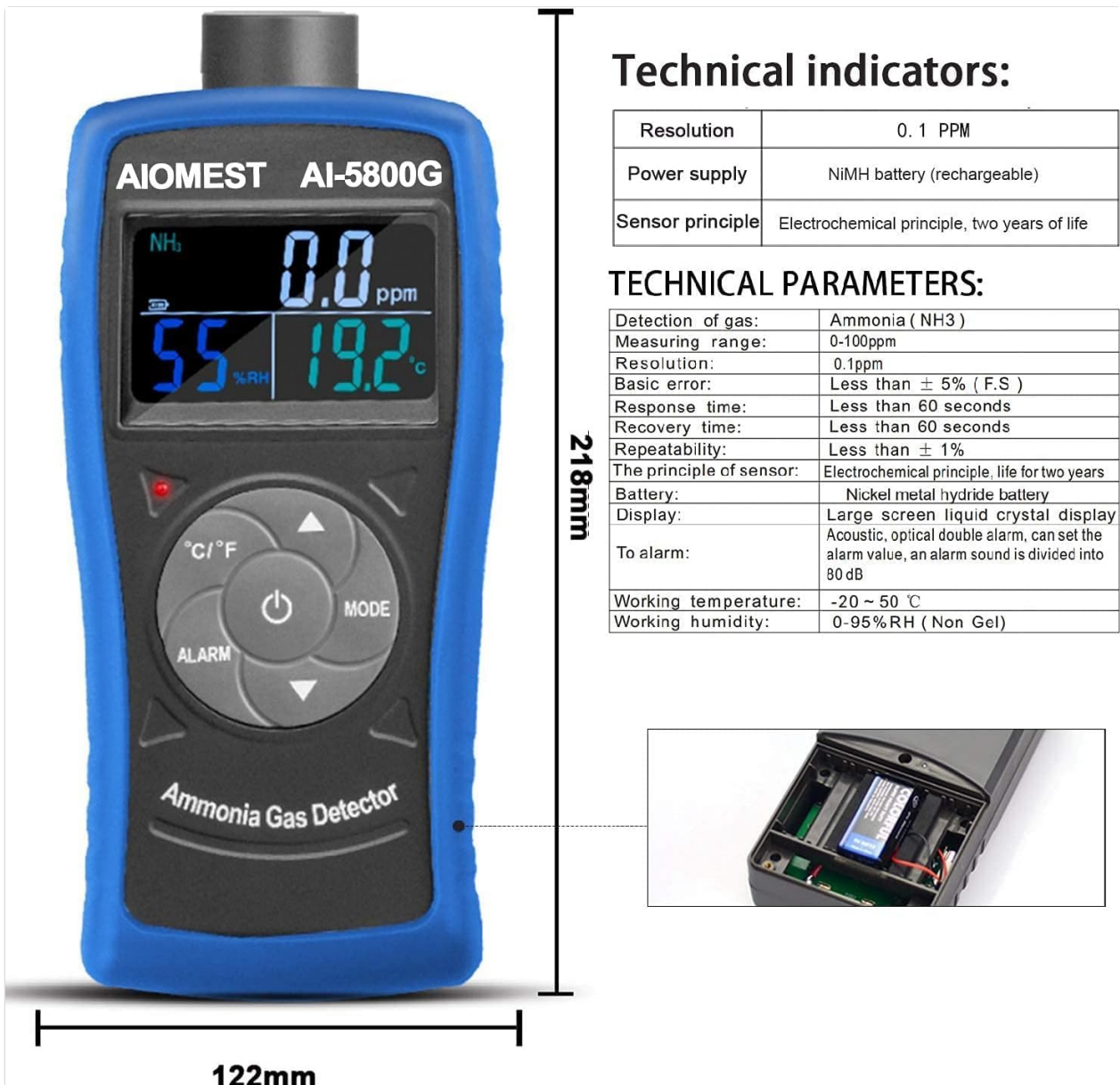
Image: Technical specifications and physical dimensions of the AIOMEST AI-5800G detector.

The following table outlines the technical specifications of the AIOMEST AI-5800G Ammonia Gas Detector: