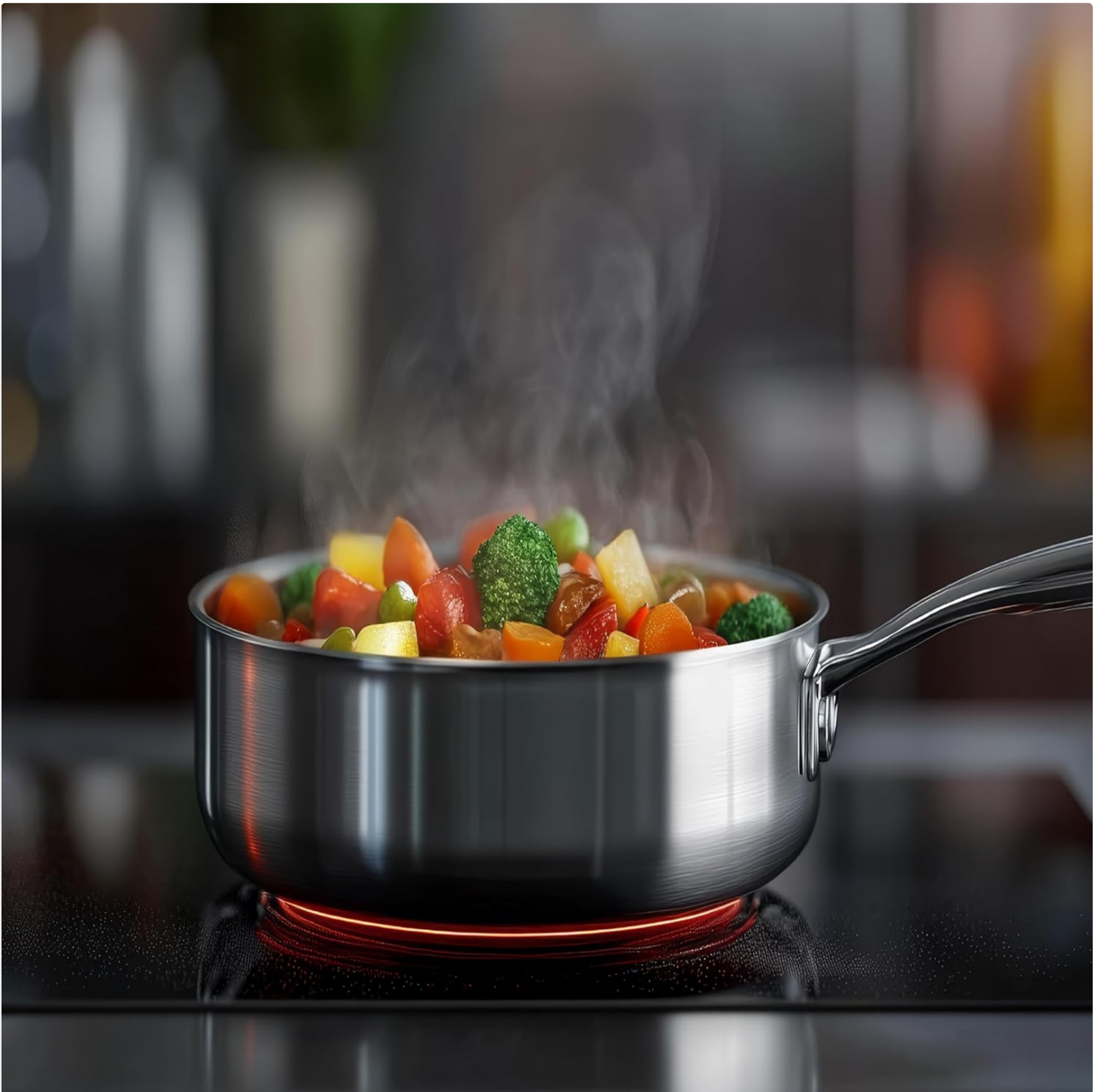
Figure 2.1: Front view of the Swan SIC21 Digital Induction Cooker, showcasing its sleek black tempered glass surface and compact design.