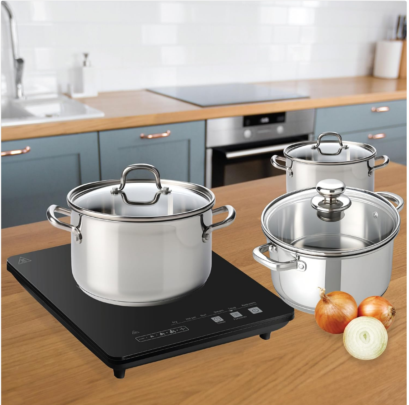
Figure 4.2: The Swan Induction Cooker in a kitchen setting, demonstrating its use with various induction-compatible cookware.