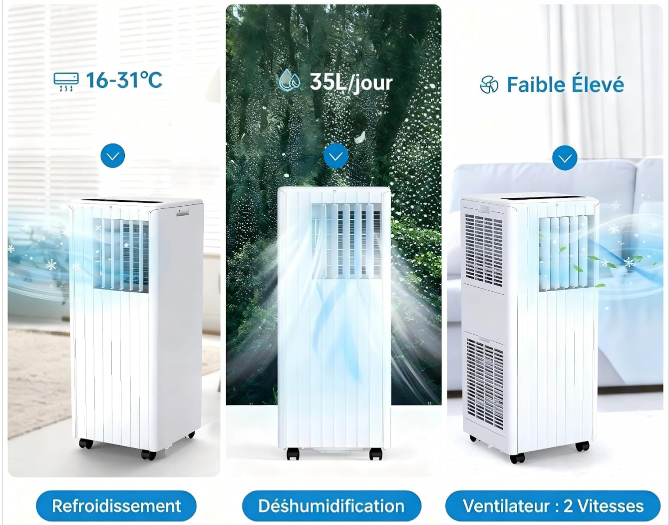
Illustration of the Garvee portable air conditioner demonstrating its three operational modes: Cooling (16-31°C), Dehumidification (35L/day), and Fan (Low/High speeds). Each mode is depicted with visual cues like snowflakes for cooling, water droplets for dehumidification, and air movement for fan.