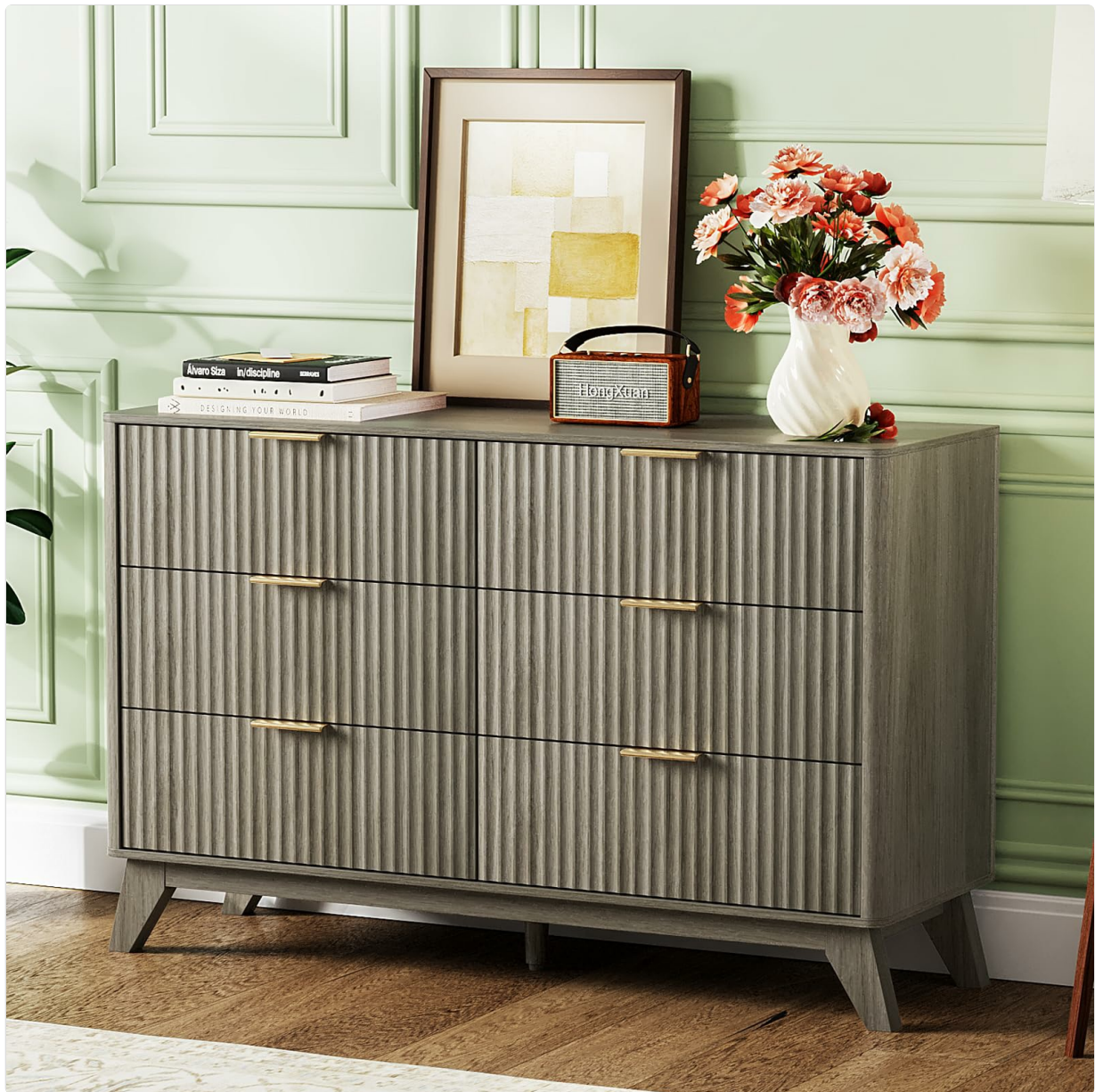
Image 1.1: VINGLI Fluted Grey 6-Drawer Dresser. This image shows the assembled dresser with its six drawers, fluted design, and rounded edges.