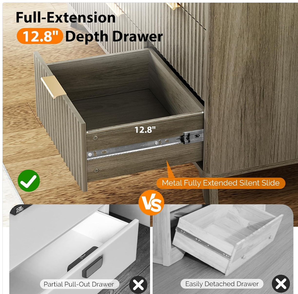
Image 4.1: Full-extension 12.8 inch deep drawer. This image highlights the 12.8-inch internal depth of the drawers and the metal fully extended silent slides, demonstrating the smooth operation and full access.

The dresser features six full-extension drawers equipped with quality three-section soft-close drawer slides. This design allows the drawers to open and close smoothly and quietly, providing full access to the drawer's contents and preventing slamming.