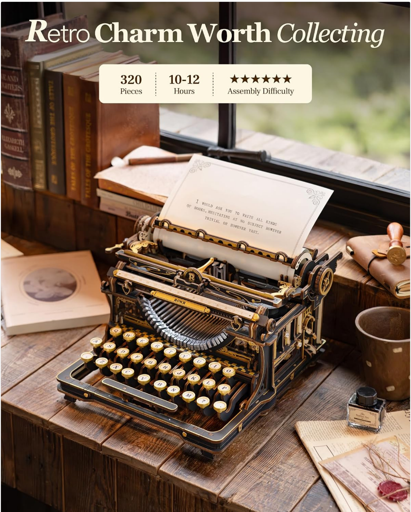
Image: The assembled ROKR 3D Wooden Mechanical Typewriter, accompanied by its key specifications.