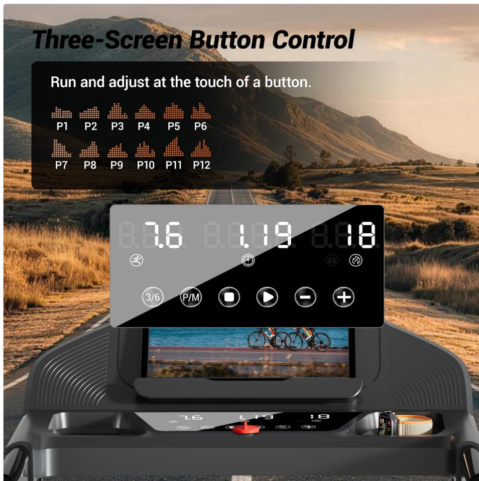
The three-screen button control allows for easy adjustment of settings.